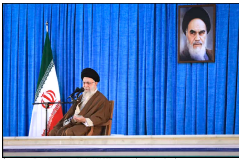
Supreme Leader Ayatollah Ali Khamenei speaks during a ceremony commemorating the death anniversary of the late revolutionary founder Ayatollah Khomeini at his mausoleum just outside Tehran, Iran.

Biden said that Congress has now preserved "the full faith and credit of the United States." But even with the House and Senate putting aside differences to finally rush through the agreement over the last week, the US economy's reputation took a hit.