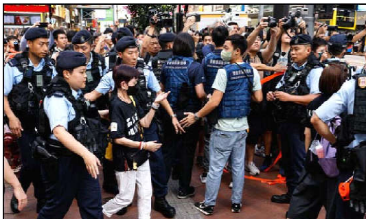
Police detain a person in downtown on the 34th anniversary of the 1989 Beijing's Tiananmen Square crackdown, near where the candlelight vigil is usually held, in Hong Kong, China.

Dagalo. For weeks, Saudi Arabia and the United States have been mediating between the warring parties. On May 21, both countries successfully brokered a temporary cease-fire agreement to help with the delivery of much-needed humanitarian aid to the war-torn country. Their efforts, however, were dealt a blow when the military announced on Wednesday it would no longer participate in the cease-fire talks.