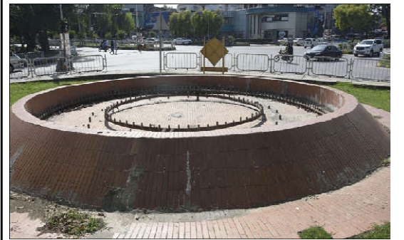
ISLAMABAD: A view of dilapidated fountain on a green belt at Aabpara Chowk, as needs attention for concern authority, in Federal Capital.