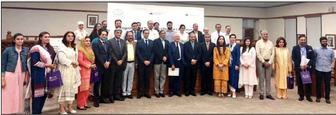
Federal Minister for Law & Justice Senator Azam Nazir Tarar attended the closing ceremony of first ever 3 day teacher training workshop for law faculty members "Designing and Teaching Effective Law Courses for Legal Academics" as a Chief Guest.