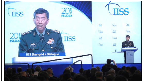
Chinese Defence Minister Li Shangfu speaks at the IISS Shangri-La Dialogue in Singapore.

cord that restricted it. Trump restored crippling sanctions on Iran that have contributed to a severe economic crisis without forcing any concessions from its leaders. Iran has also lent support to Russia's invasion of Ukraine, supplying armed drones that have wreaked havoc on the Ukrainian capital, Kyiv. "Some people are mistaken to think if we back down from our stances in certain cases that will cause the enmity of the U.S., the global arrogance, or Israel toward us to diminish," said Khamenei, who has the final say on all major Iranian policies. "This is a mistake."