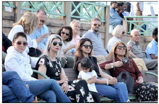
ISLAMABAD: Spectators watching final of Junior Polo Exhibition Match played between Islamabad Club Junior and Dubai Polo and Equestrian Club Junior teams at Islamabad Club Polo Ground.