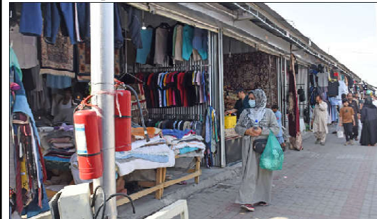
ISLAMABAD: A view of fire extinguisher install bed shop keeper outside his shop at H-9 Sunday Bazar as after fire in weekly Sunday Bazar shop-keepers are taking care by their own.