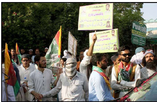
LAHORE: Members of Pakistan Nazriyati Party are holding protest demonstration against detention of Dr. Aafia Siddiqui by US authorities, at Lahore press club.