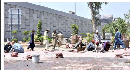
ISLAMABAD: Workers working on 9th Avenue Flyover at IJP Road during development work in the city.

ISLAMABAD (APP): The Indus River System Authority (IRSA) on Sunday released 158,700 cusecs of water from various rim stations with an inflow of 188,500 cusecs. According to the data released by IRSA, the water level in River Indus at Tarbela Dam was 1426.06 feet and was 28.06 feet higher than its dead level of 1,398 feet. Water inflow and outflow in the dam were recorded as 59,200 cusecs and 60,000 cusecs respectively. The water level in River Jhelum at Mangla Dam was 1131.70 feet, 81.70 feet higher than its dead level of 1,050 feet. The inflow and outflow of water were recorded as 60,600 cusecs and 30,000 cusecs respectively.