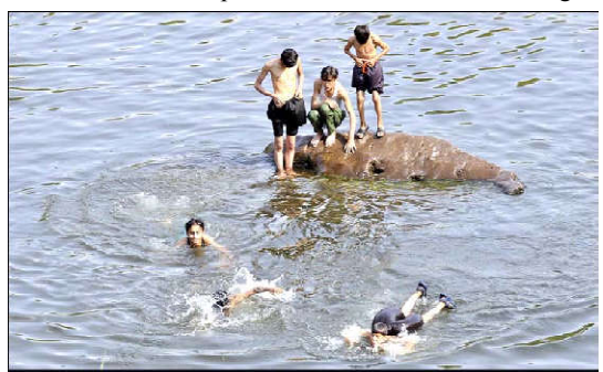
ISLAMABAD: Youngsters swimming to get some relief from hot weather at Rawal Lake spill way stream.

Independent Report police said. Minister for Interior Rana Sanaulah Khan and Minister for Federal Education and Professional Training Rana Tanveer Hussain have taken special interest for this initiative and termed it as a step to pay immense tribute to the sacrifices rendered by Martyrs. The admissions against the available slots shall have a priority for children of Shuhada followed by the children of Islamabad police personnel and others. The status of the college will be elevated to residential cadet college jointly managed by FDE and Islamabad police after a specified period of time having demonstrated quality repute and subject to the viability assessed by both FDE and Islamabad police.