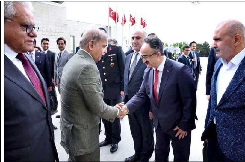
ANKARA: Prime Minister Muhammad Shehbaz Sharif departs from Ankara after completing his two day official visit of Turkiye.

The prime minister had travelled to Turkiye to join the world leaders in the inauguration ceremony of President Recep Tayyip Erdogan.