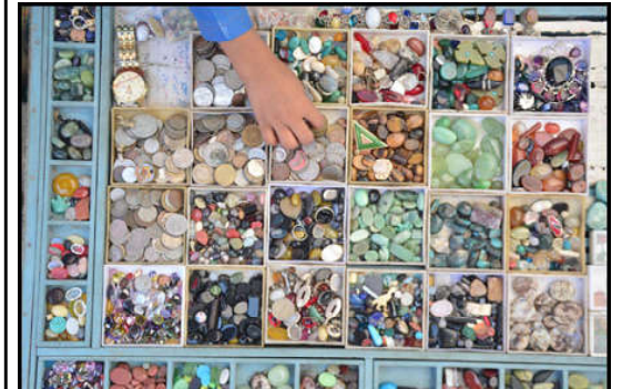
RAWALPINDI: A man is busy in selecting and purchasing gemstone and rings from roadside vending in the city.

During the meeting, representatives of MFA highlighted the growth of Sharia compliant mutual funds and proposed that short term Sharia compliant sukuk should be launched.