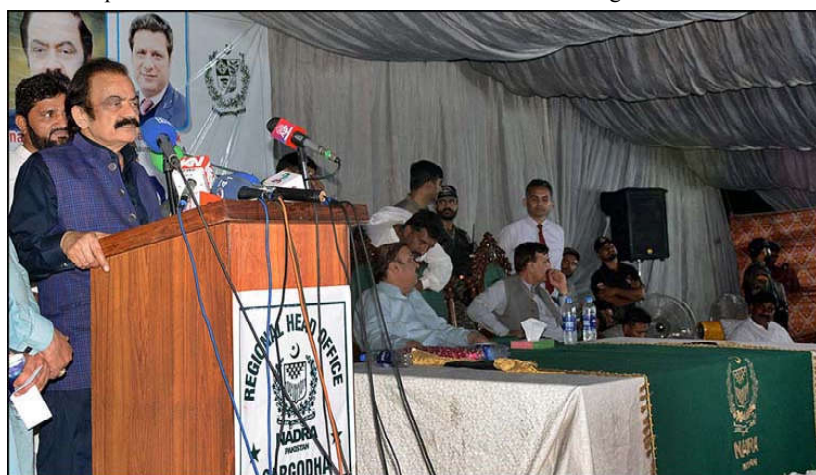
FAISALABAD: Interior Minister Rana Sana Ullah Khan addressing a public gathering during inauguration ceremony of NADRA Registration Center Aminpur Bangla and Passport Counter in Chak No.30-JB on Narwala-Aminpur Road.

The speaker said that elections should be held in October, the events of May 9 had weakened and disgraced the country in the world, the incidents should never have happened and the people of Pakistan had suffered a lot. Raja Pervaiz Ashraf said that the military is our saviour who fights against terrorists and protects our borders, they are either warriors or martyrs and it is enmity with the country to stir up emotions, spread false information and conspire against our forces.