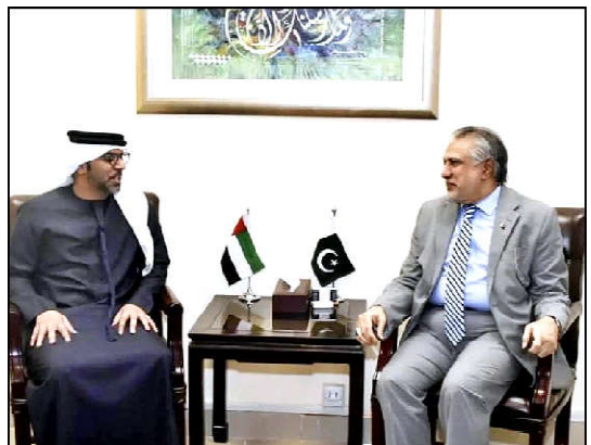
ISLAMABAD: H.E. Hamad Obaid Ibrahim Salim Al-Zaabi, Ambassador of the United Arab Emirates called on Federal Minister for Finance & Revenue Senator Mohammad Ishaq Dar.

ISLAMABAD (APP): Ambassador of the United Arab Emirates, Hamad Obaid Ibrahim Salim Al-Zaabi Thursday called on the Federal Minister for Finance and Revenue Senator Mohammad Ishaq Dar. During the meeting, they conversed about the deep rooted brotherly ties and discussed various areas of common interest for further strengthening the trade and economic ties between the two countries, said a press statement issued by finance ministry. The ambassador also reciprocated interest of the UAE government for expanding investment in various sectors of the economy of Pakistan. Ishaq Dar acknowledged that UAE had been a great partner of Pakistan in various fields including energy, refinery, petroleum and trade. He appreciated and welcomed the investment proposals of the UAE in Pakistan and assured of complete support and cooperation by the government.