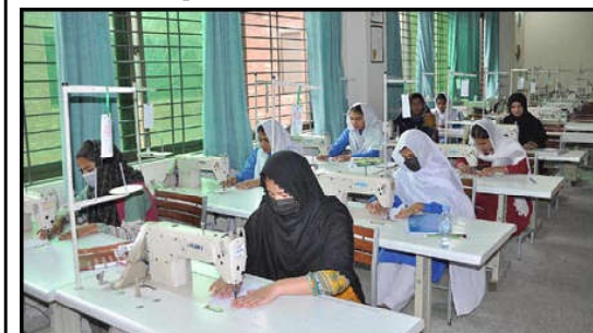
SARGODHA: Student attends classes during Skill Summer Camp 2023 at Government College of Technology for Women.

The board collected Rs 205 billion in May 2023 under the head of domestic income tax compared to Rs