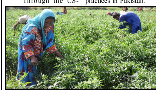
HYDERABAD: Farmers are engaged in harvesting peas in the field.