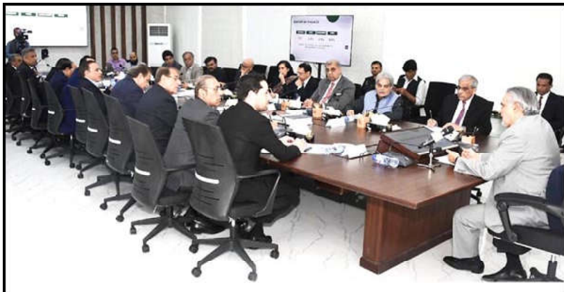
ISLAMABAD: Finance Minister Senator Mohammad Ishaq Dar held a meeting with delegation of Islamabad Industrial Association on Budget 2023-24 proposals, at FBR.