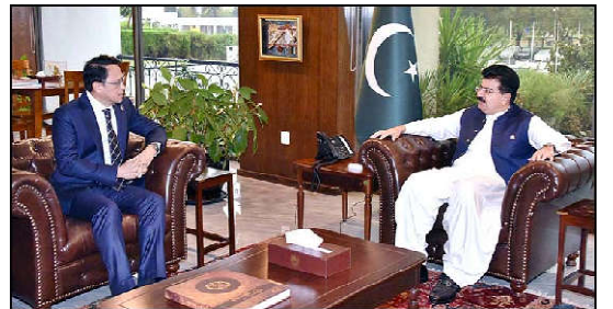
ISLAMABAD: Chakkril Krachaiwong, Ambassador of Thailand to Pakistan called on Chairman Senate, Muhammad Sadiq Sanjrani at Parliament House.

ISLAMABAD (Online): Jahanvir Tareen has decided to go to London to meet Nawaz Sharif for consultation on future electoral strategy and removal of Nawaz Sharif reservations. On the other hand Jahanvir Tareen has completed his contacts with former members of national and provincial assembly of PTI have been completed. Jahanvir Tareen is all set on his mission of carving out new political party. Over 50 former members of National Assembly and senators of PTI have assured their support to Jahanvir Tareen.