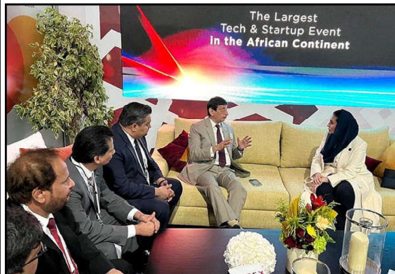
MOROCCO: Federal Minister for IT and Telecommunication Syed Amin Ul Haque in a meeting with Secretary General Digital Cooperation Organization (DCO) Ms. Deemah Al-Yahya on the Sidelines of GITEK Africa Digital Summit.

The meetings discussed global challenges including revolutionary initiatives in the IT &