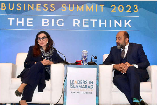
ISLAMABAD: Federal Minister for Climate Change Senator Sherry Rehman addressing the concluding session of the second day of the Leaders in Islamabad Business Summit.