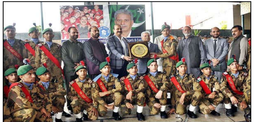
ISLAMABAD: Federal Minister for Education, Professional Training Rana Tanveer Hussain in a group photograph with students during his visit at Pakistan Sweet Home.