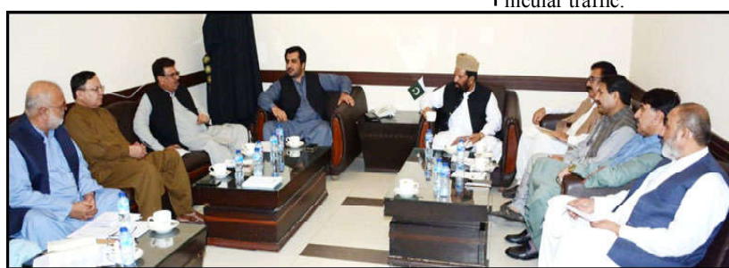
QUETTA: In light of ruling of Speaker Balochistan Assembly, QESCO Chief briefed MPAs regarding load shedding