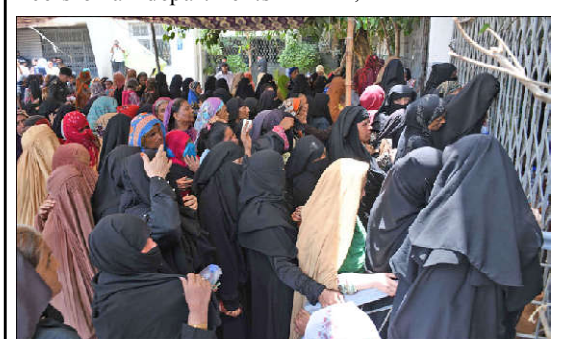
KARACHI: Woman line up at Benazir Income Support Center after Stampede broke out during the distribution of funds of the Benazir Income Support Programme (BISP) among deserving women as several women were injured in the stampede at Benazir Income Support Center in Provincial Capital.

A detailed briefing was given by Deputy Commissioner Loralai Suban Saleem Dashti while addressing the meeting said, "All departmental officers and their supporting staff are on alert, the machinery of all departments is on standby in case of any emergency during the rains, all government rest houses, government buildings have been reserved, the control room of police department and Levies have been restored."