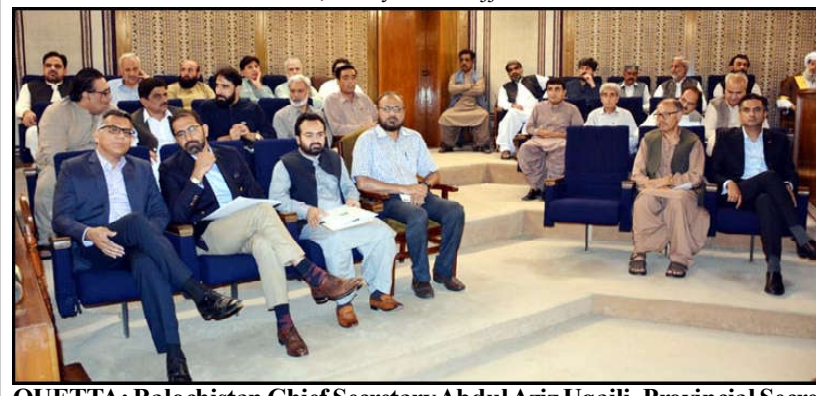
QUETTA: Balochistan Chief Secretary Abdul Aziz Uqaili, Provincial Secretaries and others watching Balochistan Assembly proceeding

The minister said the policy also included special measures to preserve classic music, and initiatives for local and folk music to promote regional singers and artists.