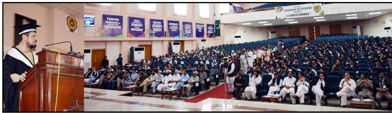
PESHAWAR: Governor Khyber Pakhtunkhwa Haji Ghulam Ali addressing 1st Convocation of University of Technology Nowshera at chief guest