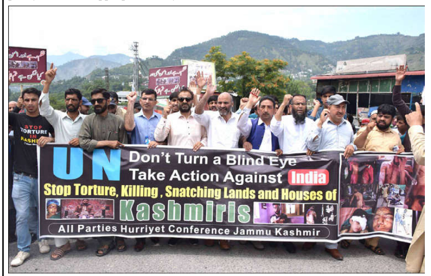
MUZAFFERABAD: Activists of All Parties Hurriyat Conference holds banner and shouting slogans during protest in the favor of their demands in the capital of AJK.

count, the statement said. The measures have increased the upside risks to the inflation outlook, the MPC noted and viewed that additional tax measures were likely to contribute to inflation both directly and indirectly, while the relaxation in imports may exert pressures in the foreign exchange market. "The latter may result in higher-than-earlier anticipated exchange rate pass-through to domestic prices," it further added. The MPC termed the decision as necessary to keep real interest rate firmly in the positive territory on a forward-looking basis and hoped that it would help further anchor inflation expectations - which are already moderating over the last few months.