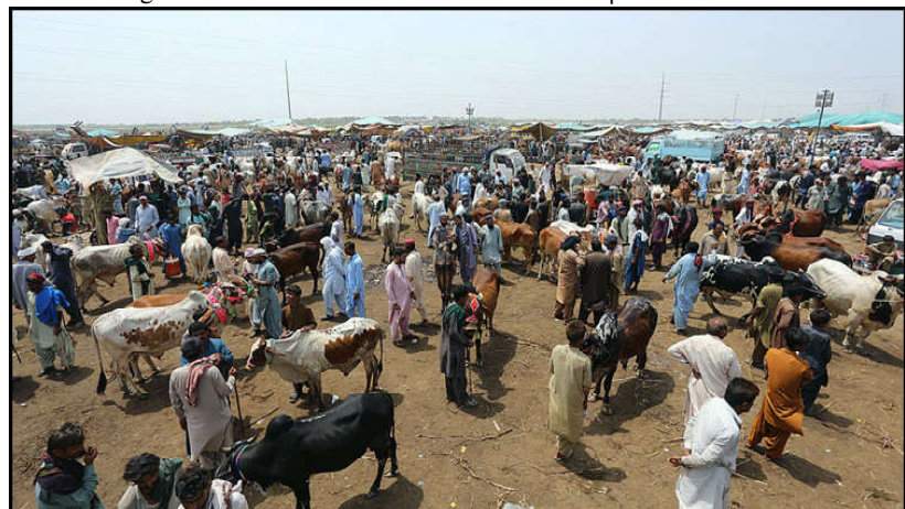
HYDERABAD: Vendors selling sacrificial animals at Animal Market Hathri Bypass in connection with upcoming Eid ul Azha.

The objective of celebrating this day was to provide a platform for MSME owners to tell their stories of entrepreneurship and its challenges, while governments, international organizations and business support organizations show their commitment to supporting their development, he explained.