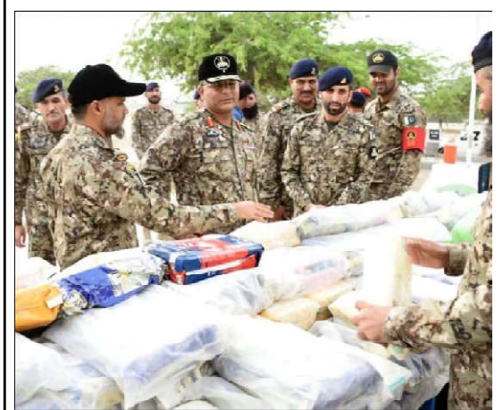
HUB: Pakistani Coast Guard Officials are showing huge apprehended drugs worth millions of rupees, during raid on local area of Kapkpar, during press conference held at PCG Headquarters.

He also alleged that an armed group is being patronized and given funds even.