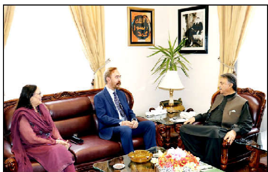
QUETTA: Chairman Ansar Burney Trust and Governor Balochistan Malik Abdul Wali Khan Kakar

ISLAMABAD (APP): Prime Minister Muhammad Shehbaz Sharif on Monday directed the provincial and district authorities to immediately take rainwater drainage measures in Lahore. Taking notice of the problems faced by the dwellers of Lahore, the prime minister also directed the relevant authorities to remain alert in the situation arising out of the current rainy spell, the PM Office Media Wing said in a press release. No leniency should be shown in addressing the public issues and grievances, it was further added. The authorities were tasked to continuously monitor the situation with prompt measures in place. The prime minister further stressed that considering the situation, alternate routes should be timely identified for smooth vehicular traffic.