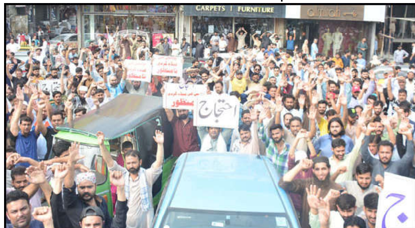
RAWALPINDI: All Pakistan Mobile Phones Association are shouting slogans during protest in the favor of their demands at Sadr area in City.

the global market with effective marketing with the right combination of factors, including export potential, design and innovation, technology adoption, and skill development. Chairing the PFC executive committee meeting, he said Pakistan has a skilled labor force and a rich heritage of craftsmanship in furniture making.