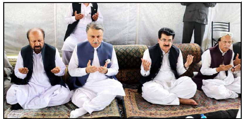
QUETTA: Governor Balochistan Malik Abdul Wali Khan Kakar condoling with Chairman Senate Muhammad Sadiq Sanjrani on sad demise of his aunt