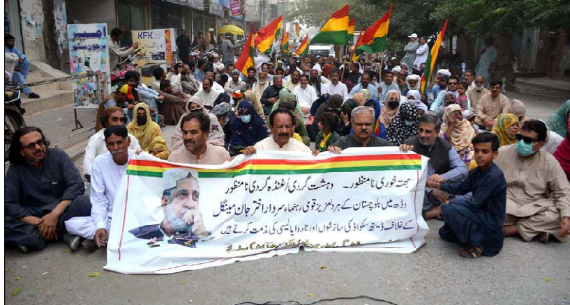
QUETTA: Activists of BNP-Mengal hold protest in favor of their demands in front of the Quetta Press Club.

ISLAMABAD (INP): In a highly productive 51st session, the National Assembly (NA) successfully approved the federal budget for the fiscal year 2023-24. Commencing on March 27, the session witnessed the presentation of the Finance Bill, 2023 on June 9, 2023, sparking a thorough and engaging debate on the budget. The House, after incorporating numerous recommendations from the Senate, passed the Finance Bill, 2023, alongside the adoption of four resolutions addressing significant issues. The formal budget debate commenced on June 12, with the Leader of the Opposition initiating discussions on the federal budget in accordance with parliamentary tradition. According to the data compiled through the website of NA and observation of proceedings, a substantial number of lawmakers actively participated in the debate, with around 86 out of 174 NA members lending their voices to the discussions—a significant increase compared to previous years. It is noteworthy that the incumbent 15th NA