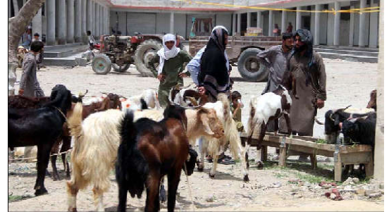
QUETTA: Sacrificial animals are being selling at a roadside for the upcoming festival Eid-ul-Azha, at Jail road.