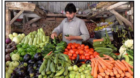
QUETTA: A vendor arrange the fresh vegetables to attract customers.

the allocation for BISP to facilitate maximum beneficiaries, he informed. He said the Pakistan Muslim League-N, with the help of coalition partners, had protected the country from falling into the default line. He blamed Pakistan Tehreek e Insaaf (PTI) government for the current economic situation, saying that it had created mistrust with IMF. He said the government was making all-out efforts to dispel the impression created by the PTI chief during his tenure.