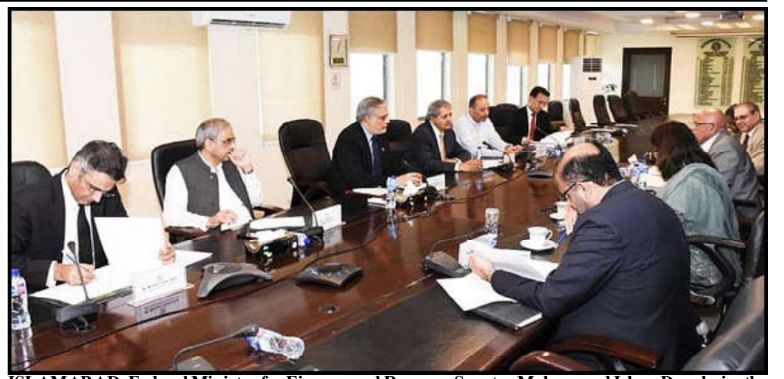
ISLAMABAD: Federal Minister for Finance and Revenue Senator Mohammad Ishaq Dar chairs the meeting of the Cabinet Committee on Inter-Governmental Commercial Transactions (CCoIGCT).

This occasion celebrates the signing of the sixth batch of the program in Pakistan. For this batch, the maximum number of slots for JDS participants in Pakistan is 17 seats for the Master's degree.