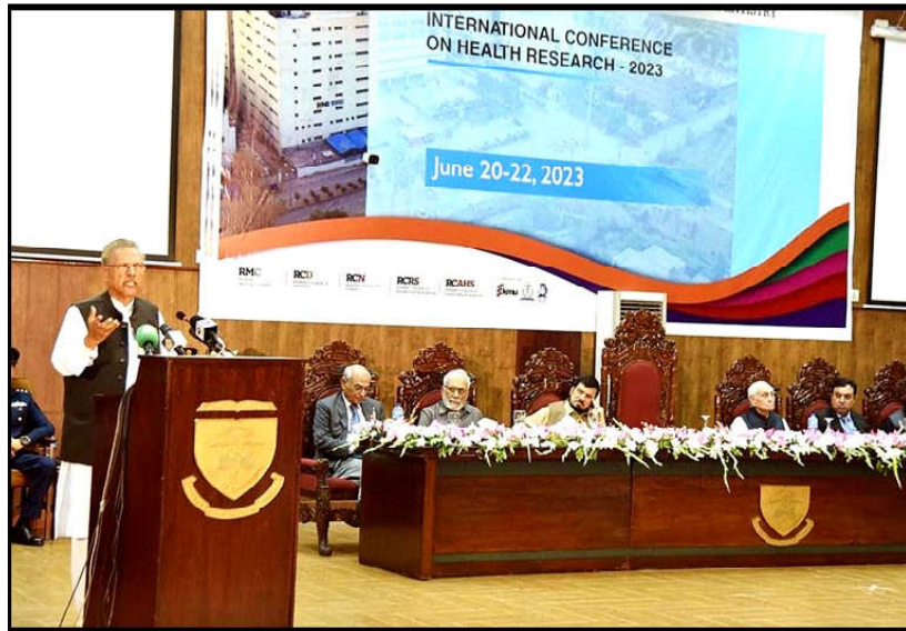
PESHAWAR: President Dr. Arif Alvi addressing the International Conference on Health Research organized by Rehman Medical Institute.