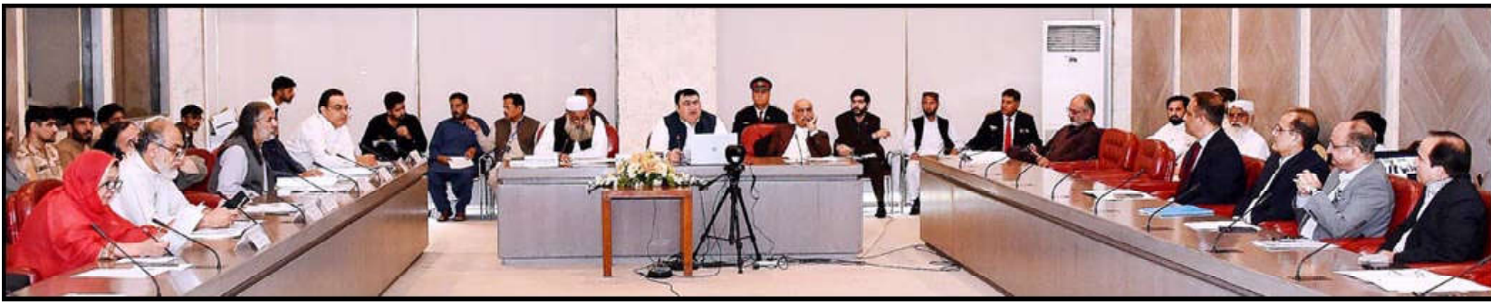
ISLAMABAD: Deputy Speaker National Assembly Zahid Akram Durrani chairing meeting of the Special Committee on Balochistan at Parliament House.