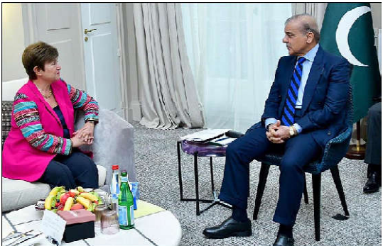
PARIS: Prime Minister Muhammad Shehbaz Sharif in a meeting with Ms. Kristalina Georgieva, Managing Director International Monetary Fund.

PARIS (INP): Prime Minister Muhammad Shehbaz Sharif held a meeting with French President Emmanuel Macron on the sidelines of the New Global Financing Pact Summit being held in Paris, France. The Prime Minister appreciated President Macron for convening the New Global Financing Pact Summit. He also thanked the French President for inviting him to the Summit and for his warm hospitality. Speaking on this occasion, Shehbaz Sharif hailed the French President's bold step towards a system, based on financial justice with developing countries. He said the developing countries are facing problems of non-availability of resources, burden of interest for debt payments and slow development. The Prime Minister said under the new Global Financing Pact, help of the indebted developing countries is the need of the hour so that the people of these countries can get relief. He said devastating effects of climate change have added the hardship to already troubled developing countries. Shehbaz Sharif praised the French President saying that he made a significant effort to create global consensus on an important issue. On this occasion, the French President thanked Prime Minister Shehbaz Sharif for attending the New Global Financing Pact Summit. During the meeting, the two leaders also agreed to remain engaged on issues of mutual interest. Prime Minister