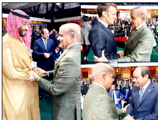
PARIS: Prime Minister Muhammad Shehbaz Sharif meets Crown Prince and Prime Minister of the Kingdom of Saudi Arabia, President of France Emmanuel Macron and President of Egypt Abdel Fattah El-Sisi during New Global Financing Pact Summit

On the occasion, the president was given a briefing on the financial and administrative affairs of the provincial universities.