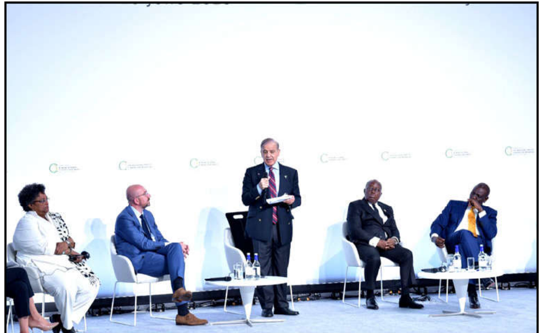
FRANCE: Prime Minister Muhammad Shehbaz Shaif addresses the round table discussion "Innovating with instruments and financing to address new vulnerabilities" at Summit for New Global Financing Pact being held in France.

He said the people of Pakistan faced crises and problems in the past courageously and they would also overcome the adverse effects of the floods.