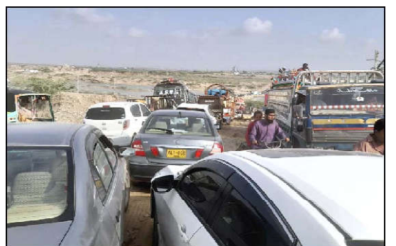
HUB: View of worst traffic jam on Hub River alternate route, showing the negligence of concerned authority in Hub.