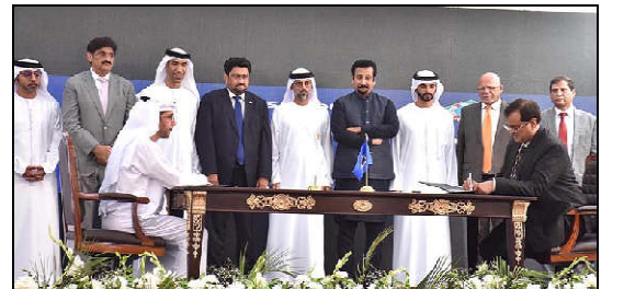
KARACHI: Federal Minister for Maritime Affairs Syed Faisal Ali Subzwari's witnessing MoU Signing Ceremony between KPT & UAE during the inauguration ceremony of Karachi Gateway Terminal Limited.

ISLAMABAD (APP): Federal Minister for Planning and Development Prof Ahsan Iqbal on Thursday said the government had earmarked Rs 25 billion for imparting elementary education to drop-out children in the country. Addressing the Pakistan Learning Conference 2023, he expressed confidence that investing in early childhood education would lead to a significant reduction in dropout rates and enable children to fully utilise their inherent potential. Ahsan Iqbal underscored that intellectual growth in the early period of children was an essential requisite for their later success and for leveraging the impending available opportunities in their lives. "The children who receive early childhood education experience lower failure rates, exhibit better academic performance, and are more likely to pursue higher education," he added. Ahsan Iqbal stressed that investing in early childhood education was an investment in the nation's development and future, as the growth and prosperity of a nation depended on the quality of education provided during the crucial phase. The survival and progress of nations in the modern era were not determined solely by military might but by the quality of their education systems, he stressed. The minister said classrooms and laboratories, where knowledge was imparted and creativity was nurtured, held the key to a nation's success.