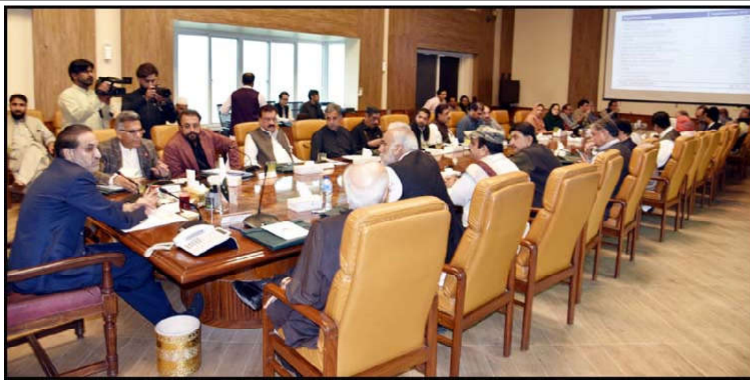
QUETTA: Balochistan Chief Minister Mir Abdul Qudus Bizenjo presiding over meeting of Provincial Cabinet