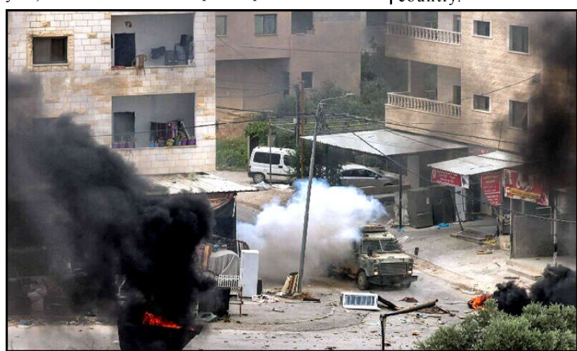
An explosive device left by Palestinians, detonated during an Israeli army raid in Jenin in the occupied West Bank.

Torrential rain and strong winds on Thursday and Friday caused damage in dozens of towns in the state of Rio Grande do Sul, including its capital Porto Alegre — the latest in a string of weather-related disasters to hit South America's biggest country.