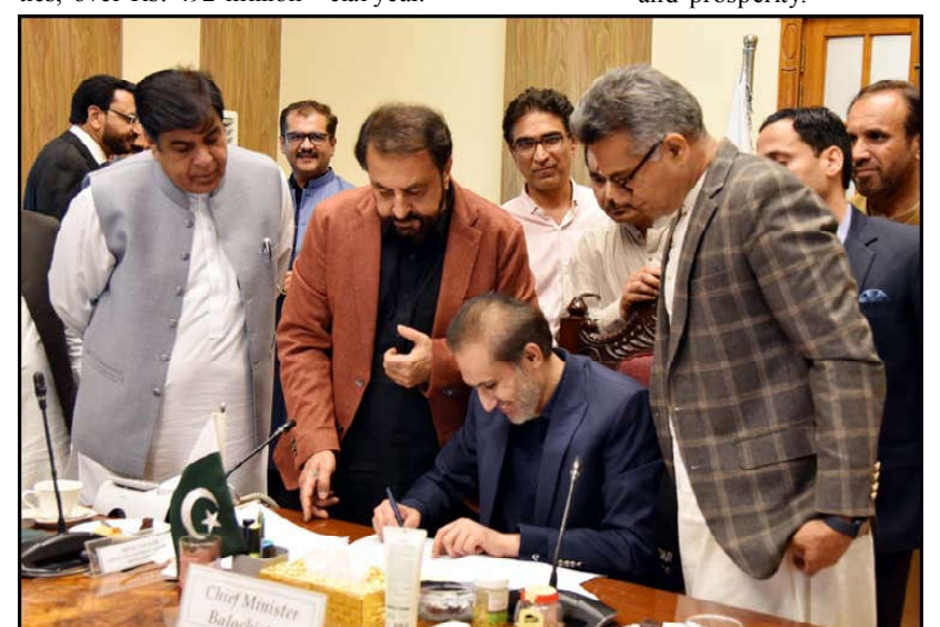
QUETTA: Balochistan Chief Minister Mir Abdul Quddus Bizenjo signing budget 2023-24 documents after approval from Provincial Cabinet

He on the occasion highlighted certain achievements made in different sectors. He said that the province is heading towards the development and prosperity.