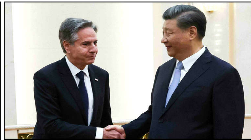
US State Secretary Antony Blinken (L) shakes hands with China's President Xi Jinping at the Great Hall of the People in Beijing.

Away from the cameras, Wang told Blinken that his trip "comes at a critical juncture in China-US relations", according to state broadcaster CCTV.