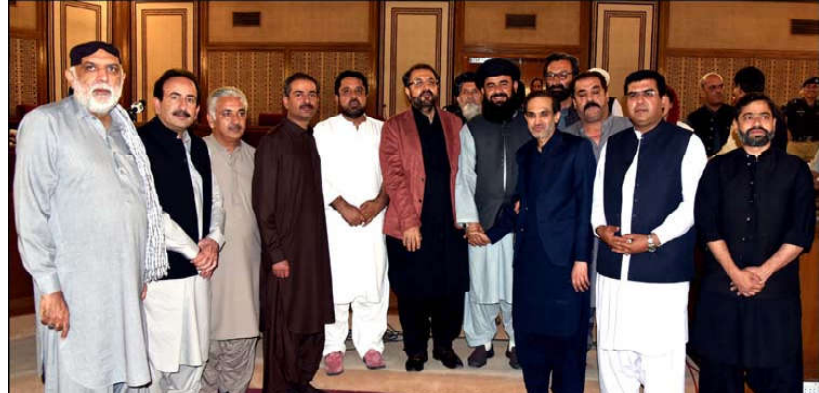
QUETTA: Balochistan Chief Minister Mir Abdul Quddus Bizenjo in a group photo with Provincial Ministers and MPs after budget session

Speaking on floor of the National Assembly, the minister expressed deep grief and sorrow over the tragic deaths of Pakistani migrants in a recent boat incident near the coast of Greece.