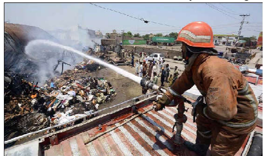
PESHAWAR: Rescue 1122 worker using water gun to douse fire in a cargo godown near Ring road.

The delegation from Diamer was particularly interested in understanding the strategies employed by the Baltistan region in promoting sustainable development and community well-being.