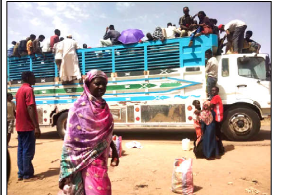
People board a truck as they leave Khartoum, Sudan.

been funded. "Without strong international support, Sudan could quickly become a locus of lawlessness, radiating insecurity across the region," Guterres told a fundraising conference hosted by Germany, Saudi Arabia, Qatar, Egypt and the United Nations. "I appeal to you all today to provide funding to deliver lifesaving humanitarian aid and support to people living in the most difficult and dangerous conditions," Guterres said.