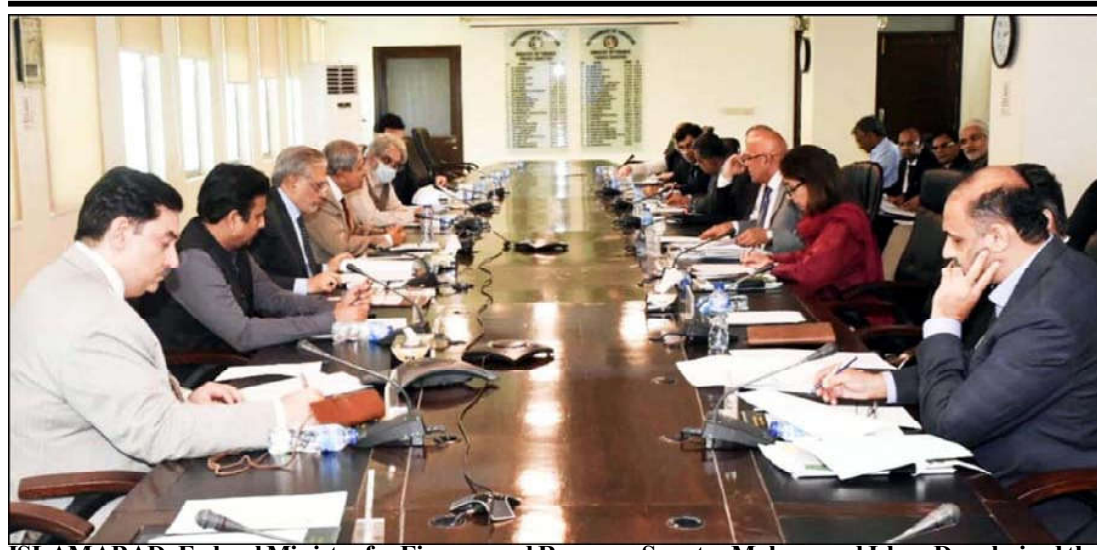
ISLAMABAD: Federal Minister for Finance and Revenue, Senator Muhammad Ishaq Dar chaired the meeting of the Cabinet Committee on Inter-Governmental Commercial Transactions (CCoIGCT) held in Islamabad.

ISLAMABAD (APP): The Senate on Monday proposed 55 recommendations related to Finance Bill 2023 and gave 31 recommendations regarding the public sector development program.