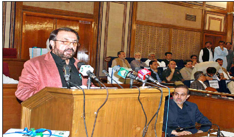
QUETTA: Balochistan Minister for Finance Engineer Zmarak Khan Achakzai presenting annual budget of 2023-24 in session of Assembly

Over Rs. 437 billion allocated for non-development expenditures with Rs. 229 billion allocated for public sector development program; 4,389 new vacancies created in provincial departments; over Rs. 115 billion allocated for general public services, over Rs. 61 billion for public order & safety affairs, Rs. 42 billion for health sector, Rs. 88 billion for education affairs and services