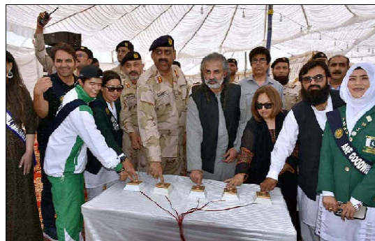
QUETTA: Federal Minister for Narcotics Control Nawabzada Shahzain Bugti pressing button to burn recovered smuggled narcotics at Kuch-More area.