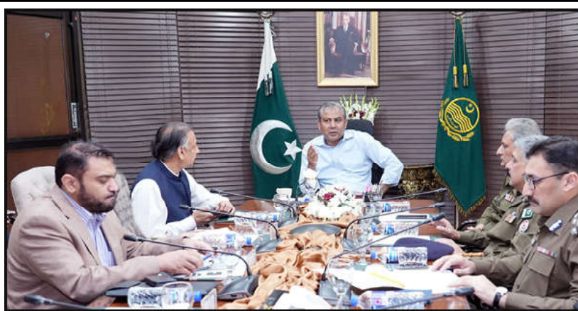
LAHORE: Caretaker Chief Minister Punjab Mohsin Naqvi presides over the meeting to review progress of taking action against the elements involved in 9th May vandalism.

Recognising the mesmerizing allure and profound historical significance of Punjab's cultural heritage, the chief minister emphasised the imperative of restoring these architectural gems to their original magnificence.