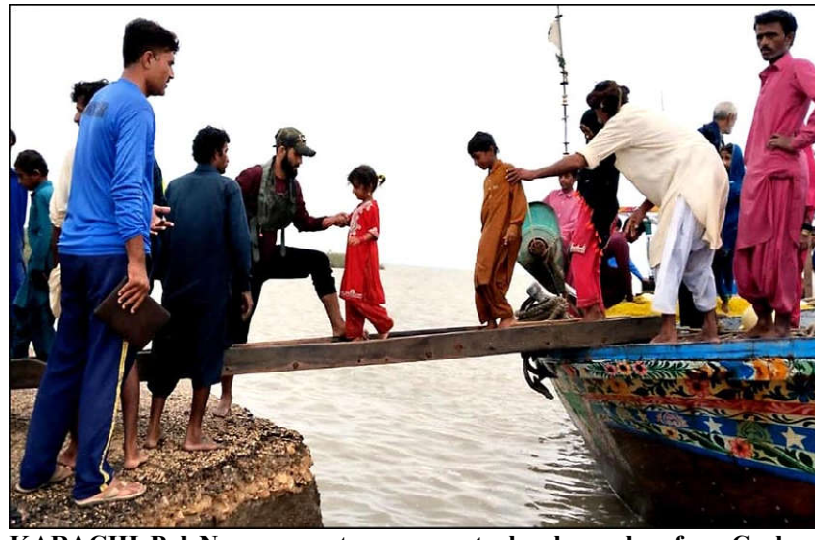
KARACHI: Pak Navy rescue team evacuates local populace from Cyclone BIPARJOY affected areas.

keeping in view its potential growth, he added. The minister said import restrictions were imposed to curb the massive inflows. The external debt of the country had increased from $70 billion to $100 billion in the Pakistan Tehreek-e-Insaf regime, which was clearly an outcome of its financial indiscipline, he added. He said expenditure bill should be made by keeping in view the external debt and import restrictions would be updated by June 30. Ishaq Dar said as far as prevention of illegal border trade was concerned, coordination among intelligence agencies and the Federal Board of Revenue (FBR).