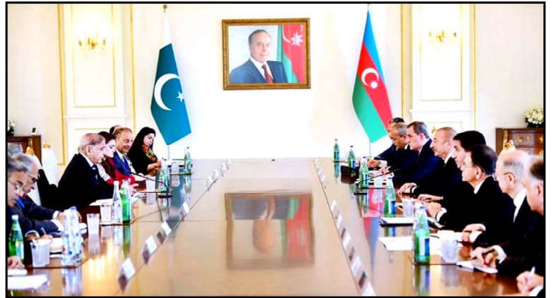
BAKU: Prime Minister Muhammad Shehbaz Sharif and Azerbaijan President Ilham Aliyev leading their respective sides at a delegation level meeting.

The prime minister said that the Pakistani flags all across Baku manifested the love between the two people.