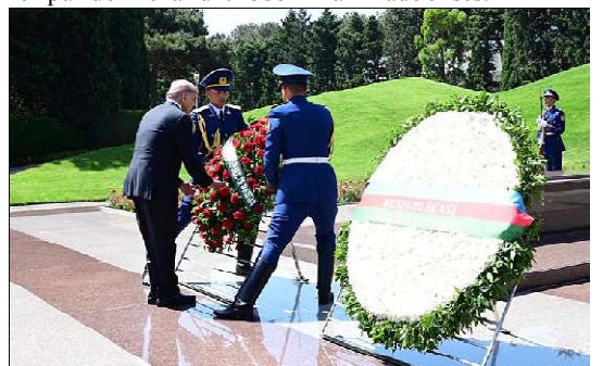
BAKU: Prime Minister Muhammad Shehbaz Sharif visits the mausoleum of National Hero and first President of Azerbaijan, Haider Aliyev. Prime Minister laid a floral wreath at the mausoleum.

stemming from conflicts and climate change. The Executive Board reviews UNICEF activities and approves its policies, country programmes and budgets. It comprises 36 members, representing the five regional groups of member states at the UN. Its work is coordinated by a Bureau, comprising the President and four Vice-Presidents, each officer representing one of the five regional groups. "Despite all the challenges the world is facing today, we note with appreciation how UNICEF has responded to both human-made crises