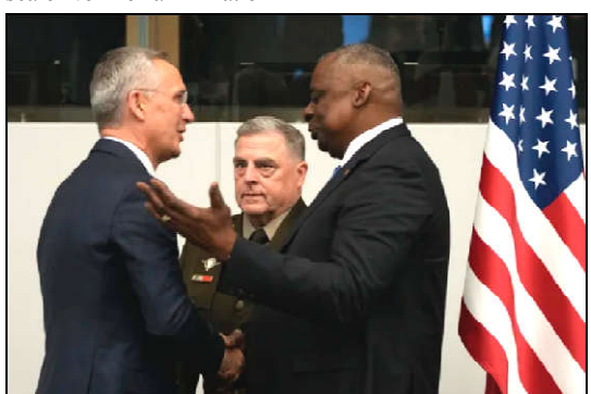
United States Secretary of Defense Lloyd Austin, right, greets NATO Secretary General Jens Stoltenberg during a meeting of the Ukraine Defense Contact Group at NATO headquarters in Brussels.

"We have stepped up monitoring in case of further provocations and are maintaining readiness in close coordination with the United States," it said, terming the launches as a "grave provocation" violating UN sanctions. The missile launches were also confirmed by Tokyo, saying that they had landed in waters within Japan's exclusive economic zone.