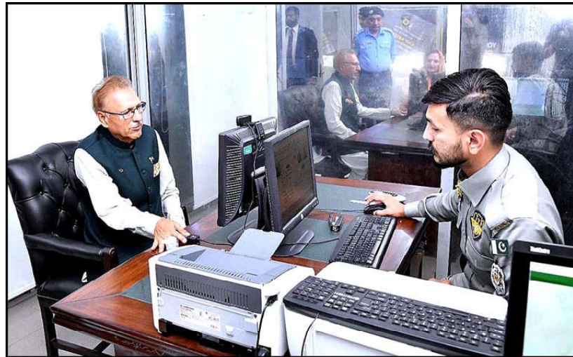
ISLAMABAD: President Dr. Arif Alvi getting his biometric verification for driving license at Islamabad Traffic Police F-8 Office.