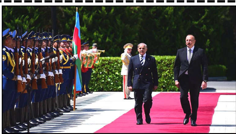
AZERBAIJAN: Prime Minister Muhammad Shehbaz Sharif and President of Azerbaijan inspecting guard of honor at Zugulba Palace.

The one-way drone was launched on Wednesday from the Jask area of Iran 8-9 miles out to sea - within Iran's territorial waters - against a practice barge, the official said, citing U.S. intelligence data. "Essentially practicing hitting merchant vessels."