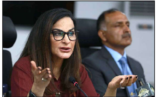
ISLAMABAD: Federal Minister for Climate Change Sherry Rehman briefs media persons about Cyclone Biparjoy during a press conference at NDMA.

Maritime Affairs Advisor (Planning Commission)