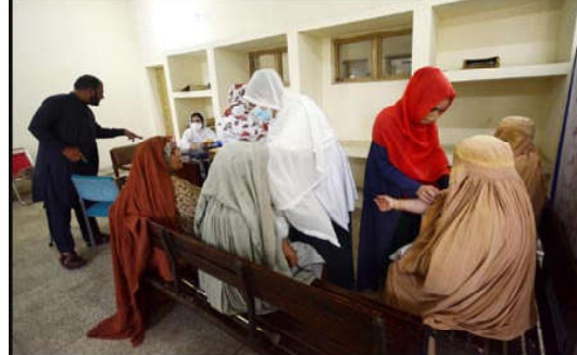
PESHAWAR: People receiving vaccination at Haj center in Peshawar, Hayatabad.

associates announced to join Quami Watan Party. Sikandar Sherpao said due to the incompetence of the previous rulers, the province is the victim of financial instability and the economic crisis is looming here. The policies of the previous government have not only affected the people and economy of the province but rather have also increased backwardness to an extent. He said that keeping in view the current situation the federal government should not only hand over the net profit on electricity net profit to the province, rather also take steps to increase the shares of small provinces by ensuring the early holding of the NFC.