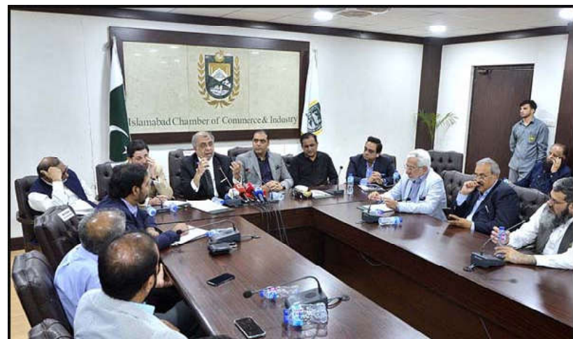
ISLAMABAD: Minister of State and Chairman Reforms and Reduces Mobilization Committee Ashfaq Yousuf Tola addressing to the post budget session at Islamabad Chamber of Commerce & Industry.