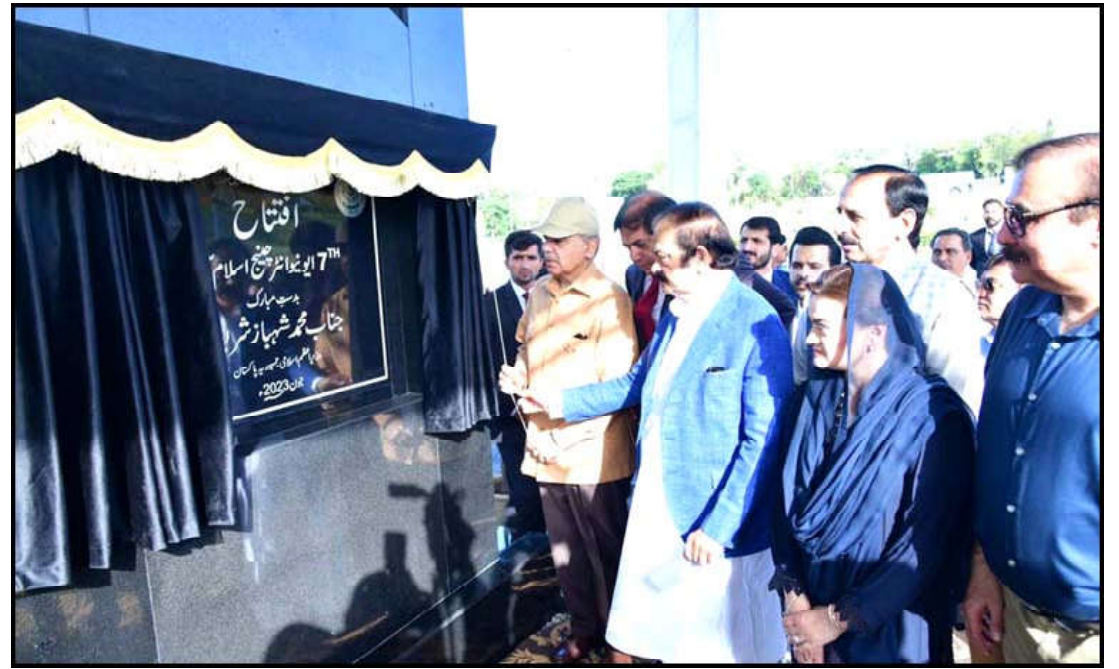
ISLAMABAD: Prime Minister Muhammad Shehbaz Sharif inaugurates 7th Avenue Interchange on Srinagar Highway.

PM Shehbaz resolved that "under the leadership of Nawaz Sharif, we all together would bring the country out of all crises and make it a stable and developed Pakistan." He said the previous government had ignored development projects and the progress on reconstruction of IJP Road was also going on at a snail's pace. However, he said current government made it possible to complete it in the stipulated time. Appreciating the team responsible for the project to complete it on time, the prime minister said the project, previously known as IJ Principal Road, had now been named after Captain Karnal Sher Khan Shaheed (Nishan-e-Haidar).