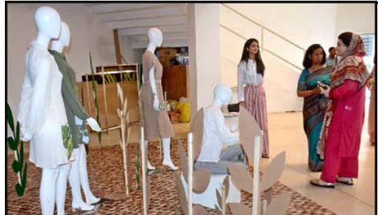
LAHORE: Students of Kinnaird College for Women taking keen interest in Textile Exhibition at Al-Hamra Art Gallery.