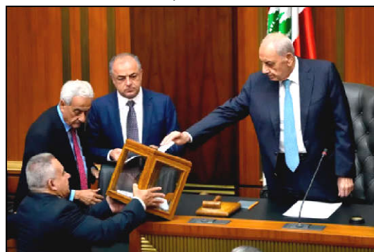
Lebanese Parliament Speaker Nabih Berri casts his vote as parliament gathers to elect a president at the parliament building in downtown Beirut, Lebanon.

Lukashenko said in an interview with the Rossiya-1 Russian state TV channel which was posted on the Belarusian Belta state news agency's Telegram channel. "The bombs are three times more powerful than those (dropped on) Hiroshima and Nagasaki," he said, speaking on a road in a forest clearing with military vehicles parked nearby and some kind of military storage facility visible in the background. Russian President Vladimir Putin said on Friday that Russia, which will retain control of the tactical nuclear weapons, would start deploying them in Belarus after special storage facilities to house them were made ready.