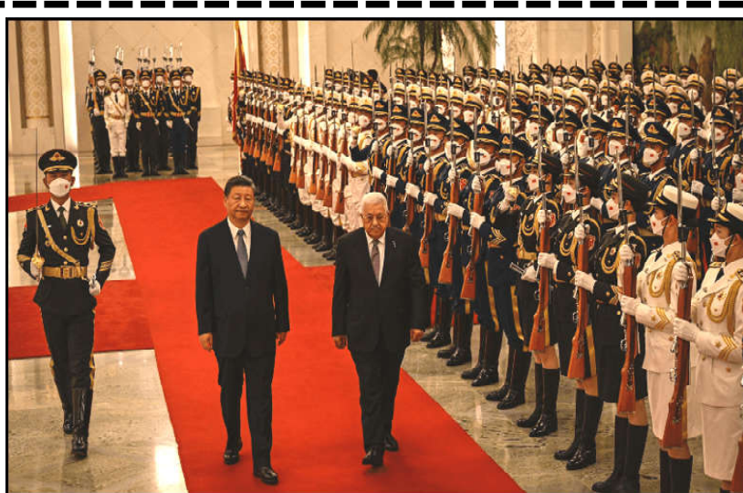
China's President Xi Jinping (C) and Palestinian President Mahmud Abbas attend a welcome ceremony at the Great Hall of the People in Beijing.

tor in the Middle East, brokering the restoration of ties in March between Iran and Saudi Arabia — rivals in a region where the United States has for decades been the main powerbroker. But finding a lasting solution to Israeli-Palestinian tensions may prove more elusive, as peace negotiations between the two sides have been stalled since 2014. In April, Chinese Foreign Minister Qin Gang told his Israeli and Palestinian counterparts that his country was willing to aid peace negotiations, Xinhua reported. And Qin told Palestinian foreign minister Riyad Al-Maliki that Beijing supports the resumption of talks as soon as possible, according to the state news agency. In both calls, Qin emphasised China's push for peace talks on the basis of implementing a "two-state solution".