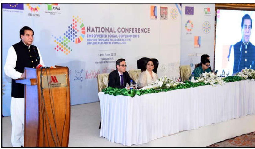
ISLAMABAD: Speaker National Assembly Raja Pervez Ashraf addressing the participants of National Conference-Local Democracy Moving Forward for Achieving Sustainable Development Goals in Pakistan