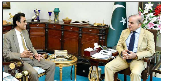
ISLAMABAD: Convener MQM and MNA Khalid Maqbool Siddiqui called on the Prime Minister Muhammad Shehbaz Sharif.

Responding to a tweet of the PTI chairman, the prime minister in his tweet said if there was someone who deserved the title of modern-day Joseph Goebbels, chief propagandist for the German Nazi Party, was none other than Imran Khan. "He is certainly perfecting the art of lying."