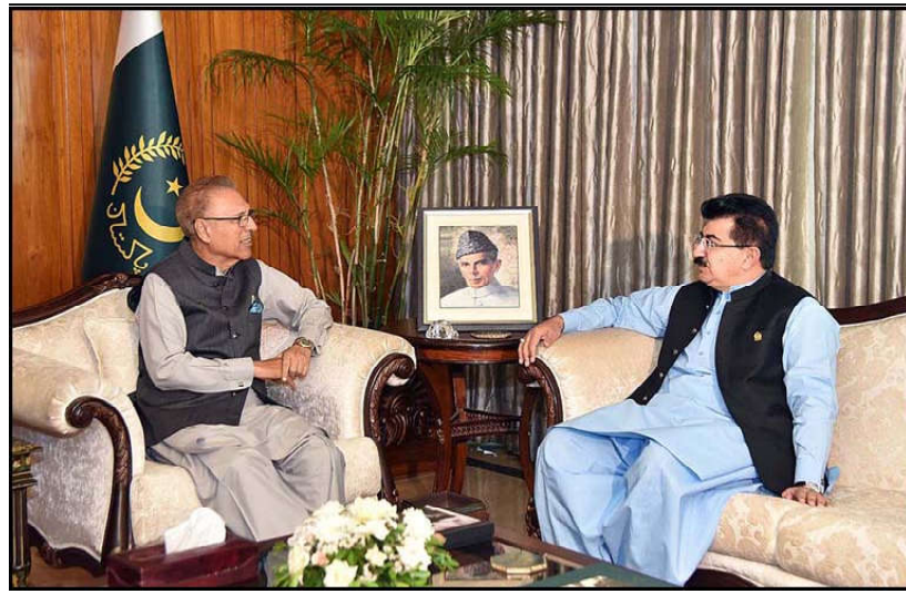
ISLAMABAD: Chairman Senate, Muhammad Sadiq Sanjrani, called on President Dr. Arif Alvi at Aiwan-e-Sadr.