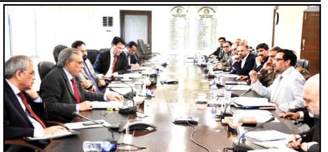
ISLAMABAD: Federal Minister for Finance and Revenue, Senator Mohammad Ishaq Dar chaired a meeting on Civil Aviation issues, at Finance Division.

France, through the French Development Agency, is providing technical and financial support in several sectors such as energy, water and sanitation, urban development, and cultural heritage. The French loan will support NTDC in the components of the projects including: Construction of a new 220kV substation and 50km of new 220kV transmission lines to be connected to it in Aarifiwala, which will be connected to the MEPCO grid.