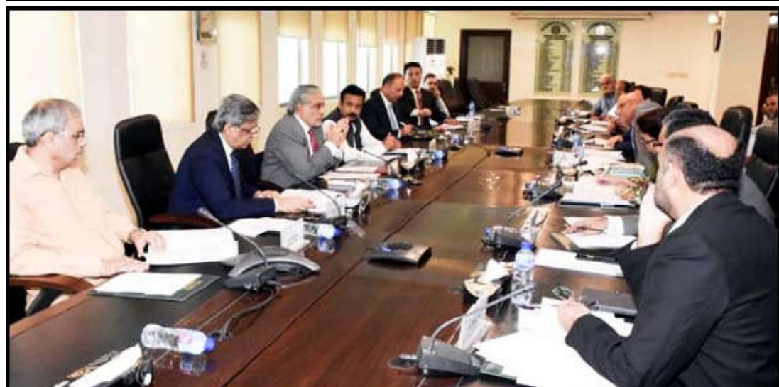
ISLAMABAD: Federal Minister for Finance and Revenue, Senator Mohammad Ishaq Dar chaired the first meeting of the Cabinet Committee on Inter-Governmental Commercial Transactions (CCoIGT), in Islamabad.