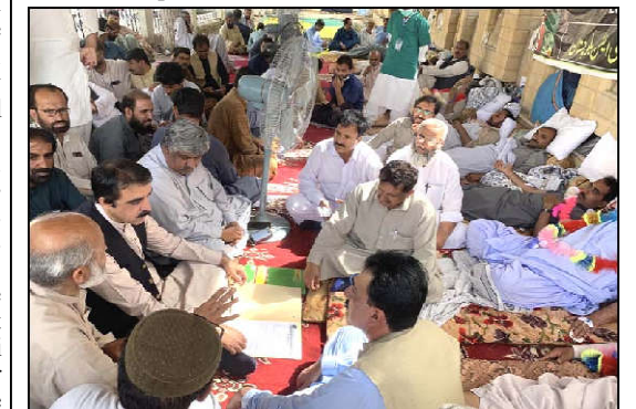
QUETTA: Secretary General Balochistan Awami Party and Senior Provincial Minister Haji Noor Muhammad Dumar listening demands of teachers at their hunger strike camp

The Minister Home was speaking to prominent tribal elder and Bangulzai tribe chieftain, Sardar Kamal Khan Bangulzai here on Monday. During the course of meeting, the issues related to tribal disputes and their solution were discussed between them.