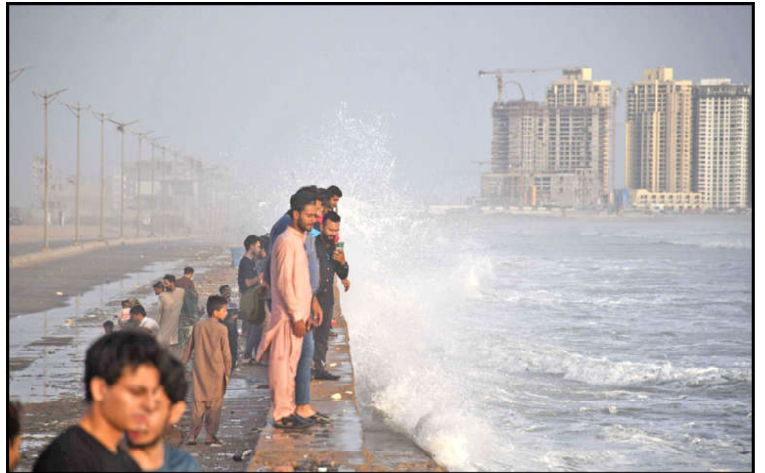
KARACHI: People openly defy Section 144 imposed by the administration as a preventive measure in anticipation of tropical cyclone Biparjoy. Sindh government has decided to evacuate residential areas and other human settlements located near the coast areas of Sindh due to threat of cyclone Biparjoy

The Prime Minister said we are moving one step at a time toward prosperity, economic growth, energy security and affordability.