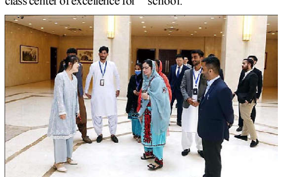
ISLAMABAD: A delegation of student of University of Gwadar visiting Chinese Consulate