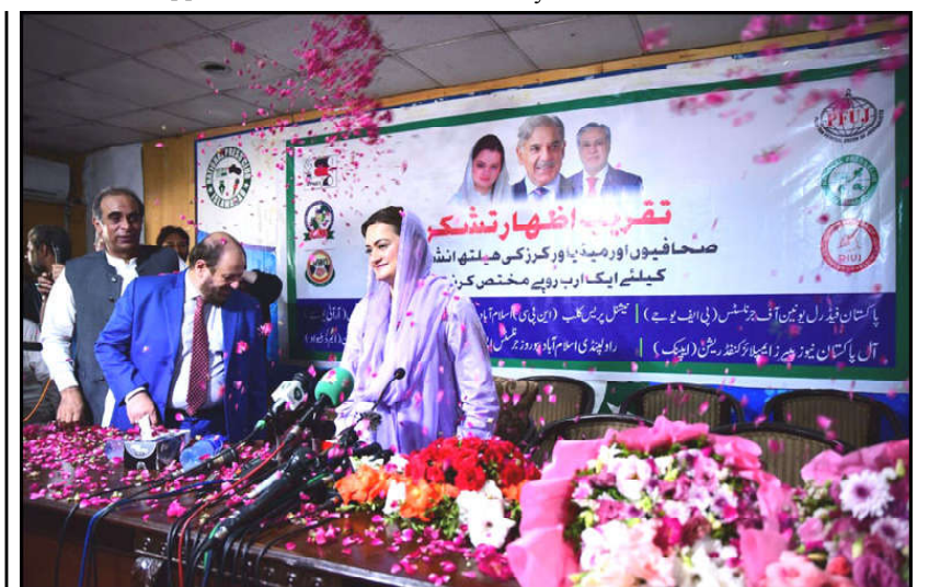
Ms. Marriyum Aurgangzeb, Federal Minister for Information and Broadcasting participating in a thanksgiving reception held in view of allocating funds for health insurance in the budget for the journalists & Media workers at National Press Club, Islamabad.

The JIT recommended to send the evidences from the spot and used bullets to the Forensic laboratory. Moreover, the analysis of call data of the cell numbers used by the deceased lawyer can also be acquired, it was also mentioned.