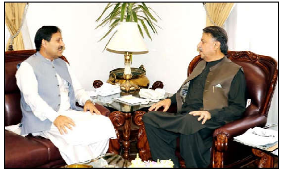
QUETTA: MPA Nasrullah Zarey meeting with Governor Balochistan Malik Abdul Wali Khan Kakar

The Governor assured that the government is ready to extend every possible cooperation to the media persons.