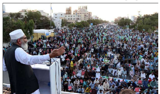
KARACHI: Jam-at-Islami (JI) Chief, Siraj-ul-Haq addresses to his supporters during protest demonstration against stolen of party mandate in mayoral elections, at Shahrah-e-Quaideen in Karachi.

ISLAMABAD (APP): Prime Minister Shehbaz Sharif on Sunday expressed deep grief over the death of 14 people in a forest fire in Kazakhstan. In a tweet on social media platform Twitter, he said, "Deeply grieved to learn of the death of 14 people in a forest fire in Kazakhstan. On behalf of the government and people of Pakistan, I extend my heartfelt condolences to H.E. President Kassym-Jomart Tokayev and the bereaved families on the loss of precious lives. Prayers for the speedy recovery of the injured."