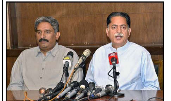
LAHORE: Federal Minister Mian Javed Latif addressing a Press conference.

heavy rains in Khyber Pakhtunkhwa. He was given a detailed briefing by the management of both PESCO and Tribal Electric Supply Company (TESCO) regarding losses inflicted on the power transmission system in the province. The PM's aide said that the people have now acknowledged that the panacea for all problems and Imran Khan lying with only Nawaz Sharif and PML-N. Amir Muqam said that rehabilitation work on the restoration of rain affected power supply system was in full swing and all staff from Chief Executive Officers (CEOs) to Lineman level of both power distribution companies is in the field.