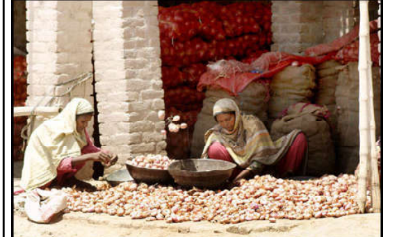
MULTAN: Women are busy sorting good quality onions at the vegetable Market.

government had taken a lot of measures in the budget which would help the IT, SME, and agriculture sectors grow. In this financial plan, she mentioned that farming sector had been allotted Rs 5 billion for arrangement of sponsored advances to the agri business, while Rs 6 billion earmarked for the concession on imported urea, adding that charges and obligations on import of value seeds had been annulled.