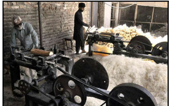
RAWALPINDI: Workers busy producing khas from wood pieces with the help of machine to be used in making of room cooler at his workplace.

Minister Dar emphasized that the coalition government of Pakistan Muslim League-N (PML-N) was taking all necessary measures to renegotiate with the International Monetary Fund (IMF) on more favorable terms and conditions. He expressed hope that the IMF would be satisfied with Pakistan's progress, as the country has fulfilled the necessary requirements. Furthermore, He expressed optimism that Pakistan would achieve the growth rate set by the government, indicating a positive outlook for the nation's economic development in the coming year.