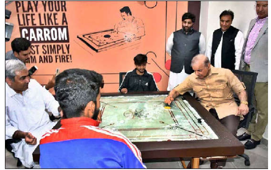
LAHORE: Prime Minister Muhammad Shehbaz Sharif playing carrom board during his visit to various sports facilities at Sabzazar Sports Complex.

Similarly, the inauguration of public hospitals would be inaugurated by the poor patients being treated in them, he made it clear adding that the inauguration of green bus service would be inaugurated by the sisters and daughters travelling in the public transport. The Chief Minister also said that this is public exchequer and as such the public should be given credit. Ours' job is just to ensure accurate use of the public exchequer, he added. It may be mentioned here that the Chief Minister has announced ban on making inauguration of the development projects by provincial ministers, members of provincial assembly and other government functionaries in the province.