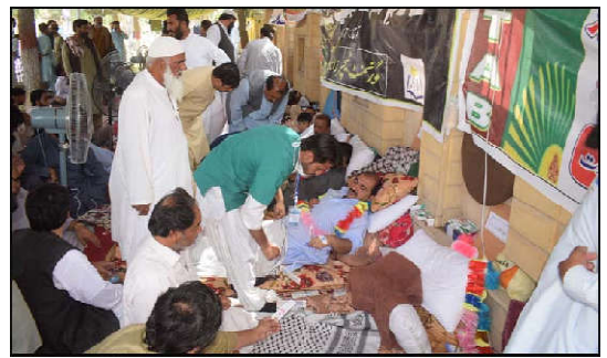
QUETTA: Medical staff giving medical aid to teachers in hunger strike camp by Government Teachers Association in front of Balochistan Assembly