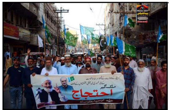
HYDERABAD: Activists of Jamat-e-Islami (JI) are holding protest demonstration against stolen of party mandate in mayoral elections in Karachi, in Hyderabad.

provincial government has taken immediate and pragmatic steps to help the citizens in the affected districts. On the direction of caretaker Chief Minister Muhammad Azam Khan, rescue and relief activities have been started immediately and funds have already been released. The provincial government will reach out to every citizen affected by the recent wind and rain. The caretaker provincial minister said that the provincial government has immediately released Rs. 40 million for the affected districts so that the rescue and relief activities would continue there as quickly as possible.