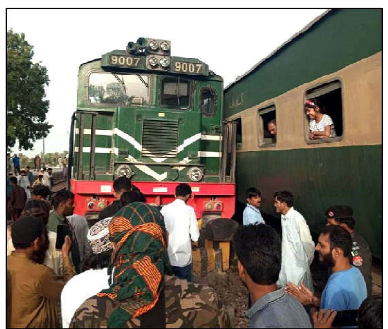
GHOTKI: View of site after Green Line Express derailed near Ghotki.

The officers of concerned departments have also been put on high alert to take precautionary measures ahead of the cyclone in the port city.