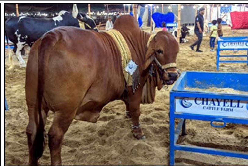
KARACHI: Sacrificial animals wait for their buyers at a makeshift sacrificial animals market established for the upcoming festival Eid-ul-Azha, at Northern Bypass road in Karachi.

He said that a special team would start checking of fares in buses and wagons from Monday and whosoever was found involved in overcharging would be handed down heavy fine in addition to impounding of his vehicle.