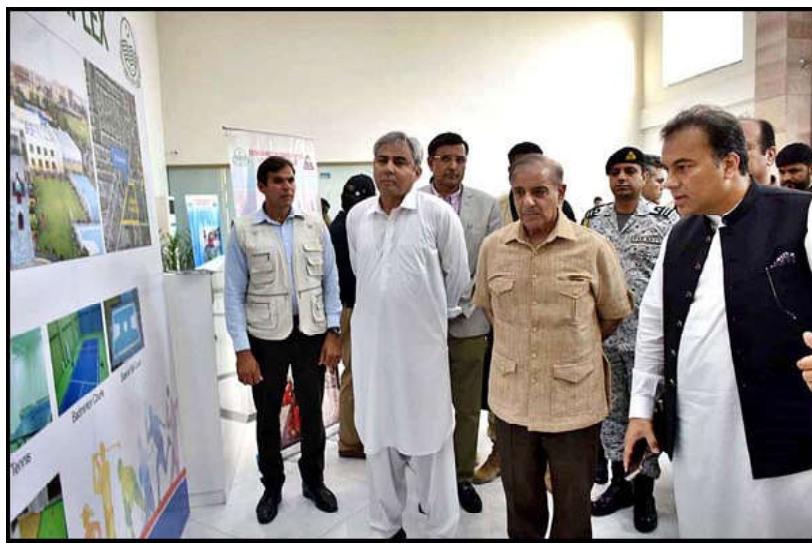
LAHORE: Prime Minister Muhammad Shehbaz Sharif being briefed about Sabzazzar Sports Complex.

Meanwhile, Caretaker Chief Minister Punjab Mohsin Naqvi visited the Punjab Agriculture, Food and Drug Authority project to review ongoing construction works. He inspected construction work of auditorium, sample centres, labs, meeting room, other sections and expressed satisfaction over the pace of work. While directing the authorities concerned to continue construction work at the same speed, he said that the project of public importance should be made functional at the earliest.