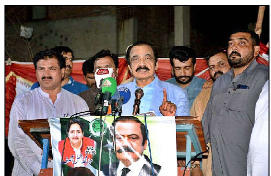
FAISALABAD: Interior Minister Rana Sana Ullah Khan addressing to public gathering after inaugurating railway gate on Chack No. 79 JB Abbas Pur Road.

Sunday. During the visit, Mir Ziaullah inspected the progress of ongoing development schemes in different areas of Kalat and Kot Langove. The schemes inspected by him were included roads, water supply schemes in the main city of Kalat. Also present on the occasion were the Deputy Commissioner Kalat, Munir Ahmed Durrani, besides other concerned officials.