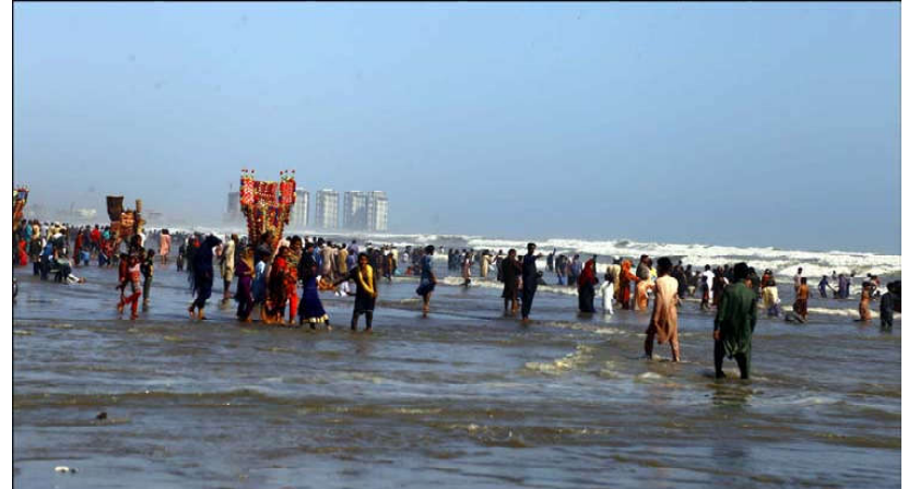
KARACHI: People are seen at Seaview beach despite alerts to remain away ahead of the Extremely Severe Cyclonic Storm Biparjoy.

RAWALPINDI (INP): Awami Muslim League chief and former interior minister Sheikh Rasheed Ahmed on Sunday said that new budget was an agenda of creating problems for the next government. In his statement on the social networking site Twitter, Sheikh Rasheed Ahmed said that Sheikh Sharif admitted his failure but laid landmines for the next government. Shehbaz spoke to the head of IMF for an hour but the result was zero. He said the aid of Saudi Arabia and the UAE was still in limbo. There are many parties who wanted to get into power corridors, he added. "PDM is falling apart. PML-N and PPP are going to face off soon, Dawn Leaks, Memogate, Panama Papers are their real assets," said the AML head. The former minister said that those who changed faces and parties made their decision in haste.