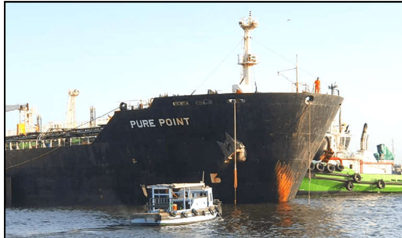
A Cargo ship carrying crude oil from Russia arrived at Karachi Port

"After consensus on the technical specifications achieved, the oil and gas trade transaction will be structured in a way it has a mutual economic benefit for both countries," a joint statement issued by the two sides had then stated.