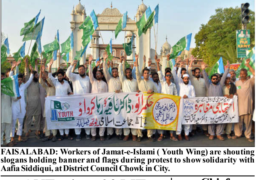
slogans holding banner and flags during protest to show solidarity with Aafia Siddiqui, at District Council Chowk in City.

total of 169 assistant subinspectors (ASIs) have been promoted to the rank of sub-inspectors, 453 head constables to the rank of ASIs, and 400 constables to the rank of head constables Notably, 25 female police