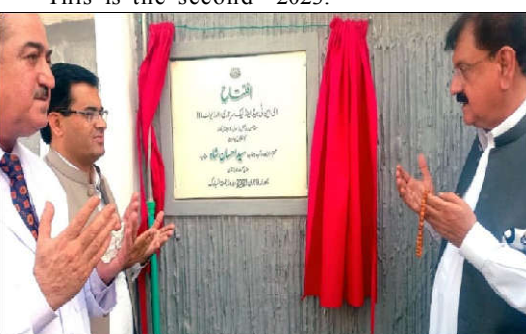
QUETTA: Provincial Health Minister Syed Ehsan Shah offering Dua after inaugurating ENT Department in Civil Hospital

Even with a significant increase in debt servicing, the fiscal deficit reduced to 4.6 percent of the gross domestic product (GDP) in July-April FY 2022-23 against 4.9 percent for the same period last year, while the primary balance reverted from deficit to surplus. During the first 11 months of the outgoing fiscal year, the trade deficit was narrowed down by 40 percent and the current account deficit by 76 percent during July 2022-April