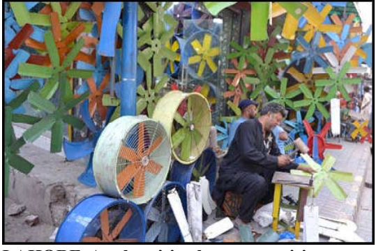
LAHORE: An electrician busy to repairing roomcoolers at his workplace in the Provincial Capital.

Pakistani The transportation system needs modernization and the National Transport Master Plan is in the final advantageous geographic location, Pakistan has the actions under the policy and the plan are being economy through transit already adopted and trade and as part of the implemented. In recent years the work in the transport infrastructure projects was carried out in the districts of southern and Khyber Pass Economic Punjab, southern KP.