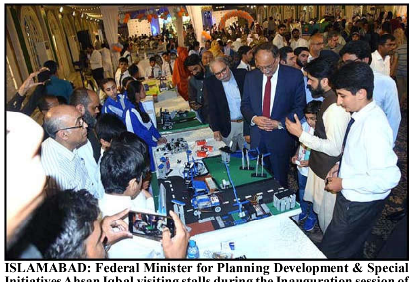
Initiatives Ahsan Igbal visiting stalls during the Inauguration session of International EdTech Conference.