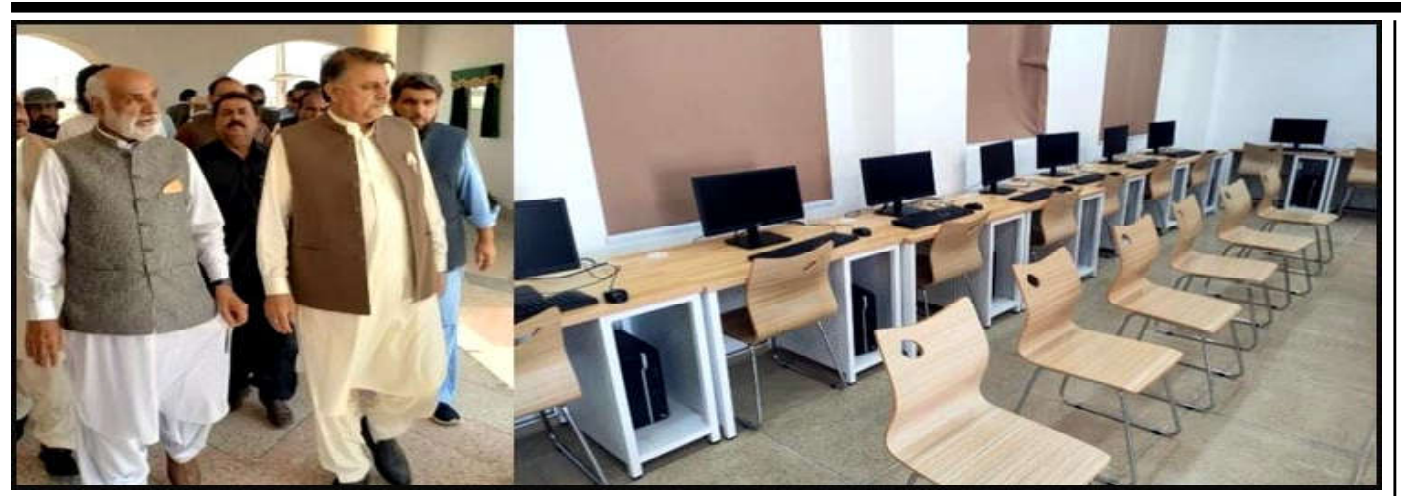
GWADAR: Balochistan Governor Malik Abdul Wali Khan Kakar different sections of Pak-China Technical & Vocational Institute