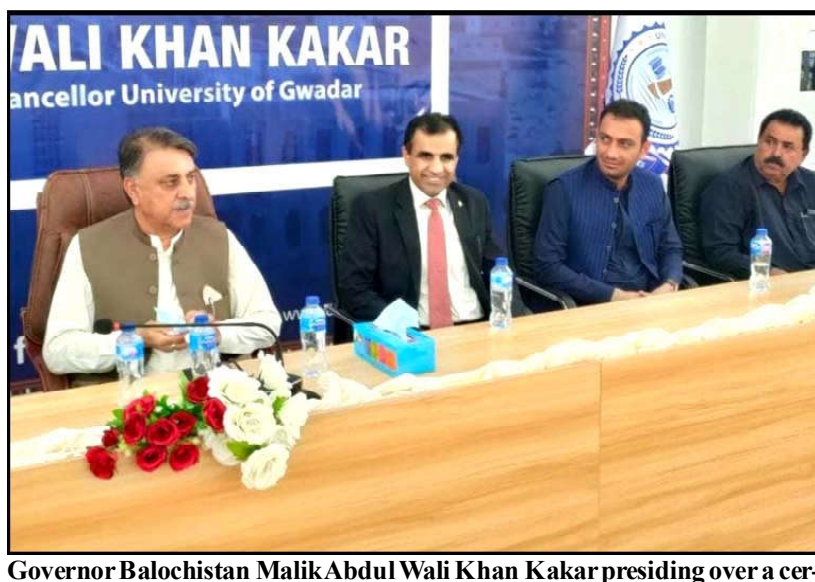
Governor Balochistan Malik Abdul Wali Khan Kakar presiding over a ceremony in Gwadar. Deputy Commissioner Gwadar Izzat Nazir Baloch is also