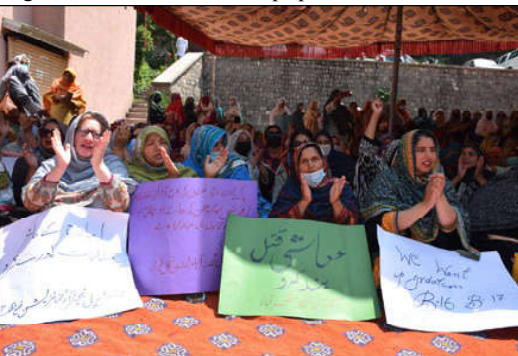
MUZAFFARABAD: Azad Kashmir school teachers are holds a banner shouting slogan during protest due to up gradation of teachers at

inspected the furniture and other interior items made according to modern Turkish designs, local and international designs. Establishing the best of its home