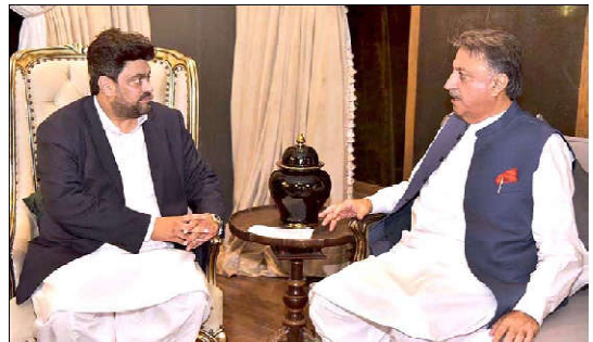
KARACHI: Governor Sindh Kamran Tessori exchanging views with Governor Balochistan Malik Abdul Wali Khan Kakar at Governor House.

Indian illegally occupied Jammu and Kashmir (IIOJK). Mumtaz Zahra Baloch said, "We are reminded of the plight of the Kashmiri children, who continue to suffer because of continued siege and brutal oppression by the Indian forces." She said an entire generation of Kashmiri children has grown up in a climate of fear, violence and repression.