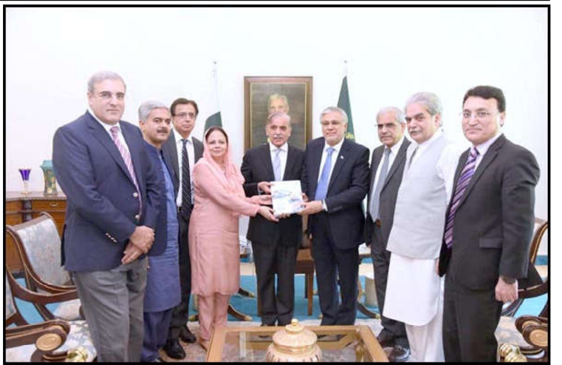
ISLAMABAD: Finance Minister Ishaq Dar and the economic team presenting Economic Survey of Pakistan for FY-2022-23 to Prime Minister Muhammad Shehbaz Sharif.

"The assistance will tackle the growing challenges of food insecurity, malnutrition, and disease outbreak prevention." Moreover, she said the funding would empower humanitarian partners to deliver nutritious meals to mothers and children, aid in the reconstruction of local infrastructure to mitigate future disasters and expand.