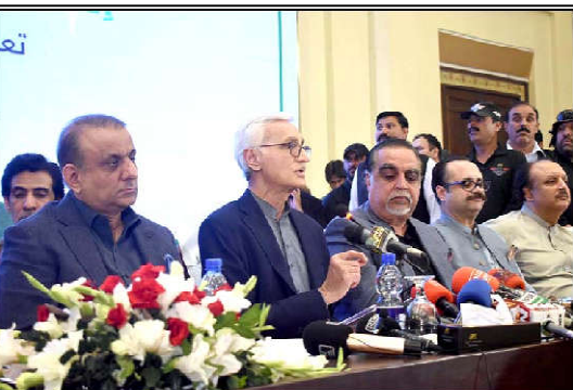
LAHORE: Senior Politician Jahangir Tareen announces new political party named 'Istehkam-e-Pakistan Party' (IPP) during a press conference.

The meeting will take place in parliament house. Finance Minister (FM) Ishaq Dar along with his economic team will give detailed briefing in the meeting on the salient features of budget.