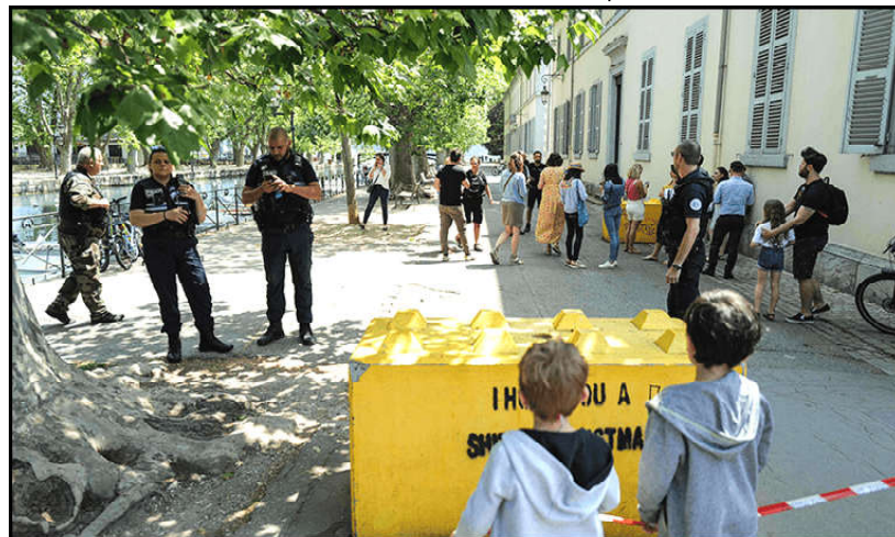
French police personnel maintain a secure cordon in Annecy, south-eastern France, following a mass stabbing in the French Alpine town.

The two will discuss joint U.S.-UK leadership on critical and emerging technologies, as well as coordinated efforts to strengthen both countries' economic security. White House press secretary Karine Jean-Pierre said on Wednesday. The discussion will touch on artificial intelligence safety. Britain announced late Wednesday, saying it would host the first summit on the issue this autumn to discuss how the risks of AI can be mitigated through internationally coordinated action.