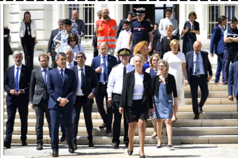
French Prime Minister Elisabeth Borne and French Interior and Overseas Minister Gerald Darmanin leave the Haute Savoie prefecture in Annecy, French Alps.

No further details were available about the cause of the accident.