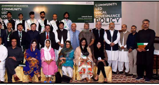
QUETTA: A group photo of participants of a seminar held in connection with launching of Community Led Local Governance Policy.

ISLAMABAD (APP): Pakistan Tehreek-e-Insaf (PTI) senior leader Pervez Khattak, who recently resigned from the president of the party's Khyber Pakhtunkhwa chapter over the May 9 violent protest, has decided to form a new political party, sources said on Thursday. Sources privy to the development said PTI deserters are expected to join the new political setup led by senior politician Pervez Khattak. Khattak has claimed that more than 50 former members of parliamentarians (MPs) are in contact with him and would join his new political setup, say sources.