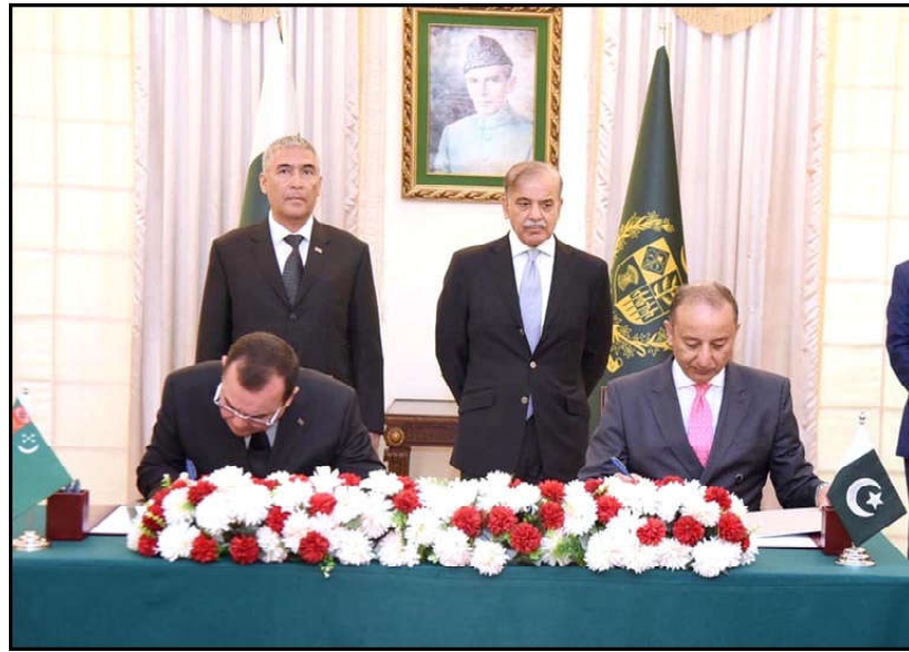
ISLAMABAD: State Minister of Turkmenistan and Head of TurkmenGaz, Maksat Babayev and Minister of State for Petroleum of Pakistan, Dr. Musaddiq Malik signing TAPI Joint Implementation Plan meanwhile Prime Minister Muhammad Shehbaz Sharif witnesses the signing.

Ph: 2841470/2841473 Vol: XVIII No. 181, Zee'qad 19, 1444 AH Friday June 09, 2023 Pages 08, Price Rs.15