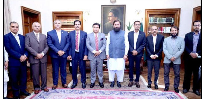
LAHORE: A delegation of All Pakistan Business Forum led by Syed Muaz Mehmood photographed with Governor Punjab Muhammad Balighur Rehman after a meeting

He regarded Minister Qamar's visit as a testament to the enduring strength of this special bond between the two nations.