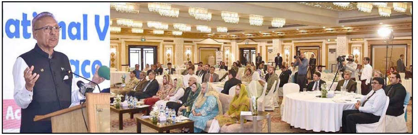
ISLAMABAD: President Dr. Arif Alvi addressing the National Vice Chancellors Peace Conference.

five to seven years. The country will stand on strong footings again, he said. The two-day conference was jointly organised by Higher Education Commission (HEC), Pakistan, National Counter-Terrorism Authority (NACTA) and Shaoro Foundation for Education and Awareness (SFEA). The conference themed "Academic Discourse on Countering Extremism - The Way Forward" is a significant milestone in the implementation of the Peace, Advocacy and Community Engagement through Transformation (PACT) for Tolerance project, which is built on a foundation of collaboration and cooperation between SFEA, HEC Pakistan, NACTA, and other policy-level stakeholders.