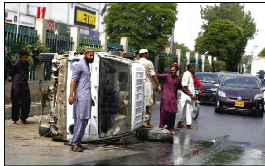
KARACHI: View of venue after traffic accident due to over speeding and break failure, while people busy in rescue work, located on Shahrah-e-Faisal road in Karachi.

According to a spokesman for SIU, the unit on a tip-off conducted a raid near Eidgah Ground, Nazimabad and arrested the accused identified as Imran, Irshad and Rehmatullah during initial investigations revealed their involvement in a number of street crimes. They also used to rob people coming out of banks with huge cash. The accused also confessed to having snatched two motorcycles from Karimabad and Sachal. The motorcycle snatched from Karimabad on June 3 this year was recovered from their possession. They revealed committing street crimes in Karimabad, Iqbal Market, Mominabad, Metroville, Sachal, Korangi, Shah Latif, SITE-A, Pakistan Bazar and Pirabad areas.