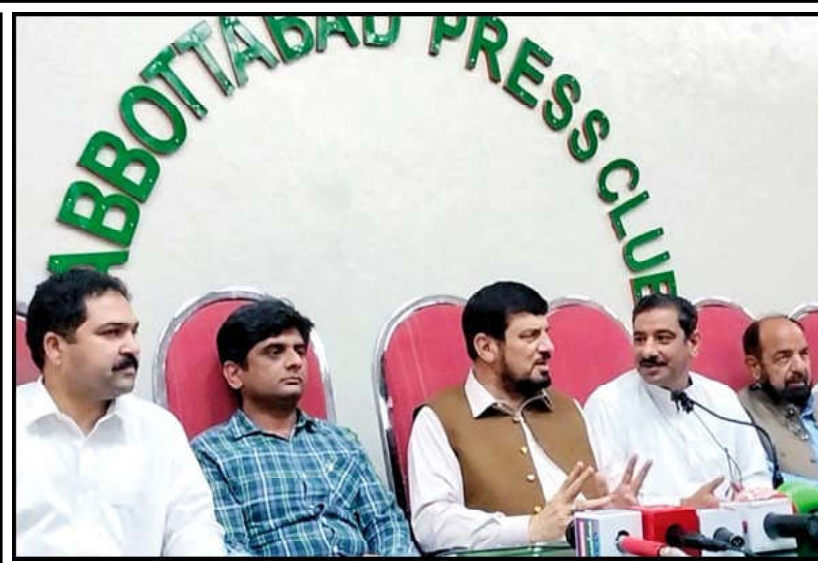
ABBOTTABAD: Governor of Khyber Pakhtunkhwa, Haji Ghulam Ali addresses to media persons during press conference held at Abbottabad press club.