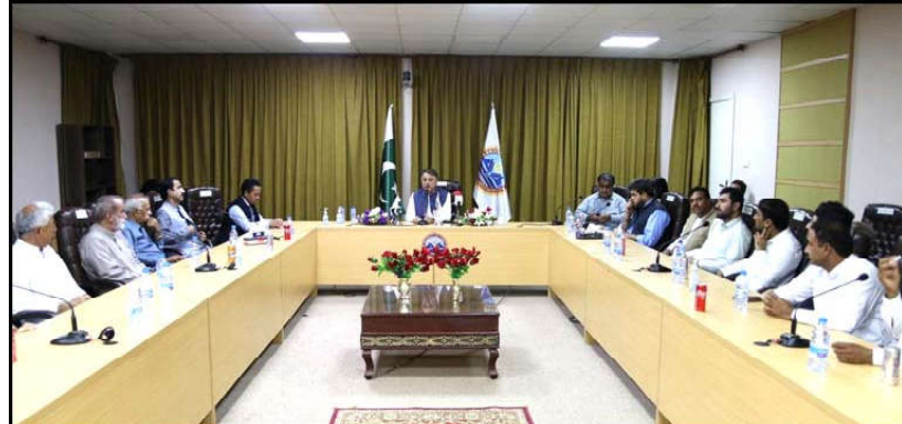
TURBAT: Governor Balochistan Malik Abdul Wali Khan Kakar presiding over a review meeting during his visit of University of Turbat

Later, the prime minister witnessed the signing of "TAPI Gas Pipeline Joint Implementation Plan (JIP)" by Minister of State for Petroleum Dr Musaddiq Malik and Maksat Babayev, State Minister and Head of TurkmenGaz, on behalf of their respective governments. The JIP is aimed at accelerating the work on the TAPI Gas Pipeline project.