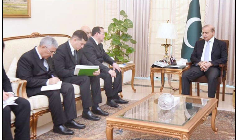
ISLAMABAD: A delegation of Turkmenistan headed by Mr. Maksat Babayev, State Minister and Head of Turkmenistan calls on Prime Minister Muhammad Shehbaz Sharif.

Charter and Balochistan Wildlife Protection Act for protection of the rare birds and animals in the province. He also termed it mandatory for all the deputy commissioners and officers and staff of the Forests and Wildlife department to protect the wildlife. He warned that the action would be taken against those Deputy Commissioners and concerned staff of the areas where the information of hunting of rare birds was received. The Chief Minister stressed that protection of wildlife is a national obligation and as such the general public should also fulfill it. Moreover, Mr. Bizenjo also directed to initiate crackdown against those hunting the birds for business or keeping them in shops or their homes. The Chief Minister pledged to make the province safe region for the wildlife.