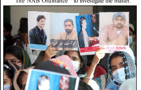
QUETTA: Relatives of missing persons are holding pictures of victims during a seminar.

ISLAMABAD (Online): During his four-day visit to Russia, Chairman Senate Muhammad Sadiq Sanjrani held meetings with Russian Parliamentarians and Government officials to strengthen ties between the two nations. Notably, Chairman Sanjrani met with Deputy Prime Minister Alexander Novak, Chairman of the state, VV Volodin, and paid respects at the monument of the unknown soldiers near the Kremlin wall by laying flowers. In addition to these engagements, Chairman Sanjrani delivered a significant address at the plenary session of the Federation Council of the Russian Federation, marking a new chapter in the development of bilateral relations. During the meetings, Chairman Senate Muhammad Sadiq Sanjrani emphasized the importance of Pakistan's historical and political relationship with Russia. He highlighted the role of regional relations in promoting social and economic development.