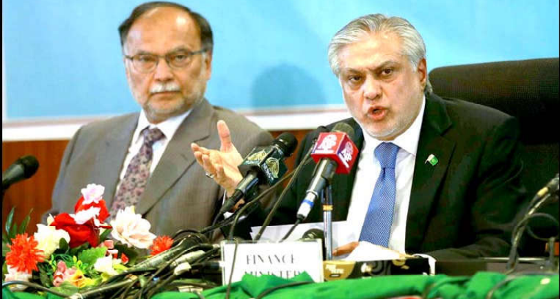
ISLAMABAD: Federal Minister for Finance and Revenue Senator Ishaq Dar presents Economic Survey for fiscal year 2022-23 during a press conference.

The economy has been severely impacted by the devastating floods. The estimated damage amounts to $14.9 billion, with a loss of $15.2 billion to the GDP and a required investment of $16.3 billion for the rehabilitation of the damages.