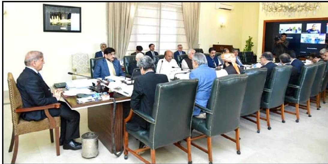
Prime Minister Muhammad Shehbaz Sharif chairs meeting of the National Economic Council in Islamabad.

Ph: 2841470/2841473 Vol: XVIII No. 179, Zee'qad 17, 1444 AH Wednesday June 07, 2023 Pages 08, Price Rs.15