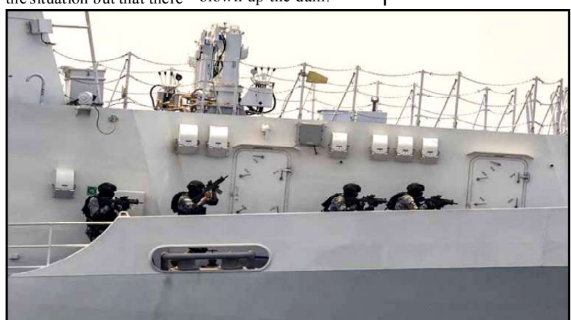
Philippines, Japan, US hold first trilateral coast guard manoeuvres.

gence could change the way that humans work and learn, has sparked concerns as well. Hundreds of industry leaders, including Altman, have signed a letter in May that warns "mitigating the risk of extinction from AI should be a global priority alongside other societal-scale risks such as pandemics and nuclear war." Altman made a point to reference the IAEA, the United Nations nuclear watchdog, as an example of how the world came together to oversee nuclear power. That agency was created in the years after the U.S. dropping atom bombs on Japan at the end of World War II. "Let's make sure we come together as a globe — and I hope this place can play a real role in this," Altman said. "We talk about the IAEA as a model where the world has said 'OK, very dangerous technology, let's all put some guard rails.'"