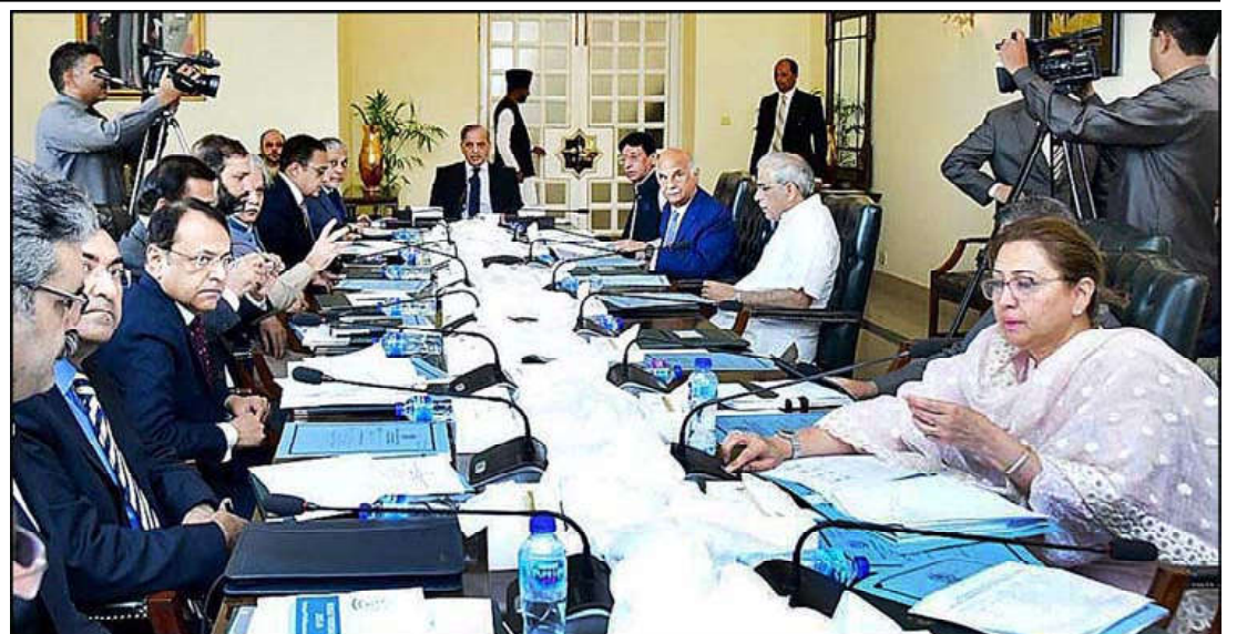
ISLAMABAD: Prime Minister Muhammad Shehbaz Sharif chairs a meeting on budget proposals regarding IT and Telecom Sector.

being trained in the sector, he added. The prime minister further said that in the upcoming fiscal budget, the government would distribute 1,00,000 laptops among the youth on merit basis. During the previous tenure of the PML-N government, they had distributed laptops among the country's youth and by utilizing this facility, the young people brought foreign reserves during the Covid pandemic, he observed.