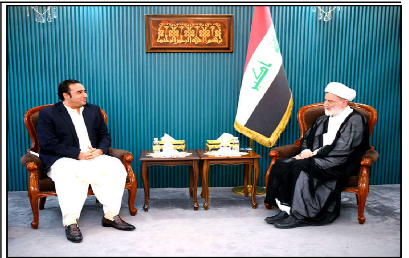
IRAQ: Minister of Foreign Affairs of Pakistan Bilawal Bhutto Zardari in a meeting with head of Islamic Supreme Council of Iraq Dr Sheikh Humam Hamoudi during his visit of Iraq for bilateral relations in various fields of cooperation.

They discussed the political ties between the two countries and other issues of mutual interest. The foreign minister termed the high-level political linkages between the two countries as highly important. For the promotion of public to public relations, the political contacts between the two countries were vital, he added.