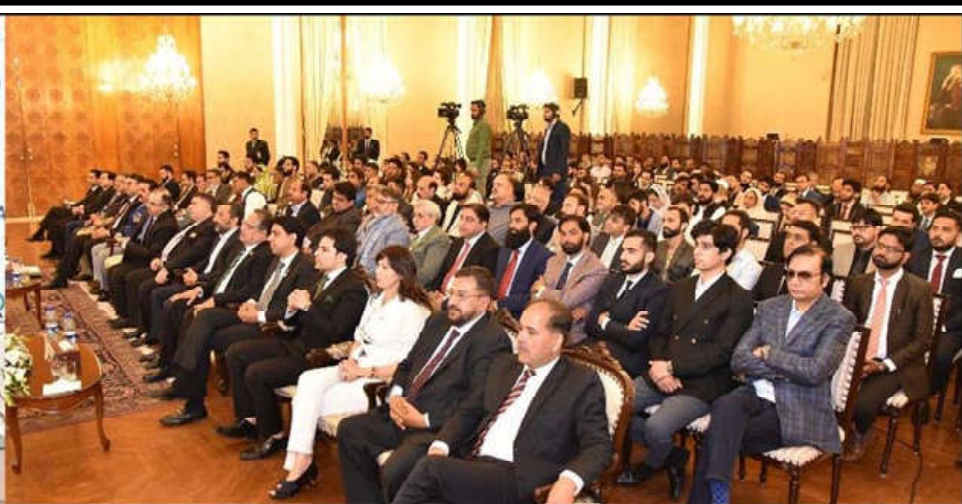
President Dr. Arif Alvi addressing the 3rd Lahore Chamber of Commerce and Industry (LCCI) IT Excellence Recognition ceremony, at Aiwan-e-Sadr, Islamabad.