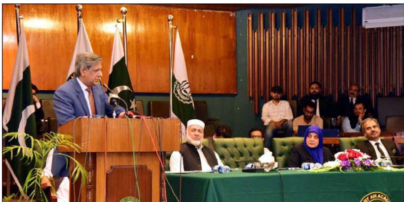
ISLAMABAD: Federal Minister for Law and Justice, Senator Azam Nazir addresses during the opening ceremony of Islamic Law Orientation Course for the Lawyers of Islamabad organized by Federal Shariat Academy in collaboration with Islamabad Bar Association.

Recalling his efforts to promote artificial intelligence and quantum computing in Pakistan, the president said the country needed more inspiration and creating talent.