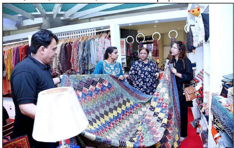
KARACHI: Visitors showing their keen interest in handicrafts during 13th Sartyoon Sang Crafts Exhibition organized by the Sindh Rural Support Organization (SRSO) in collaboration with the Sindh Government to facilitate better incomes for the women artisans of rural Sindh.