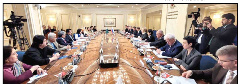
MOSCOW: Chairman Senate Muhammad Sadiq Sanjrani held delegation level talks with Speaker of the Russian Federation Council IV Matvienko.