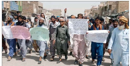
NASEERABAD: Residents of Dera Murad Jamali are holding protest demonstration against shortage of drinking during summer season.