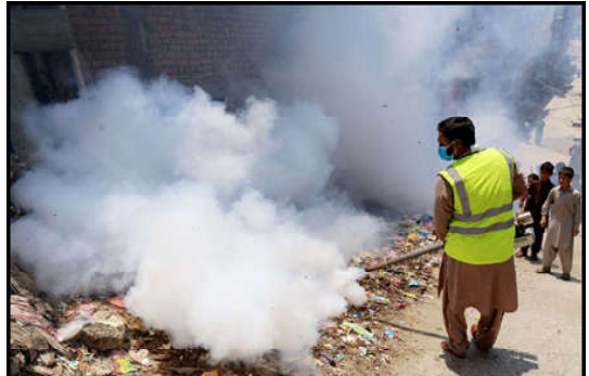
RAWALPINDI: Health workers spraying anti dengue spray in the residential areas to protect from dengue fever at Pirwadhai neighbourhood.

PESHAWAR (APP): Lines Officers and jawans of all ranks from various units and departments of the police force participated in large number in the darbar. DIG Malakand, DPOs Swat Lower Dir, Bajaur, Buner and other senior police officials were also present on the occasion. The police chief said that every officer and jawan of Khyber Pakhtunkhwa Police had performed their duties beyond the expectations despite all kinds of adverse conditions for the past two decades and every rank of officer.