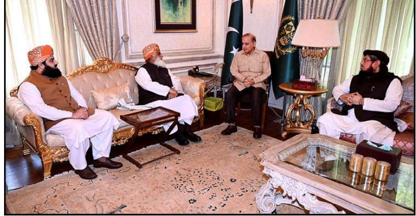
LAHORE: President Jamiat Ulema e Islam, Maulana Fazal Ur Rehman and Federal Minister for Communication Maulana Asad Mehmood calls on Prime Minister Muhammad Shehbaz Sharif.