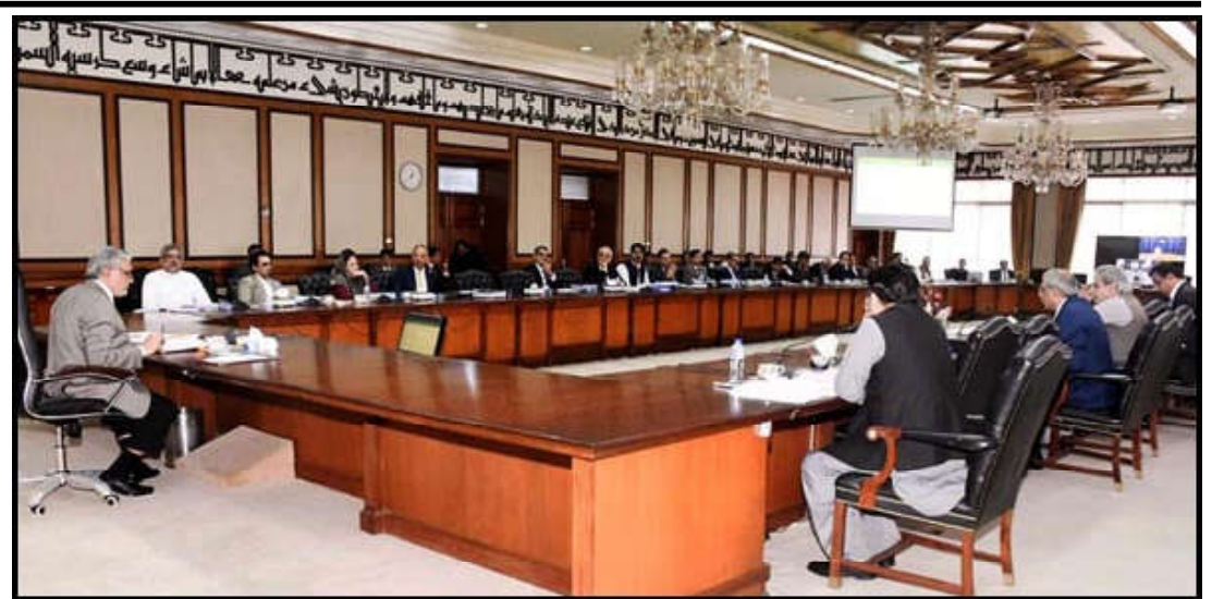
ISLAMABAD: Federal Minister for Finance and Revenue Senator Mohammad Ishaq Dar chaired the meeting of the Economic Coordination Committee (ECC) of the Cabinet.

The ECC on the summary of Ministry of National Health Services, Regulations and Coordination approved fixation of maximum retail prices (MRPs) of 49 new drugs on the basis of being lower as compared to their prices in the neighbouring countries.