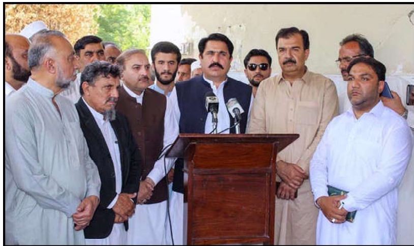
PESHAWAR: Media briefing by Federal Minister for Overseas Pakistanis & Human Resource Development Mr. Sajid Hussain Turi at Radio Pakistan.