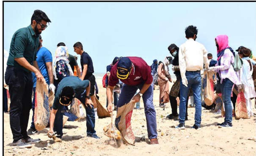
KARACHI: Pakistan Navy Personnels and students of Bahria University cleaning the beach on the occasion of World Environment Day.