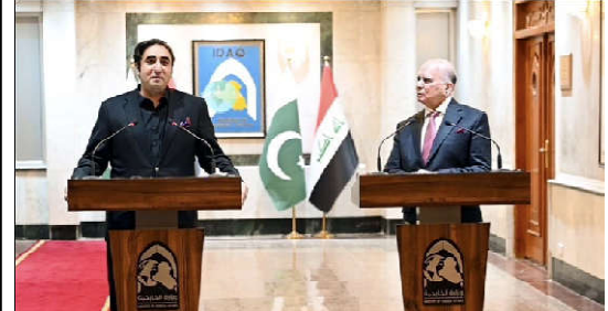
BAGHDAD: Foreign Minister Bilawal Bhutto Zardari along with his Iraqi counterpart Dr. Fuad Hussein addressing a joint press.

BAGHDAD (APP): Foreign Minister Bilawal Bhutto Zardari on Monday expressed the hope that bilateral cooperation between Pakistan and Iraq would strengthen in the future. The foreign minister, while addressing a joint press stakeout with his Iraqi counterpart Dr. Fuad Hussein, said that both the countries enjoyed decades old ties as they always supported each other in the hour of need. The foreign minister, arrived here on a three-day visit from Jordan, on the second leg of two-nation tour. Bilawal told the media that every year, a huge number of Pakistani pilgrims visit Iraq to pay respects at Ziarat. He said, "My mother, Muhtarma Benazir Bhutto Shaheed held Iraq in very high esteem and had very fond memories of her visit. I have come here with a desire to reinvigorate our fraternal ties and build them on solid foundations based on mutual respect, interests, and institutional linkages." "I want to reiterate our desire to transform our bilateral relations into mutually beneficial economic ties. During my visit, we would have range of exchanges with the Iraqi leadership and private sector. We would be signing bilateral agreements focusing on strengthening our collaboration in diverse fields," he added.