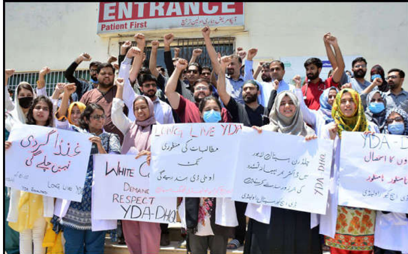
RAWALPINDI: Young Doctors holds placards and shouting slogans during protest in the favor of their demands at District Head Hospital, in City.