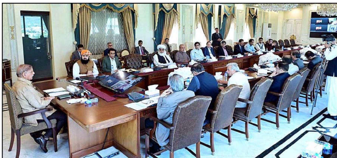
ISLAMABAD: Prime Minister Muhammad Shehbaz Sharif chairs a meeting of coalition partners for consultation on proposals for Public Sector Development Programme 2023-24.