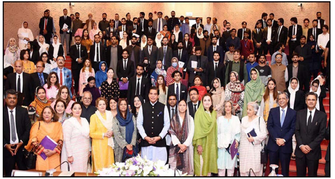
ISLAMABAD: Speaker National Assembly Raja Pervez Ashraf in a group photo with participants at seminar "Reclaiming the space: Reading the Constitution from Women's perspective organized by WPC."

stressed the need for gender parity and gender equality as enshrined in the constitution. She expressed her gratitude to the NA Speaker for supervising with a dedication to the whole procedure of Gender Budgeting for this financial year. She said that WPC would continue to strive for women and children-friendly legislation. She said that since its inception in 2008, WPC has achieved milestones in increasing chances for women's participation.