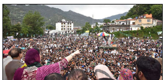
KASHMIR: Chief Organizer of Pakistan Muslim League (N) Maryam Nawaz addressing to the huge crowd during public gathering at Bagh area.