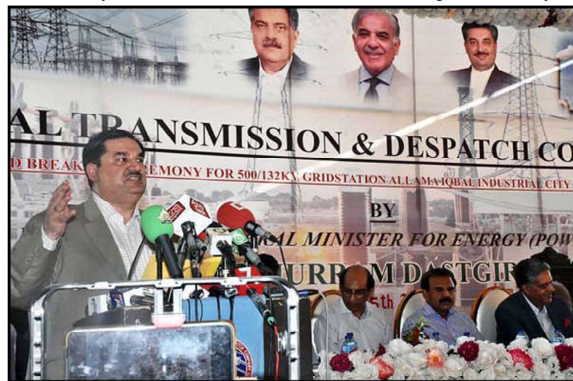
FAISALABAD: Federal Minister for Power Engineer Khurram Dastgir Khan is addressing a gathering after laying foundation stone for the construction of 500/132-KV grid station of Allama Iqbal Industrial City (AIIC) near Sahianwala.