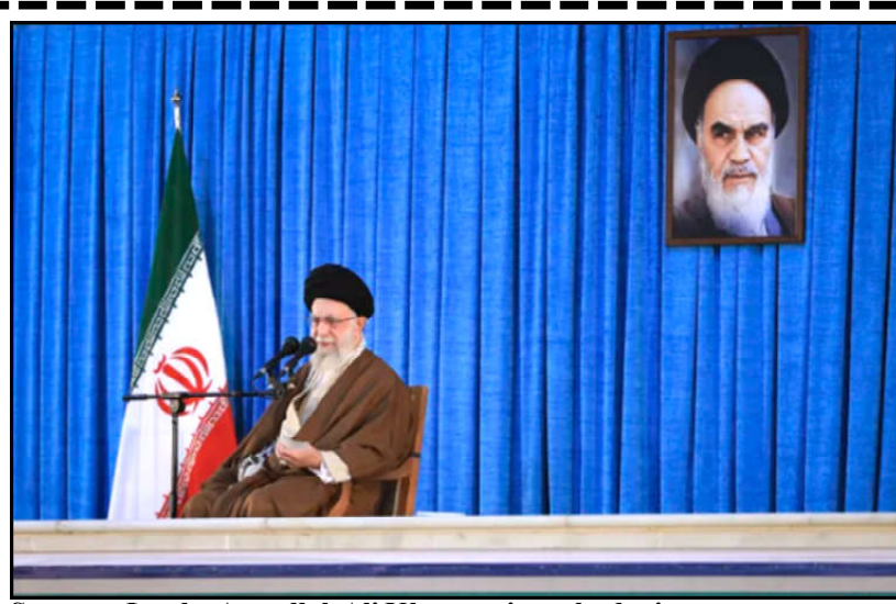
Supreme Leader Ayatollah Ali Khamenei speaks during a ceremony commemorating the death anniversary of the late revolutionary founder Ayatollah Khomeini at his mausoleum just outside Tehran, Iran.

In a video on the Freedom of Russia's Telegram channel, a man identifying himself as the commander of the Russian Volunteer Corps said he would hand over two soldiers they were holding captive in exchange for a meeting with the governor.