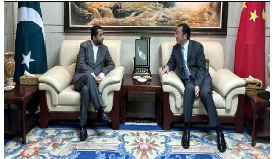
KARACHI: Provincial Home Minister Mir Ziaullah Langau meeting with Chinese Consul General Yang Yundong.

reflects the strong relations between the two countries. He mentioned that several projects have been completed under the CPEC while others are in the pipeline. He said that these projects would be increased further in view of the future requirements. Referring the development of energy, road, rail infrastructure, industrial zones, technology and tourism sectors under the CPEC, the Provincial Minister said that the business activities would be boosted with completion of the projects in the country. He also said that we would benefit from the Chinese experiences for development in different sectors. Meanwhile, the Minister also thanked the Chinese government for donating 9,000 food packages for the flood affected people of Balochistan.