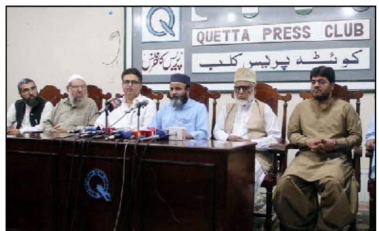
QUETTA: Haq Do Tehreek (HDT) Leader, Maulana Hidayatur-Rehman addresses to media persons during press conference held at Quetta Press Club.