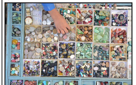
RAWALPINDI: A man is busy in selecting and purchasing gemstone and rings from roadside vendor in the city.

During the meeting, representatives of MFA highlighted the growth of Sharia compliant mutual funds and proposed that short term Sharia compliant sukuk should be launched.