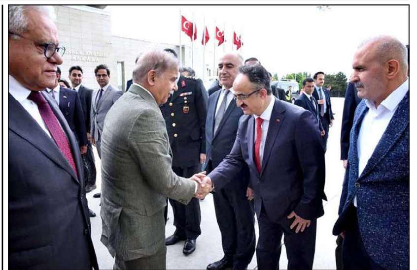
ANKARA: Prime Minister Muhammad Shehbaz Sharif departs from Ankara after completing his two day official visit of Turkiye.

manded record of the vehicles in the names of 22 federal ministers and cabinet members, including details of how many cars they purchased and sold since year 2018. The National Accountability Bureau (NAB) has launched an investigation against PTI chief, Bushra Bibi and others for the alleged gain of hundreds of canals of land in the name of Al Qadir University Trust, which reportedly caused a loss of 190 million pounds to the national exchequer. As per the charges, the former prime minister and other accused allegedly adjusted Rs50 billion — 190 million pounds, at the time — sent by the Britain's National Crime Agency (NCA) to the government. The PTI chief registered Trust for Al-Qadir University Project on Dec 26, 2019.