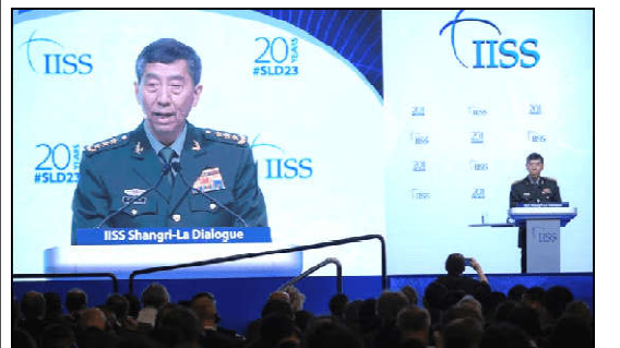
Chinese Defence Minister Li Shangfu speaks at the IISS Shangri-La Dialogue in Singapore.

cord that restricted it. Trump restored crippling sanctions on Iran that have contributed to a severe economic crisis without forcing any concessions from its leaders. Iran has also lent support to Russia's invasion of Ukraine, supplying armed drones that have wreaked havoc on the Ukrainian capital, Kyiv. "Some people are mistaken to think if we back down from our stances in certain cases that will cause the enmity of the U.S., the global arrogance, or Israel toward us to diminish," said Khamenei, who has the final say on all major Iranian policies. "This is a mistake."