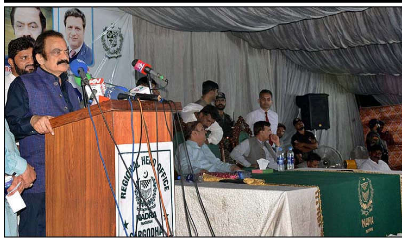
FAISALABAD: Interior Minister Rana Sana Ullah Khan addressing a public gathering during inauguration ceremony of NADRA Registration Center Aminpur Bangla and Passport Counter in Chak No.30-JB on Narwala-Aminpur Road.