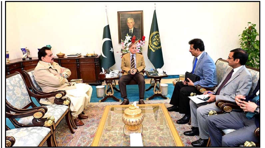
ISLAMABAD: Minister for National Food Security, Tariq Bashir Cheema calls on Prime Minister Muhammad Shehbaz Sharif.