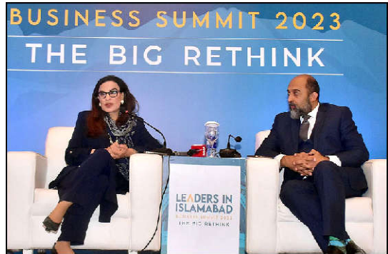
ISLAMABAD: Federal Minister for Climate Change Senator Sherry Rehman addressing the concluding session of the second day of the Leaders in Islamabad Business Summit.

She queried, "Are developed countries doing anything for climate financing?" However, a conference on climate financing in France would be held in June, she added.