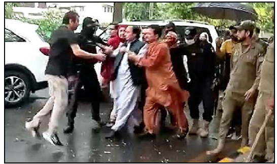
The arrest was made when he was going somewhere in his car.

LAHORE (Online): Anti-Corruption Punjab and Punjab Police arrested Former chief minister Punjab Chaudhry Pervaz Elahi from his residence.