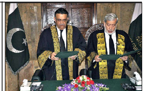
ISLAMABAD: Honourable Mr. Justice Umar Ata Bandial, Chief Justice of Pakistan administering the oath of office to Honourable Mr. Justice Iqbal Hameed-ur-Rehman, former Judge of the Supreme Court of Pakistan, as Chief Justice of the Federal Shariat Court at Supreme Court of Pakistan.

ISLAMABAD (Online): Justice Iqbal Hameedur Rehman has taken oath as Chief Justice Federal Shariat Court for a period of three years. Chief Justice of Pakistan (CJP) Umar Ata Bandial administered oath to Iqbal Hameedur Rehman Chief Justice Federal Shariat Court Thursday. The oath taking ceremony was attended by judges of Supreme Court (SC), attorney general and lawyers.