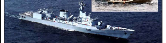
KARACHI: Pakistan Navy Ship SAIIF conducts rescue operation and safely recover stranded crew of fishing vessel in Arabian Sea, in Karachi.

Governor Balochistan stated that the institution of Ombudsman operates independently, receiving complaints and initiating investigative actions. The responsible officers and representatives of relevant institutions are called for questioning regarding the complaints, and after a thorough process, decisions based on justice and the law are made.