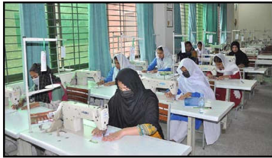
SARGODHA: Student attends classes during Skill Summer Camp 2023 at Government College of Technology for Women.

"This is despite the fact that the economy has slowed down and GDP growth rate has been revised downward.