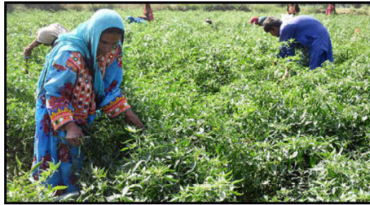
HYDERABAD: Farmers are engaged in harvesting peas in the field.

He said, "Through events like the one today, we are encouraging bilateral dialogue on climate action, and exploring innovative solutions to build Pakistan's climate resilience." In his keynote address, Federal Minister for Maritime Affairs Syed Faisal Ali Subzwari highlighted the importance of addressing climate change and promoting sustainable shipping practices in Pakistan.