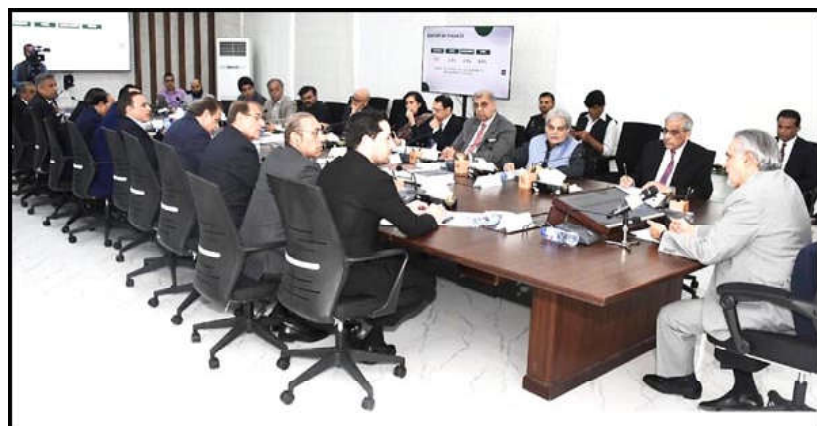
ISLAMABAD: Finance Minister Senator Mohammad Ishaq Dar held a meeting with delegation of Islamabad Industrial Association on Budget 2023-24 proposals, at FBR.