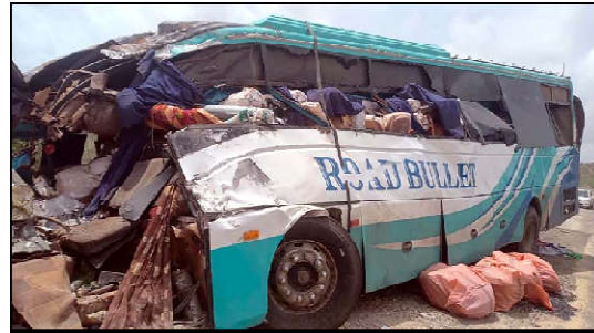
HUB: View of damaged bus after traffic accident due to over speeding and break failed located on Karachi Quetta Highway in Hub.

Earlier, Federal Minister for Information Technology and Telecommunication, Syed Amin ul Haque, inaugurated the Pakistani Pavilion at the JETIX Global Exhibition Summit in Morocco on Thursday.