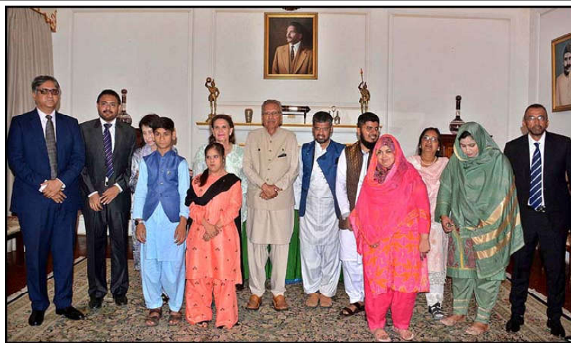
KARACHI: President Dr. Arif Alvi and Begum Samina Arif Alvi posing for a group photo with delegation of Association of Retarded Children Karachi and special children at Governor House.

The district administration of Nasirabad is committed to ensuring the mosque's land remains free from any unauthorized occupation.