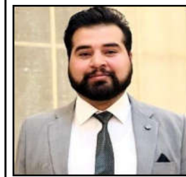
By Hamza Shahzad

Balochistan has confronted the security challenges over the years. Balochistan has struggled with security challenges posed by terrorism, insurgency, and religious violence. These disastrous incidents have had a damaging effect on the province's reputation and stalled its tourism potential. The unstable security condition in the past has discouraged tourists and damaged the province's image, leading to a weakening in tourism opportunities.