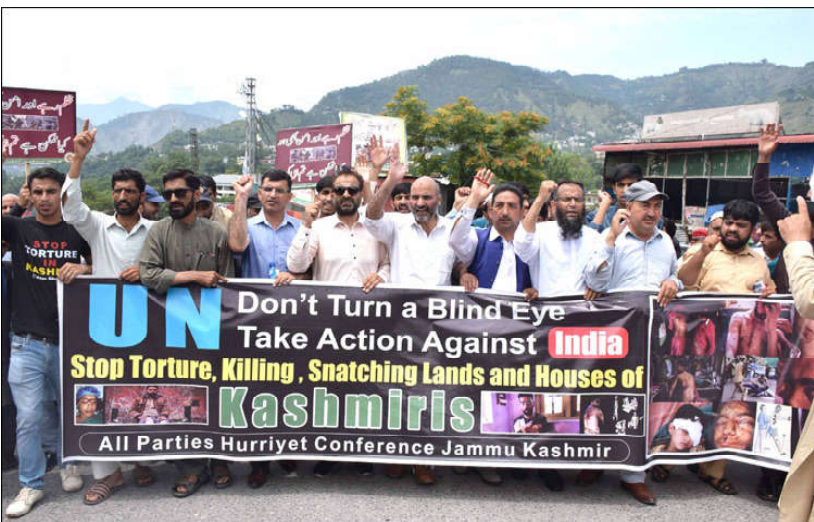
MUZAFFERABAD: Activists of All Parties Hurriyat Conference holds banner and shouting slogans during protest in the favor of their demands in the capital of AJK.