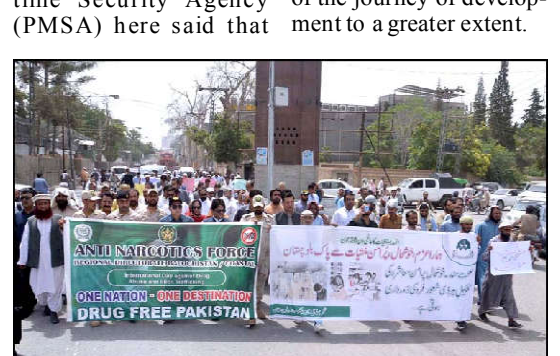
QUETTA: Rally taken out to mark International Narcotics Day under Balochistan Govt and ANF.

more than one thousand kilometres long coastal line and over 2 million kilometres of vast exclusive economic zone offer unfathomable opportunities to the country. Pakistan being an agricultural country had relied on the green economy at the time while the volume of its blue economy was greater than the green one, he observed and noted that integration of both economies could boost the pace of the journey of development to a greater extent.