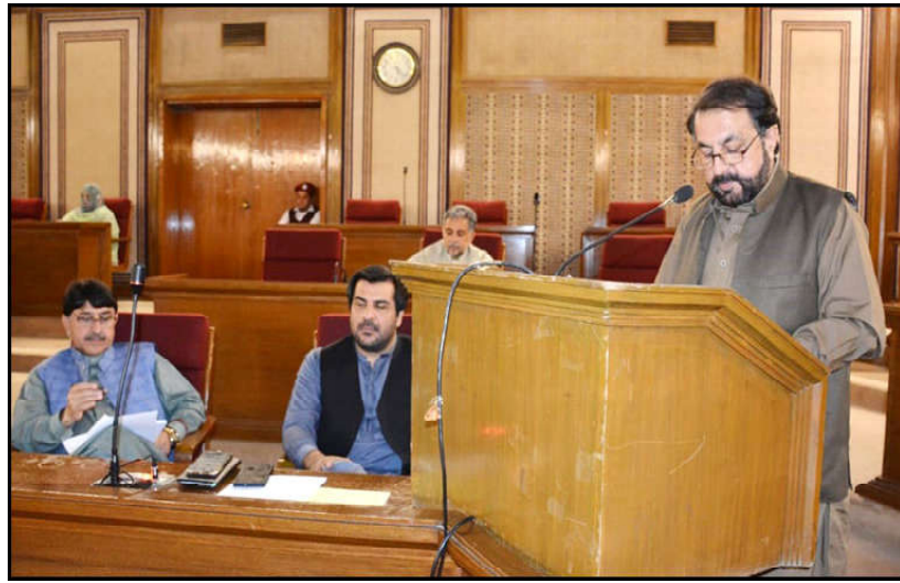
QUETTA: Provincial Finance Minister Zamrak Khan Achakzai presenting budget proposal for FY 2023-24 in Balochistan Assembly

Ph: 2841470/2841473 Vol: XVI No. 49, Zil Hajj 08, 1444 AH Tuesday June 27, 2023, Pages 08, Price Rs.15