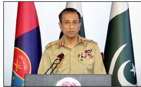
garrisons on May 9. The inquiries were presided over by officers of the rank of Major General," he added.

RAWALPINDI (APP): Director General of Inter Services Public Relations (DG ISPR) Major General Ahmed Sharif Chaudhry on Monday said there would be no reprieve or leniency for the facilitators and perpetrators of the May 9 mayhem on account of fake human rights narrative. A thorough probe had clearly indicated that May 9 riots and arson were a pre-planned and orchestrated conspiracy against the armed forces, he said, adding there was no substance in the concocted narrative of any human rights abuses. Addressing a news briefing at the ISPR Directorate, Major General Ahmed Sharif informed the media about the actions and investigations with regard to the violent incidents against military installations on the Dark Day of May 9. He said the May 9 was the darkest chapter in the 76-year history of Pakistan, and in its aftermath, the process of self-accountability within the Army was carried out without any discrimination. "Two comprehensive institutional inquiries were conducted into the incidents of violence at various