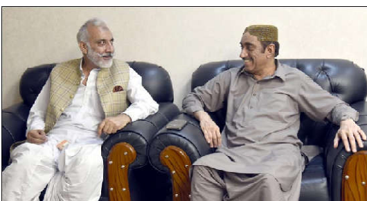
QUETTA: Provincial Minister Mir Sikandar Ali Umrani meeting with Provincial Minister Sardar Abdul Rehman Khetran