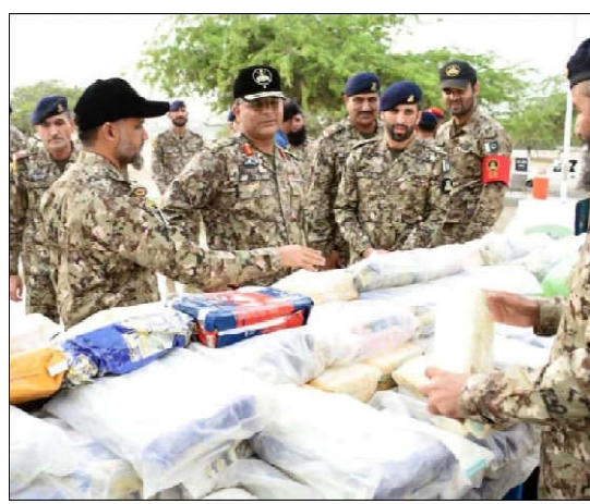
HUB: Pakistan Coast Guard Officials are showing huge apprehended drugs worth millions of rupees, during raid on local area of Kapkpar, during press conference held at PCG Headquarters.