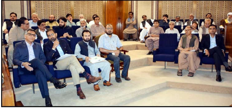
QUETTA: Balochistan Chief Secretary Abdul Aziz Uqaili, Provincial Secretaries and others watching Balochistan Assembly proceeding