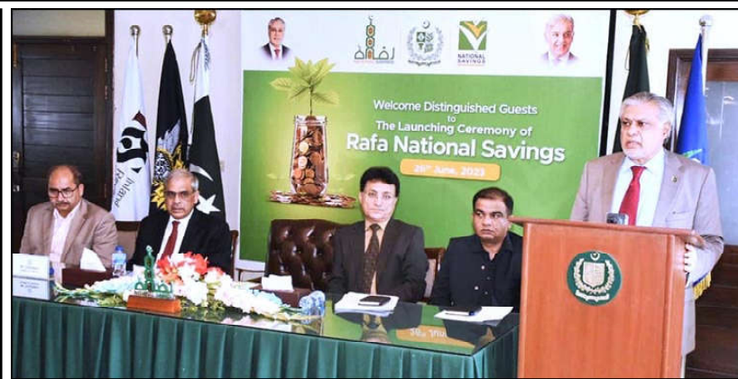
ISLAMABAD: Federal Minister for Finance and Revenue Senator Mohammad Ishaq Dar addresses the launching ceremony of Sarwa Islamic Savings Products by National Savings at Finance Division.

ISLAMABAD (APP): The per tola price of 24 karat gold increased by Rs 800 and was sold at Rs 215,300 on Monday against its sale at Rs.214,500 the previous day. The price of 10 grams of 24 karat gold also increased by Rs .685 to Rs 184,585 from Rs 186,043 whereas the price of 10 grams 22 karat gold went up to Rs 169,203 from Rs 168,574, All Sindh Sarafa Jewellers Association reported. The price of per tola silver increased by Rs.50 to Rs2,550 whereas that of ten gram went up by Rs.42.87 to Rs.2,186.21.