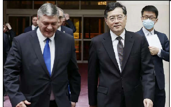
Russian Deputy Foreign Minister Andrei Rudenko and Chinese Foreign Minister Qin Gang in Beijing.