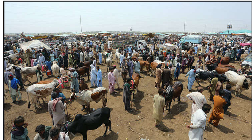
HYDERABAD: Vendors selling sacrificial animals at Animal Market Hathri Bypass in connection with upcoming Eid ul Azha.

The objective of celebrating this day was to provide a platform for MSME owners to tell their stories of entrepreneurship and its challenges, while governments, international organizations and business support organizations show their commitment to supporting their development, he explained.