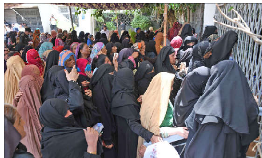
KARACHI: Woman line up at Benazir Income Support Center after Stampede broke out during the distribution of funds of the Benazir Income Support Programme (BISP) among deserving women as several women were injured in the stampede at Benazir Income Support Center in Provincial Capital.