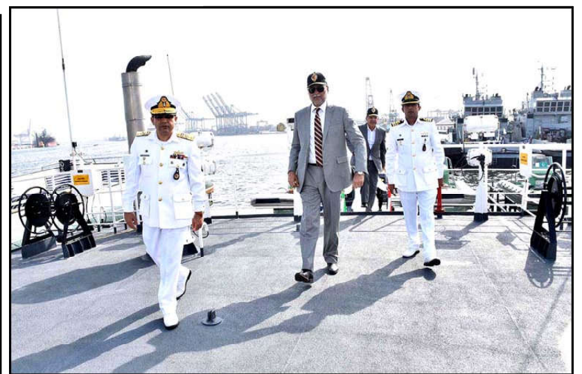
KARACHI: The Federal Minister for Planning, Development & Reform, Ahsan Iqbal visiting Karachi Shipyard.

The CJP remarked the benches can not be constituted on your desire or choice. You are raising objection on the learned judge of this court on what basis. Justice Mansoor Ali Shah remarked "I had said from the very first day tell us if some one has any objection.