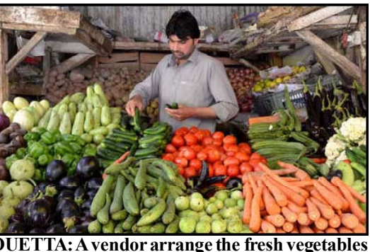
QUETTA: A vendor arrange the fresh vegetables

government for the current billion rupees has been economic situation, saying that it had created mistrust under privilege groups of people, he said while government was making allwith IMF. He said the talking to a private television channel. The impression created by the PTI chief during his tenure.