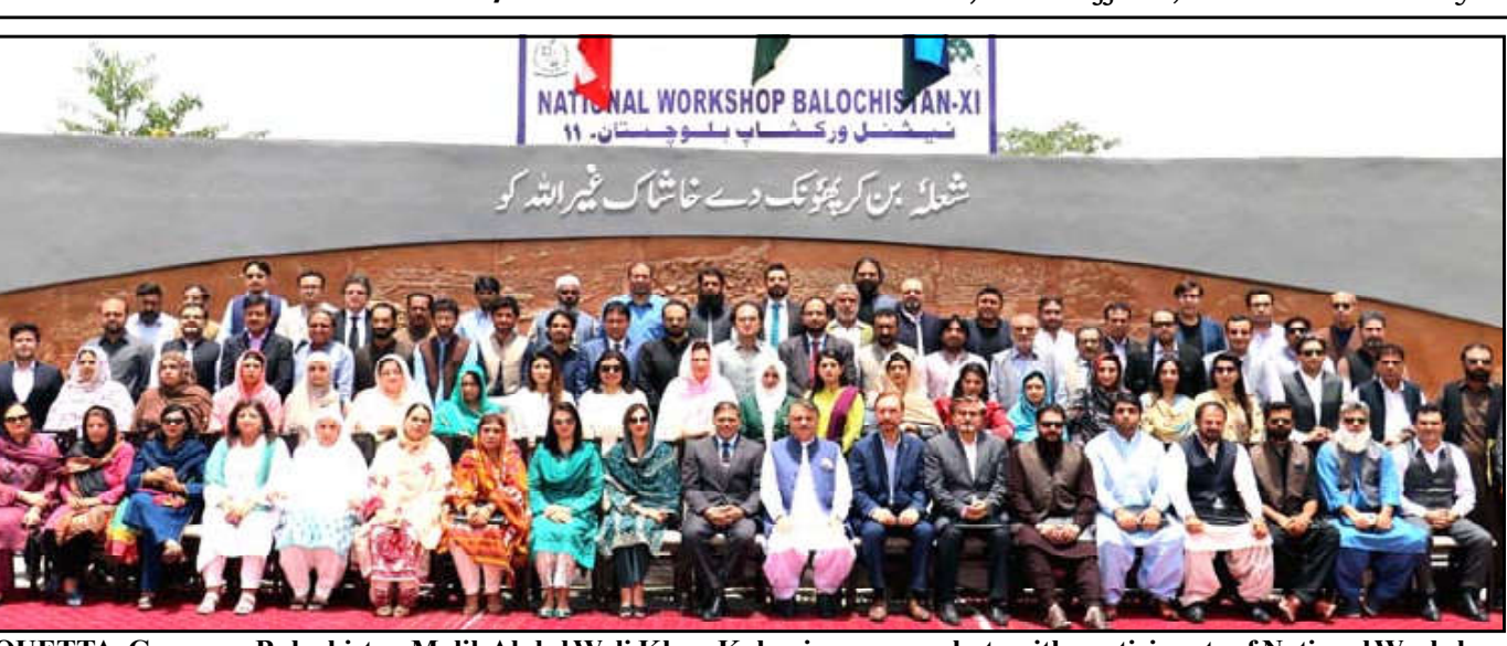
QUETTA: Governor Balochistan Malik Abdul Wali Khan Kakar in a group photo with participants of National Workshop

Ph: 2841470/2841473 Vol: XVI No. 48, Zil Hajj 07, 1444 AH Monday June 26, 2023, Pages 08, Price Rs. 15