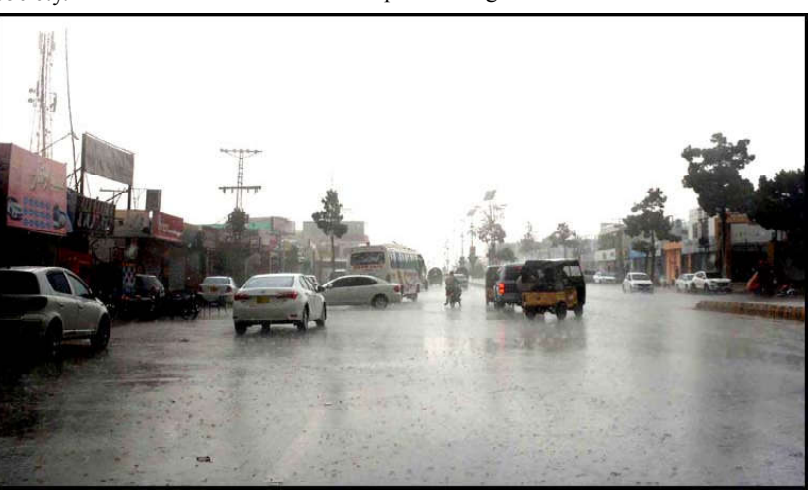
QUETTA: Vehicles are on their way during heavy rainfall after a long spell of

The cabinet regretfully observed that the women children, patients are eld erly persons travelling in the passenger coaches are forced to stop for hours at the check posts.