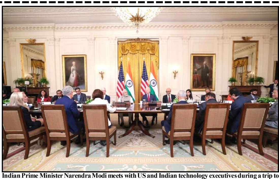
the United States.