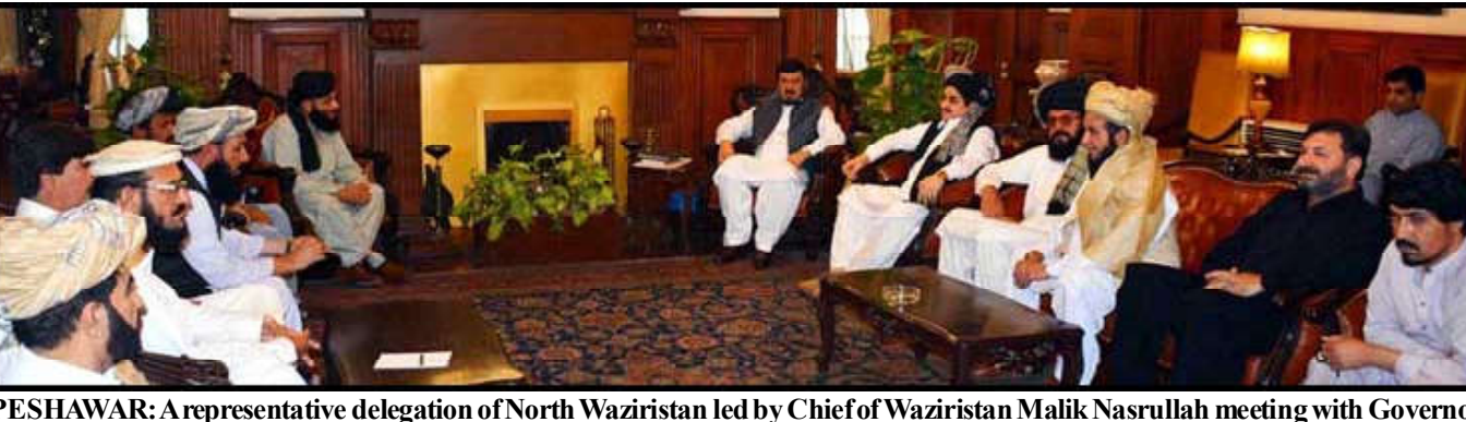
PESHAWAR: A representative delegation of North Waziristan led by Chief of Waziristan Malik Nasrullah meeting with Governor Khyber Pakhtoonkhwa Haji GhulamAli.

Analysis showed that 599 drivers, 65 underage drivers, 153 pedestrians, and 490 passengers were among the victims of road crashes Statistics show that 284 road accidents were reported in Lahore which affected 273 people placing the provincial capital at top of the list followed by 80 in Faisalabad with 81 victims and at third Multan with 70 road accidents and 72 victims. According to the data, 1028 motorbikes, 80 auto-rickshaws, 114 motorcars, 29 vans, 18 buses, 17 trucks.