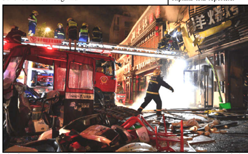
Firefighters put out fire after an explosion at a restaurant in Yinchuan, China killed at least 31 people, officials said.

he also said China had "real economic difficulties," opened a new rift just after U.S. Secretary of State Antony Blinken concluded a visit to Beijing. The trip sought to break the ice in a relationship that has hit a historical low. China delivered a formal protest of Biden's remarks on Thursday, with Chinese Ambassador Xie Feng telling senior White House and State officials that Washington "should take earnest actions to undo the negative impact" of what Biden said or "bear all the consequences," a Chinese embassy spokesperson said in a statement. "With the latest irresponsible remarks about China's political system and its top leader, people cannot help but question the sincerity of the U.S. side" in seeking to stabilize relations, the statement said. "The Chinese government and people do not accept any political provocation against China's top leader and will resolutely respond."