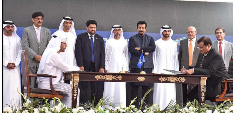
KARACHI: Federal Minister for Maritime Affairs Syed Faisal Ali Subzwari's witnessing MoU Signing Ceremony between KPT & UAE during the inauguration ceremony of Karachi Gateway Terminal Limited.

Shehbaz Sharif on Thursday met with President of Egypt Abdel Fattah el-Sisi here wherein the two leaders agreed to strengthen bilateral cooperation in multiple fields. The prime minister said that the establishment of Loss and Damage Fund at COP27 held in Sharm El-Sheikh was an important development. He said the Loss and Damage Fund had laid the basis for an important milestone at the global level. Meanwhile Prime Minister Shehbaz Sharif met United States' Special Presidential Envoy for Climate John Kerry on the sidelines of New Global Financing Pact Summit in France. During the meeting, the Prime Minister appreciated the priorities of John Kerry and the US government on the issue of climate.