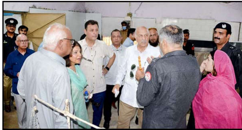
RAWALPINDI: Senator Walid Iqbal, Chairman Senate Standing Committee on Human Rights and members of the committee are being briefed during their visit at Central Jail Adiala, Rawalpindi.