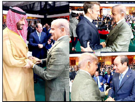
PARIS: Prime Minister Muhammad Shehbaz Shaif meets Crown Prince and Prime Minister of the Kingdom of Saudi Arabia, President of France Emmanuel Macron and President of Egypt Abdel Fattah El-Sisi during New Global Financing Pact Summit

Speaking on the occasion, Mir Ziaullah Langove said that a committee headed by IGP would be constituted. He also directed to make coordination with all concerned on daily basis. He said that we would restore the government's writ at every cost, and no one challenging the writ would be spared.