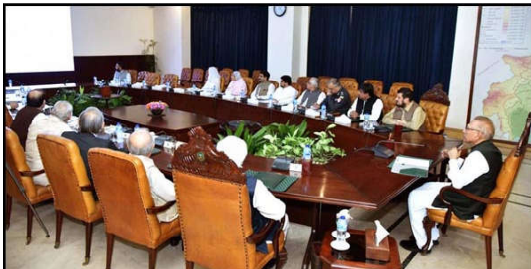
PESHAWAR: President Dr. Arif Alvi chairing a meeting on the Higher Education Sector of Khyber Pakhtunkhwa at Governor House.

were also approved. Additionally, the extension of contracts for 605 employees of the Directorate General of Literacy & Non-Formal Basic Education was approved. In terms of vehicle registration fees, a one percent reduction was approved for vehicles ranging from 1500cc to 2000cc in Punjab, aligning them with the fees in Islamabad. Regarding mining, the cabinet approved the revision of royalty rates for limestone and argillaceous clay in large-scale mining operations.