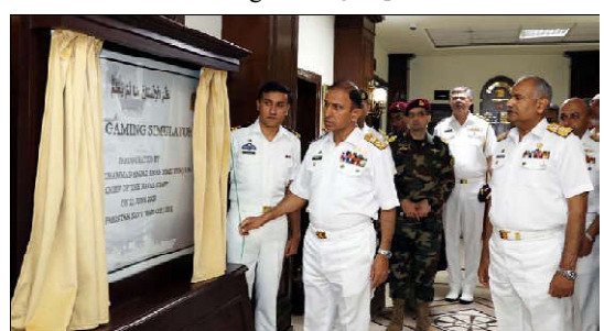
LAHORE: Chief of the Naval Staff, Admiral Muhammad Anjad Khan Niazi unveiling the plaque during the inauguration ceremony of War Gaming Simulator held at Pakistan Navy War College.

According to the details, in Sibi city and its surroundings, the sun was shining, due to which the intensity of heat increased. Special measures have been taken by the Ministry of Health to prevent and treat heatstroke. Due to the intense heat, markets and streets are deserted from noon.