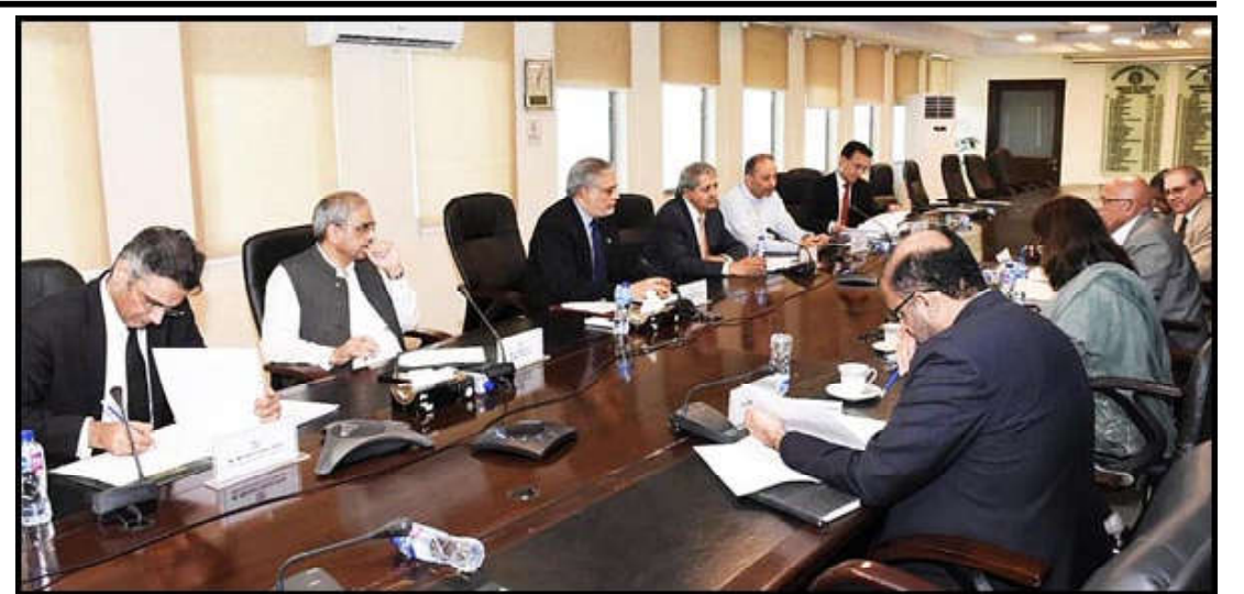
ISLAMABAD: Federal Minister for Finance and Revenue Senator Mohammad Ishaq Dar chairs the meeting of the Cabinet Committee on Inter-Governmental Commercial Transactions (CCoIGCT).

This occasion celebrates the signing of the sixth batch of the program in Pakistan. For this batch, the maximum number of slots for JDS participants in Pakistan is 17 seats for the Master's degree.