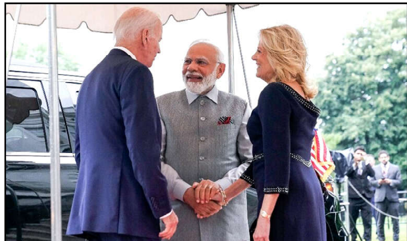
US President Joe Biden and first lady Jill Biden welcome Prime Minister of India Narendra Modi to the White House in Washington.

A State Department spokesperson declined to comment on questions about which visa types would qualify or the timing of the pilot launch. Plans for a pilot program were first reported by Bloomberg Law in February. "The pilot would begin with a small number of cases with the intention to scale the initiative over the following one to two years," the spokesperson said while declining to define small. The steps could change and are not finalized until they are announced. The White House declined to comment.