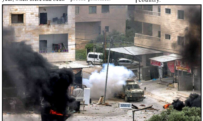
An explosive device left by Palestinians, detonated during an Israeli army raid in Jenin in the occupied West Bank.

SAO LEOPOLDO: A cyclone which tore through southern Brazil has killed at least 13 people and forced thousands from their homes, authorities said on Sunday. Torrential rain and strong winds on Thursday and Friday caused damage in dozens of towns in the state of Rio Grande do Sul, including its capital Porto Alegre — the latest in a string of weather-related disasters to hit South America's biggest country.