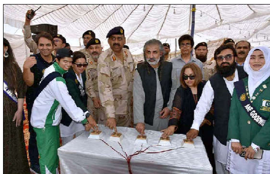
QUETTA: Federal Minister for Narcotics Control Nawabzada Shahzain Bugti pressing button to burn recovered smuggled narcotics at Kuch-More area.

QUETTA: The Federal Minister for Narcotics Control, Nawabzada Shahzain Bugti has underlined the need to make collective efforts to make the society drug-free. The Federal Minister exhorted upon the parents, civil society and stars of different fields to join hands with the government against narcotics. This and similar other views were expressed by the Federal Minister Narcotics while speaking on occasion of the drug burning ceremony organized by the Anti-Narcotics Force (ANF) Balochistan on Monday. He said that at a time when Pakistan is heading towards development, we can't afford that our youth are indulged in the menace of narcotics. He said that if the private sector is engaged in process of giving the railway land on lease, then it's income can be increased manifold, he believed.