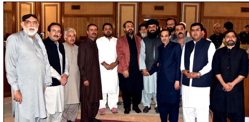
QUETTA: Balochistan Chief Minister Mir Abdul Quddus Bizenjo in a group photo with Provincial Ministers and MPAs after budget session

the intelligence mechanism in the province. Other initiatives as mentioned in the white paper were included: establishment of Eagle Squad, establishment of Counter Terrorism Command (CTC), revamping of CTD, establishment of seven new CTD, etc. In addition to this, six CTD divisional headquarters were approved at a cost of Rs. 2,141 million.