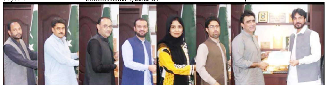
QUETTA: Commissioner Quetta Division Sohail Ur Rehman Baloch distributed certificates of appreciation among administrative officers and officials for their best performance during the 34th National Games.

New officers also expressed their determination that they will use all their abilities to carry forward the mission of Balochistan Food Authority in a better way so that the dream of providing healthy and adulteration-free food to the people of Balochistan will come true. Moreover, the Director General of BFA encouraged the new officers and employees and expressed the hope that they will work together and play their full role for the improvement of the food safety situation throughout Balochistan.