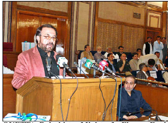
QUETTA: Balochistan Minister for Finance Engineer Zmarak Khan Achakzai presenting annual budget of 2023-24 in session of Assembly

Over Rs. 437 billion allocated for non-development expenditures with Rs. 229 billion allocated for public sector development program; 4,389 new vacancies created in provincial departments; over Rs. 115 billion allocated for general public services, over Rs. 61 billion for public order & safety affairs, Rs. 42 billion for health sector, Rs. 88 billion for education affairs and services