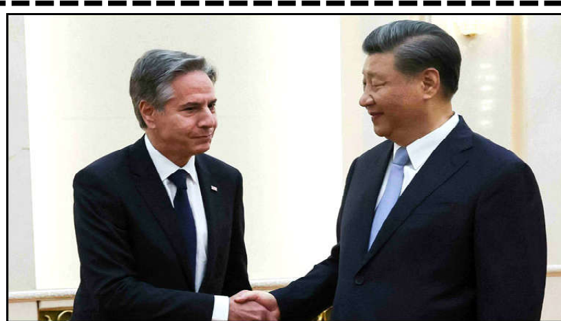
US State Secretary Antony Blinken (L) shakes hands with China's President Xi Jinping at the Great Hall of the People in Beijing.

hour, came after Blinken held more than 10 hours of talks over two days with other top officials. At the ornate Diaoyutai State Guesthouse earlier on Monday, Blinken and China's foreign policy supremo Wang Yi offered polite smiles before talks with their aides, who unlike their bosses wore masks in line with lingering Covid-19 protocols. Away from the cameras, Wang told Blinken that his trip "comes at a critical juncture in China-US relations", according to state broadcaster CCTV.