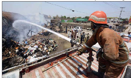
PESHAWAR: Rescue 1122 worker using water gun to douse fire in a cargo godown near Ring road.