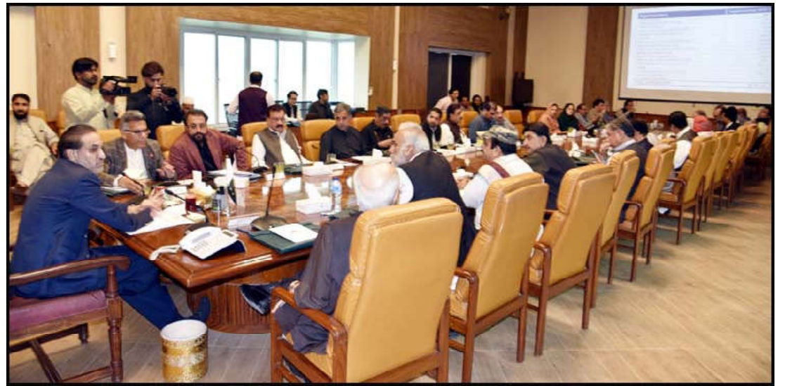
QUETTA: Balochistan Chief Minister Mir Abdul Qudus Bizenjo presiding over meeting of Provincial Cabinet

lenges posed by meagre resources, he added. He said that Pakistan initially received financial and burden-sharing support from the international community during the early years of hosting Afghan refugees, such assistance has waned over time. On its part, he said, Pakistan had extended all possible support to refugees. He said Pakistan's policies ensured their access to education and healthcare, and to have their bank accounts.