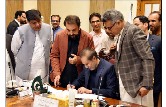
QUETTA: Balochistan Chief Minister Mir Abdul Quddus Bizenjo signing budget 2023-24 documents after approval from Provincial Cabinet

get are Rs. 645.191 billion. The capital receipts are included Rs. 34.733 billion and state trading - food are Rs. 11.4 billion. Out of the capital receipts, the province would get Rs. 25 billion under the Foreign Project Assistance (loan) and Rs. 9.609 billion would be received from recoveries of the loans, advances and investments. The province would get Rs. 464.705 billion from the divisible pool while it would get Rs. 20 billion from straight transfers.