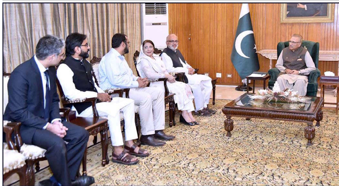
ISLAMABAD: President Dr. Arif Alvi in a meeting with a delegation from Artificial Intelligence Education Foundation (AIEF), at Aiwan-e-Sadr.