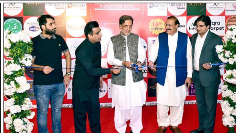
ISLAMABAD: Advisor to the Prime Minister on Kashmir Affairs and Gilgit Baltistan, Qamar Zaman Kaira cutting the ribbon for opening ceremony of Furniture Exhibition.

However, during last 11 months of current financial year the imports of wheat unmilled increased by 34.85 percent.