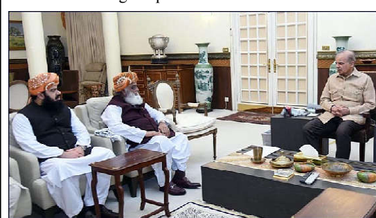
ISLAMABAD: President JUI-F Maulana Fazl-Ur-Rehman and Federal Minister for Communications Maulana Asad Mahmood calls on the Prime Minister Muhammad Shehbaz Sharif.

ISLAMABAD (APP): Secretary of State for Foreign, Commonwealth and Development Affairs of the United Kingdom, James Cleverly telephoned Foreign Minister Bilawal Bhutto Zardari and discussed issues of mutual interest. FM Bilawal in his statement on twitter handle account said that he was pleased to receive the phone call from his British counterpart, with whom he discussed bilateral ties. He mentioned that the conversation focused on the urgent need for mitigation measures to combat climate change and natural disasters. The critical role of international financial institutions in climate financing and reconstruction in disaster-hit areas also came under discussion.