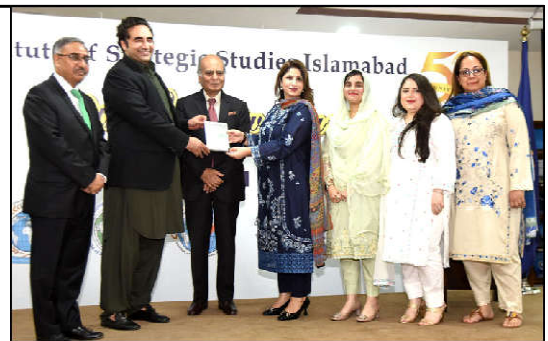
ISLAMABAD: Minister of Foreign Affairs of Pakistan Bilawal Bhutto Zardari presenting the shields to employees of ISSI during the "50th Foundation Day" ceremony of Institute of Strategic Studies Islamabad (ISSI), Sector F-5 in Federal Capital.

According to the Pakistan Meteorological Department (PMD), the SCD lies near Latitude 23.8°N and Longitude 69.4°E at a distance of 200km east-southeast of Kei Bandar, 180km southeast of Thatta and 270km east of Karachi. The associated maximum sustained surface winds are 80-100 Km/hour. Very rough sea conditions over Northeast Arabian Sea prevail with wave heights of 10-12 feet.