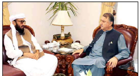
QUETTA: Former Deputy Speaker Balochistan Assembly Syed Matuallah Agha meeting with Governor Balochistan Malik Abdul Wali Khan Kakar

It has been requested to increase 33 seats i.e., 11 each for all the three medical colleges of the province. According to the official memorandum, the initiative of approval of increase in 33 additional seats in the medical colleges as per the decision of provincial cabinet would be appreciated.