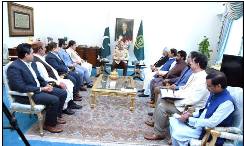
ISLAMABAD: Prime Minister, Muhammad Shehbaz Sharif exchanging views with a delegation of PML-N leadership from Balochistan during meeting held in Islamabad.

Ph: 2841470/2841473 Vol: XVI No. 40, Zee'qad 27, 1444 AH Saturday June 17, 2023, Pages 08, Price Rs.15