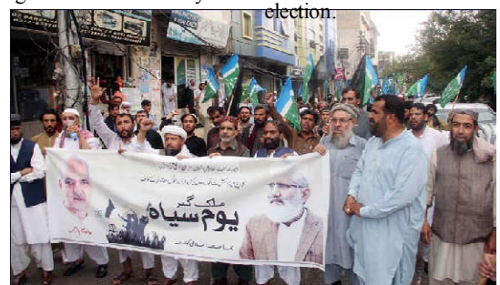
QUETTA: Activists of Jamaat-e-Islami (JI) are holding protest demonstration against rigging in mayoral election in Karachi, at Quetta Press Club.