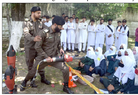
RAWALPINDI: Rescue I122 worker demonstrating about firefighting, during session in Govt Post Graduate College in City.