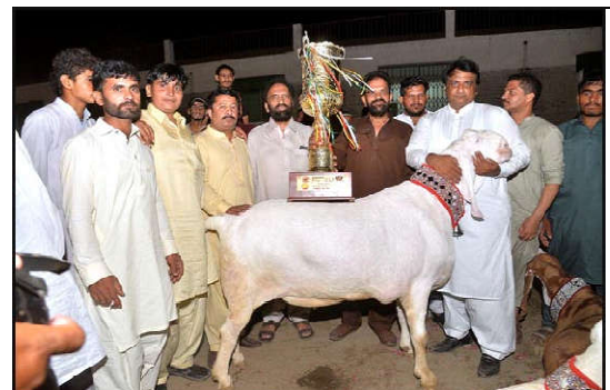
FAISALABAD: Display of a goat that got first position in heavy weight/beauty competition during "25th International Goat Mela 2023" at University of Agriculture Faisalabad (UAF).

Cargo throughput of 30,849 tonnes, comprising 30,849 tonnes imports Cargo exclusively, was handled at the port during the last 24 hours.