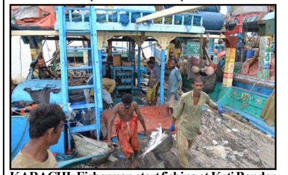
KARACHI: Fisherman start fishing at Keti Bander after cyclone Biparjoy has now reduced.

The DPP with the support of the Rice Exporters Association of Pakistan (REAP) took special steps to upgrade 15 more mills as per the Guidance Document prescribed by the Russian Federation for compliance with the requirements for rice exports.