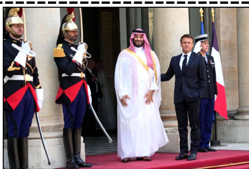
Saudi Crown Prince Mohammed bin Salman poses with French President Emmanuel Macron.

Paris, Prince Mohammed is also expected to push for Riyadh to host the 2030 World Fair's Expo. His visit to France comes as the prince has sought to rehabilitate his image abroad following the 2018 killing and dismemberment of Washington Post columnist Jamal Khashoggi at the Saudi Consulate in Istanbul. While Saudi Arabia denies the prince's involvement, U.S. intelligence agencies have assessed he likely ordered Khashoggi's killing as part of a wider crackdown on any challenge to his rule.