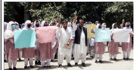
QUETTA: Members of Young Nurses Association Balochistan are holding protest demonstration against not getting scholarship from 14 months.