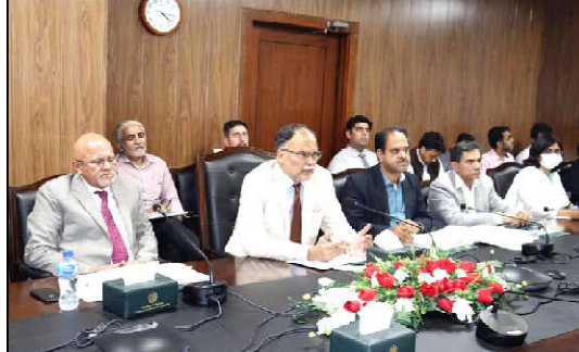
ISLAMABAD: Federal Minister for Planning Development & Special Initiatives, Ahsan Iqbal chaired a meeting to review the progress of projects in Gwadar.

WB approves $200 million aid for Pakistan WASHINGTON (Online): World Bank (WB) Executive Board has accorded approval to provide aid of 200 million dollars to Pakistan. This aid will be spent in rehabilitation works in flood affected areas in KP.