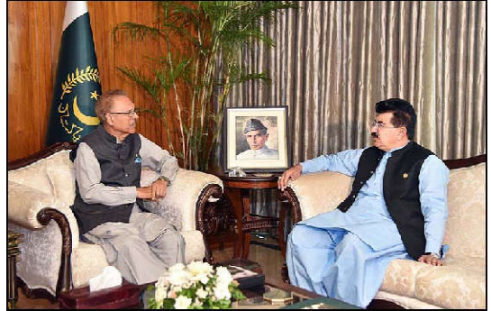
ISLAMABAD: Chairman Senate, Muhammad Sadiq Sanjrani, called on President Dr. Arif Alvi at Aiwan-e-Sadr.