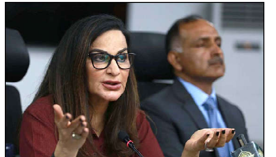
ISLAMABAD: Federal Minister for Climate Change Sherry Rehman briefs to media persons about Cyclone Biparjoy during a press conference at NDMA.

The Minister added that it was the second media briefing at the NDMA and was aimed at providing important updates to the masses through the media. BIPARJOY, she said had achieved the intensity of a very severe cyclonic storm of Category-3 which was massive after the cyclone that hit the country's coastline after 1999.