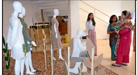
LAHORE: Students of Kinnaird College for Women taking keen interest in Textile Exhibition at Al-Hamma Art Gallery.

Independent Report LAHORE: Governor Punjab, Muhammad Balighur Rehman, donated blood for Thalassemia patients in blood camp organized by Sundas Foundation on the occasion of World Blood Donors Day here at Governor House Lahore today.