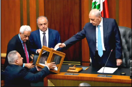
Lebanese Parliament Speaker Nabih Berri casts his vote as parliament gathers to elect a president at the parliament building in downtown Beirut, Lebanon.

Lukashenko said in an interview with the Rossiya-1 Russian state TV channel which was posted on the Belarusian Belta state news agency's Telegram channel. "The bombs are three times more powerful than those (dropped on) Hiroshima and Nagasaki," he said, speaking on a road in a forest clearing with military vehicles parked nearby and some kind of military storage facility visible in the background. Russian President Vladimir Putin said on Friday that Russia, which will retain control of the tactical nuclear weapons, would start deploying them in Belarus after special storage facilities to house them were made ready.