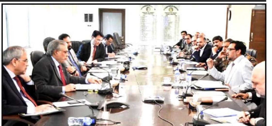
ISLAMABAD: Federal Minister for Finance and Revenue, Senator Mohammad Ishaq Dar chaired a meeting on Civil Aviation issues, at Finance Division.

France, through the French Development Agency, is providing technical and financial support in several sectors such as energy, water and sanitation, urban development, and cultural heritage. The French loan will support NTDC in the components of the projects including: Construction of a new 220KV substation and 50km of new 220KV transmission lines to be connected to it in Aarifwala, which will be connected to the MEPCO grid.