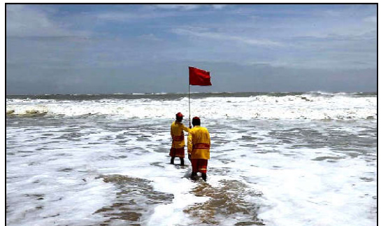
KARACHI: Officials placing red flag after alerts issued by the authorities regarding the effects of cyclone "Biparjoy" at the Hawksbay Beach.