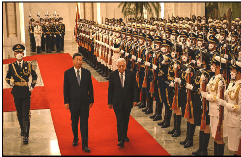
China's President Xi Jinping (C) and Palestinian President Mahmud Abbas attend a welcoming ceremony at the Great Hall of the People in Beijing.

But finding a lasting solution to Israeli-Palestinian tensions may prove more elusive, as peace negotiations between the two sides have been stalled since 2014. In April, Chinese Foreign Minister Qin Gang told his Israeli and Palestinian counterparts that his country was willing to aid peace negotiations, Xinhua reported.