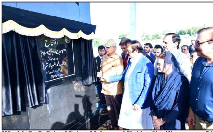
ISLAMABAD: Prime Minister Muhammad Shehbaz Sharif inaugurates 7th Avenue Interchange on Srinagar Highway.