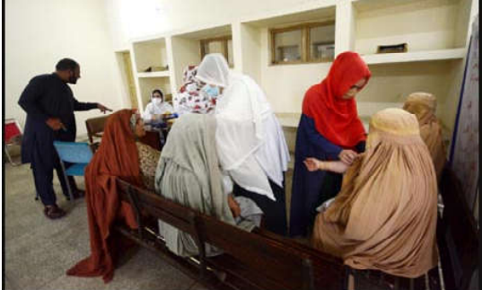
PESHAWAR: People receiving vaccination at Haj center in Peshawar, Hayatabad.