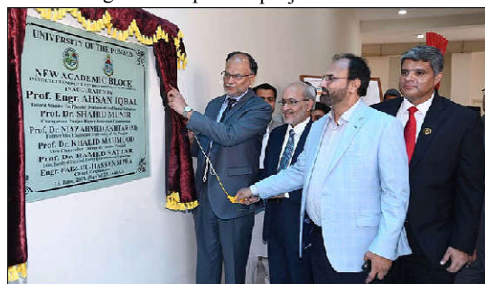
LAHORE: Federal Minister for Planning Development and Special Initiatives Prof. Dr. Ahsan Iqbal unveiling the plaque to inaugurate ceremony of the new building of Institute for Energy and Environment Engineering at Punjab University.