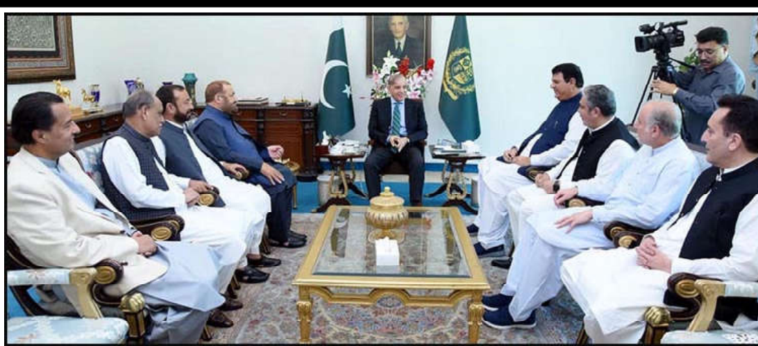
ISLAMABAD: A delegation of PML-N leadership from Khyber Pakhtunkhwa calls on Prime Minister Muhammad Shehbaz Sharif.

Chitrali criticized the federal budget for its inclusion of interest-based financial measures, expressing concern over the substantial expenditure on loan interest payments to international institutions.