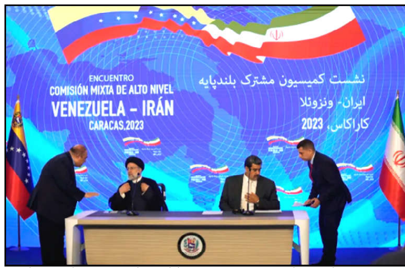
Iranian President Ebrahim Raisi and Venezuelan President Nicolás Maduro get ready to sign a bilateral accord at Miraflores presidential palace in Caracas, Venezuela.

materials to build a drone manufacturing plant east of Moscow, while the Kremlin seeks to ensure a steady supply of weapons for its invasion of Ukraine. U.S. intelligence officials believe the plant in Russia could start operations early next year, but Iran has said it supplied drones to Russia before the start of the war. The more than dozen agreements signed by officials from the countries Monday include scholarships for Venezuelan students and the importations of cattle to Iran.