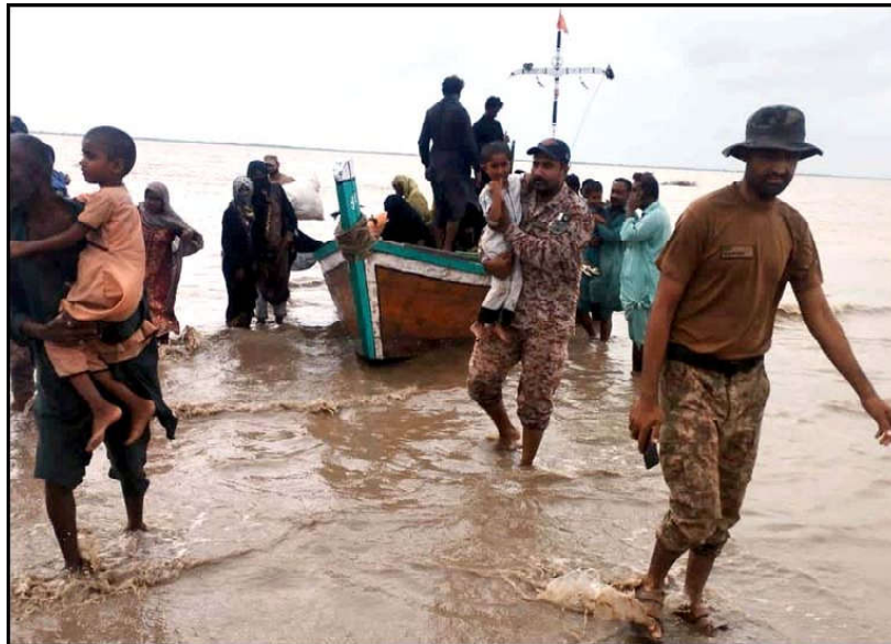
SUJAWAL: Pakistan Army Emergency Response Teams officials evacuating local populace from Coastal areas due to tropical extremely severe cyclone storm named Biparjoy, during relief operation in various Goths of Golarchi area in Sujawal.

PM Shehbaz said with the help of initiatives announced by the government in the budget 2023-24, the youth would become the architects of Pakistan's development by starting their own businesses in IT, industry and agriculture sectors.