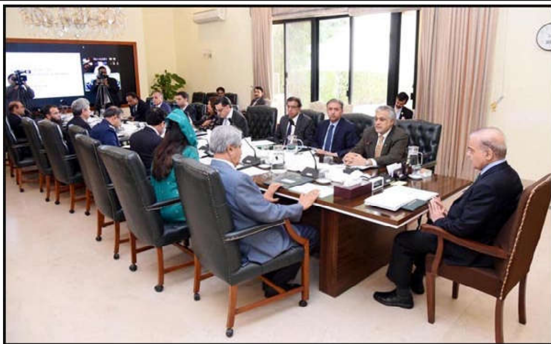
ISLAMABAD: Prime Minister Muhammad Shehbaz Sharif chairs a review meeting regarding matters relating to Pakistan Railways.

The minister said that under the terms of the contract, it would be Pakistan's prerogative to accept the cargo or not, but Azerbaijan would be obligated to provide distress cargo monthly.