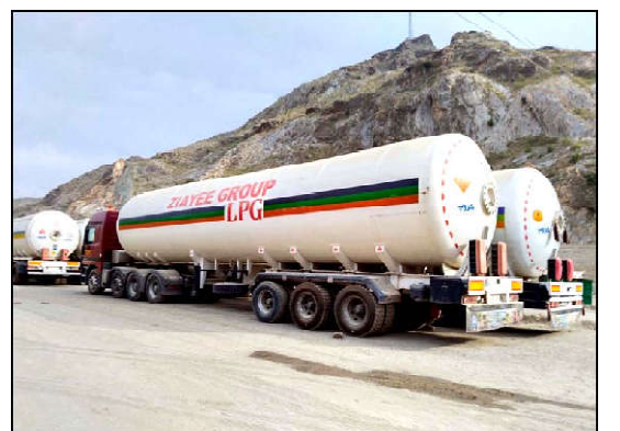
LANDIKOTAL: First consignment of Russian LPG reaches Pakistan, at Torkham Border in Landikotal

LAHORE (Online): An earthquake measuring 5.6 on the Richter scale struck eastern Kashmir on Tuesday, setting off tremors that were felt in Islamabad, Lahore and other parts of the country. The Pakistan Meteorological Department said the earthquake originated at 1:04pm with its epicentre in Eastern Kashmir at the depth of 10 kilometres. It recorded the earthquake's longitude at 75.97 E and latitude at 33.32 N. Tremors were also felt in Rawalpindi, Jhelum, Hafizabad, Azad Kashmir and other areas.