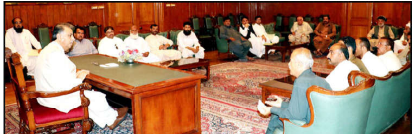
QUETTA: Different delegations meeting with Balochistan Governor Malik Abdul Wali Khan Kakar

Ahsan Iqbal said that for action against terrorism and extremism, the security forces and law enforcement agencies were provided all resources and support to eliminate terrorism.