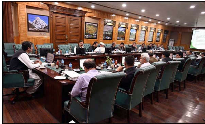
GILGIT: Chief Minister Gilgit-Baltistan Khalid Khurshid Khan chairing a cabinet meeting at CM Secretariat.

As many as, 1029 motorcycles, 75 rickshaws, 96 cars, 25 vans, nine buses, 37 trucks and 96 other vehicles and slow-moving carts were involved in the road accidents.