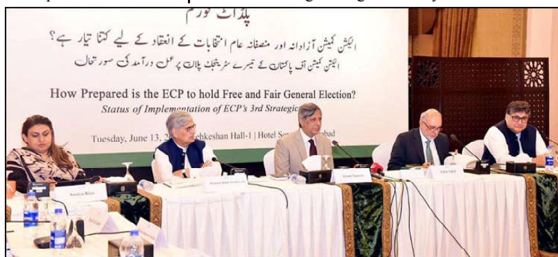
ISLAMABAD: Federal Minister for Law and Justice, Senator Azam Nazeer Tarar addressing the Public Forum organized by PILDAT on the Status of Implementation of the ECP's 3rd Strategic Plan.

The committee approved the FBR proposal regarding recovery of liability outstanding under other law which includes empowering the commissioner to recover any outstanding liability.