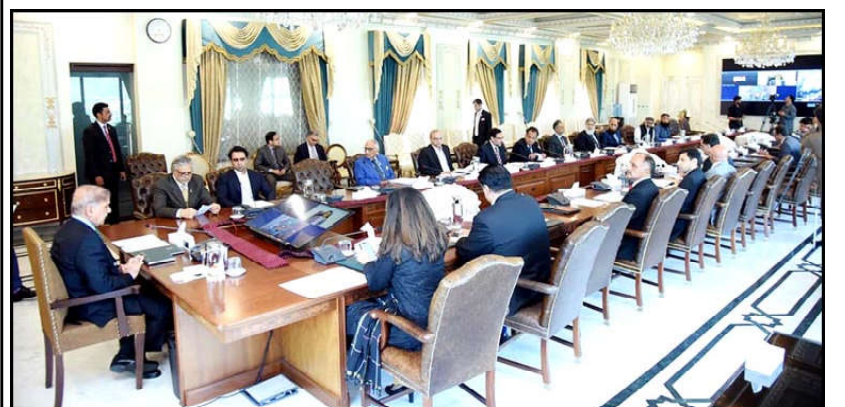
ISLAMABAD: Prime Minister Muhammad Shehbaz Sharif chairing a meeting regarding preparedness and measures taken for the approaching "Biparjoy" Cyclone.