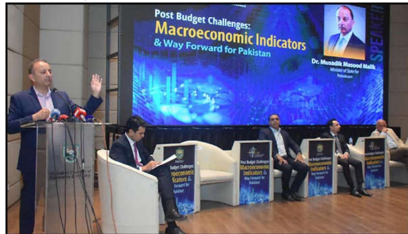
ISLAMABAD: Minister of State for Petroleum Musadik Malik addressing during post budget challenges Macroeconomic Indicators and Way Forward for Pakistan at ICCL.