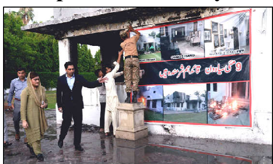
LAHORE: Minister for Information and Broadcasting Marriyum Aurangzeb visiting Jinnah House.

LAHORE (APP): Minister for Information and Broadcasting Marriyum Aurangzeb on Tuesday said those who had burnt the house and pictures of Quaid-i-Azam Ali Jinnah on May 9 could neither be regarded as responsible citizens nor patriots.