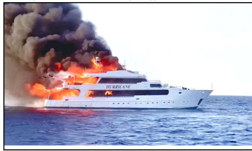
MARSAALAM: Plumes of smoke erupt from a yacht.

heroes, the participants in the special military operation," Putin said, using the Russian official terminology for the Ukraine conflict. The holiday comes amid intensifying counter-offensive operations by Ukraine against Russian forces that occupy about 20% of the country. Ukrainian officials in recent days claimed to have regained control of some villages and to have made advances at some points along the front line. Although Russia has been widely criticized for strikes on civilian targets including apartment buildings, Putin told recipients of the state awards that he was shocked by Ukraine attacking civilian areas.