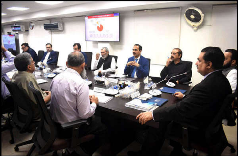
LAHORE: Federal Minister for Power Khurram Dastgir Khan presiding over the meeting of LESCO officials at LESCO Headquarter.

coalition government, he added, started various projects under CPEC especially in power sector at full speed and in the new fiscal year, Rs 900 billion relief in the electricity bills would continue to be given to targeted/ deserving consumers, while load-shedding duration would also be less than in the past years. The federal minister said the government would also give a tariff differential subsidy of Rs 150 billion.