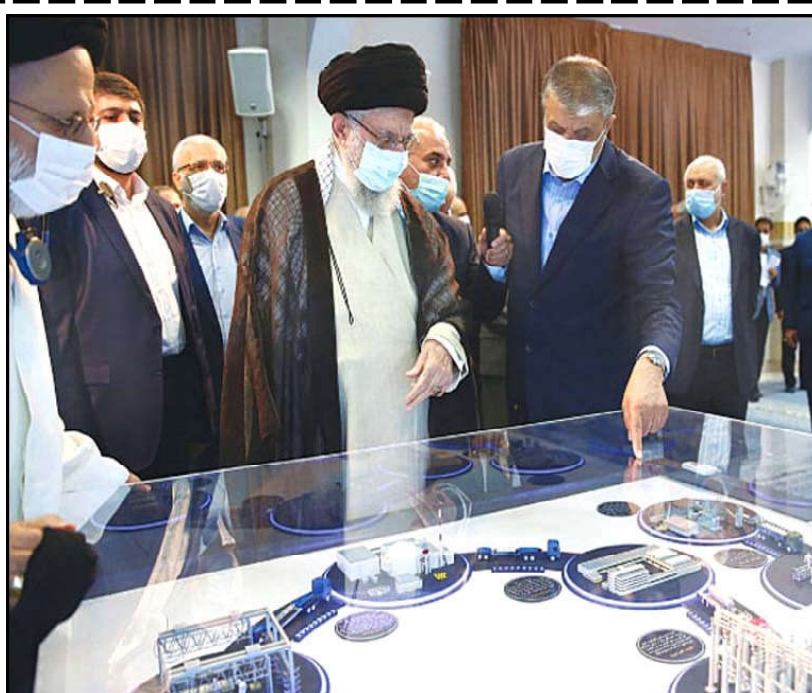
TEHRAN: Iran's Supreme Leader Ali Khamenei views a model of a nuclear facility.

ers of union with Greece. Turkish Cypriots declared independence nearly a decade later, but that's only recognized by Turkey, which maintains more than 35,000 troops and an array of armaments in the north. U.N.-led peace talks haven't resolved the dispute. The most recent round in July 2017 broke down over a Turkish insistence on maintaining military intervention rights and a permanent troop presence under any new arrangement. Another stumbling block was a Greek Cypriot rejection of a Turkish Cypriot demand for the right to veto all government decisions on a federal level.