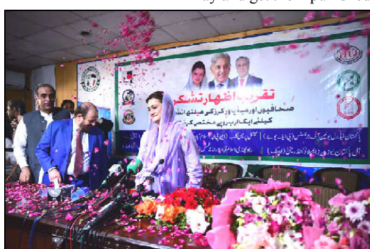
Ms. Marriyum Aurgangzeb, Federal Minister for Information and Broadcasting participating in a thanksgiving reception held in view of allocating funds for health insurance in the budget for the journalists & media workers at National Press Club, Islamabad.

Independent Report QUETTA: The Provincial Minister for Home and Tribal Affairs, Mir Ziaullah Langove has stated that the progress of Baloch nation lies in unity and harmony and as such the provincial government is striving to resolve the tribal disputes, however, it is also responsibility of the tribal elders to play their part in this regard. The Minister Home was speaking to prominent tribal elder and Bangulzai tribe chieftain, Sardar Kamal Khan Bangulzai here on Monday. During the course of meeting the issues related to tribal disputes and their solution were discussed between them. Speaking on the occasion, the Provincial Minister maintained that we want an end to the tribal disputes and bloodshed in the province. For this very aim, although the government is also making efforts, but the role of tribal elders and chieftains is crucial in this regard, he added.