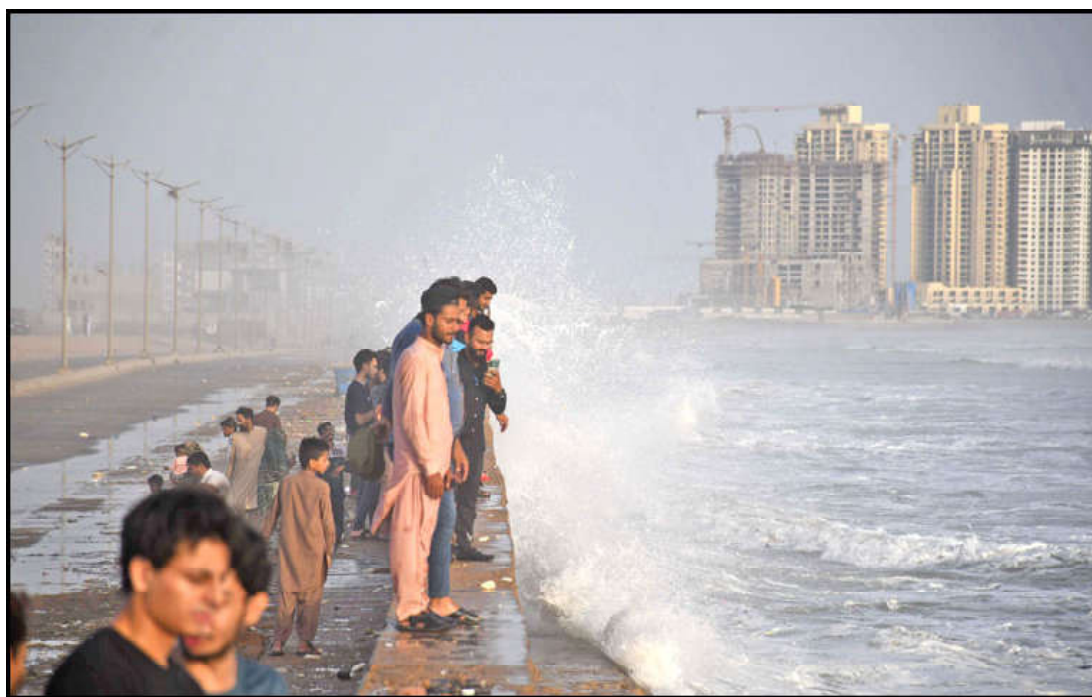
KARACHI: People openly defy Section 144 imposed by the administration as a preventive measure in anticipation of tropical cyclone Biparjoy. Sindh government has decided to evacuate residential areas and other human settlements located near the coast areas of Sindh due to threat of cyclone Biparjoy

ISLAMABAD (Online): Chief Justice of Pakistan (CJP) Umar Ata Bandial has remarked the country at present is facing financial hardships, therefore, the money which is lying outside the country should be kept in the country to improve foreign exchange reserves. He further remarked we can understand the compulsions of government. It is responsibility of every one to extend cooperation. He gave these remarks during the hearing of the petition against imposition of tax on foreign assets here Monday. The court while giving stay order on the order for paying 100 percent tax on non transferable property adjourned the hearing of the case for indefinite period. A 3-member bench of SC presided over by the Chief Justice of Pakistan