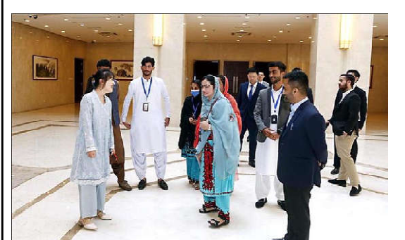
ISLAMABAD: A delegation of student of University of Gwadar visiting Chinese Consulate