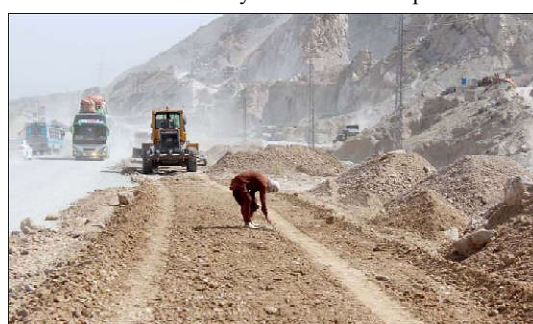
QUETTA: A view of expansion work of eastern bypass road is under process.

of cooperation between Pakistan and Russia in various fields had started to open. The arrival of Russian oil in Pakistan was the beginning of a new era of cooperation between the two countries, he added. He said that Pakistan valued relations with Russia and Russian cooperation. There was great scope for mutual investment, economic development.