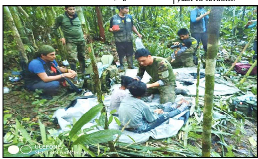
Colombian military soldiers attend to child survivors from a Cessna 206 plane that crashed on May 1 in the jungle in this handout photo released.

Monitoring Desk BOGOTA: Four Indigenous children who had been missing for more than a month in the Colombian Amazon rainforest were found alive and flown to the capital Bogota early on Saturday. The children, who survived a small plane crash in the jungle, were transported by army medical plane to a military airport. They were taken off the plane on stretchers.