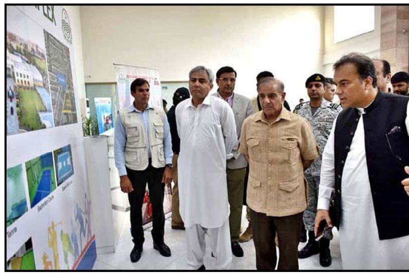
LAHORE: Prime Minister Muhammad Shehbaz Sharif being briefed about Sabzazzar Sports Complex.

Meanwhile, Caretaker Chief Minister Punjab Mohsin Naqvi visited the Punjab Agriculture, Food and Drug Authority project to review ongoing construction works. He inspected construction work of auditorium, sample centres, labs, meeting room, other sections and expressed satisfaction over the pace of work. While directing the authorities concerned to continue construction work at the same speed, he said that the project of public importance should be made functional at the earliest.