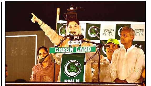
MULTAN: Chief Organizer PML-N Maryam Nawaz addressing the Youth Convention at Shujaabad.

QUETTA (Online): It has been revealed that 250 hospitals of Balochistan province are only established in papers and files but not a single brick was placed anywhere in the land. 661 hospital, basic health centers and rural health centers are present in the official documents of health department of Balochistan. Surprisingly 250 health center were even not build and they are only limited to documents whereas 656 health centers have only namely facilities and patients are facing problems.