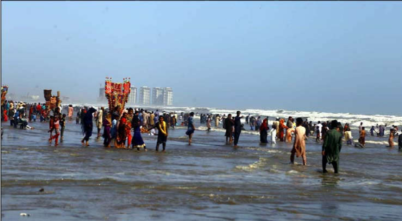
KARACHI: People are seen at Seaview beach despite alerts to remain away ahead of the Extremely Severe Cyclonic Storm Biparjyo.

Addressing concerns about the misuse of blasphemy laws, the conference clarified that these laws should not be exploited for personal or political gains. It emphasized that the law is not being misused against any political party and called for international organizations and countries to understand the true context.