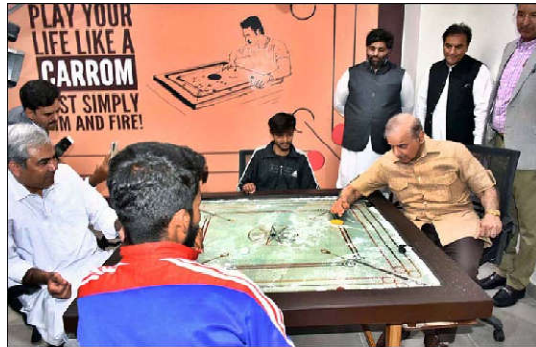
LAHORE: Prime Minister Muhammad Shehbaz Sharif playing carrom board during his visit to various sports facilities at Sabzazar Sports Complex.

Putting the burden of the climate change on developing country like Pakistan would be injustice, Bilawal Bhutto said urging the global community to support in tackling the devastation caused by the climate change.