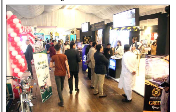
QUETTA: Visitors take keen interest at stall during International Property Expo held in Quetta.