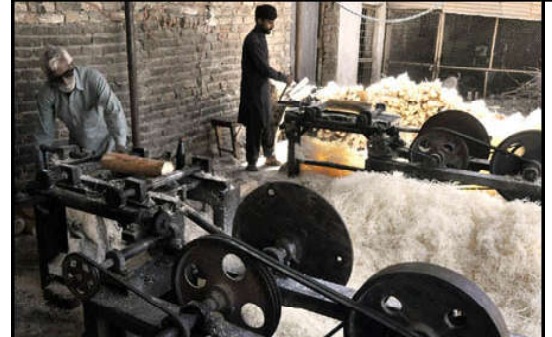
RAWALPINDI: Workers busy producing khas from wood pieces with the help of machine to be used in making of room cooler at his workplace.