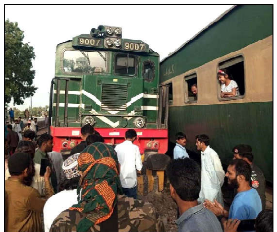
GHOTKI: View of site after Green Line Express derailed near Ghotki.