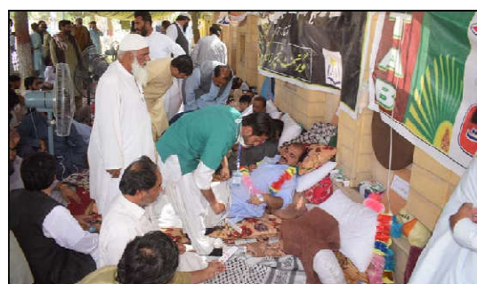
QUETTA: Medical staff giving medical aid to teachers in hunger strike camp by Government Teachers Association in front of Balochistan Assembly

Earlier prime minister also chaired a important meeting of Pmln.