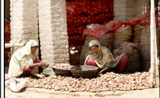
MULTAN: Women are busy sorting good quality onions at the vegetable Market.

ISLAMABAD (INP): Finance Minister Ishaq Dar Sunday said 35 per cent increase in the ad-hoc relief allowance for federal government employees in grades 1-16 was a massive relief given for the salaried class during budget 2023-24. Similarly, employees in grades 17-22 will receive a 30 per cent raise in their ad-hoc relief allowance, said Dar while talking to a private news channel, adding the government has made extensive efforts to provide maximum relief to the masses. To a question he criticized the previous government of Pakistan Tehreek-e-Insaf (PTI) for formulating weak policies. He stated that these policies had caused significant difficulties for