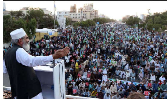
KARACHI: Jamate-Islami (JI) Chief, Siraj-ul-Haq addresses to his supporters during protest demonstration against stolen of party mandate in mayoral elections, at Shahrah-e-Quaideen in Karachi.

It may be mentioned here that the Chief Minister has announced ban on making inauguration of the development projects by provincial ministers, members of provincial assembly and other government functionaries in the province.