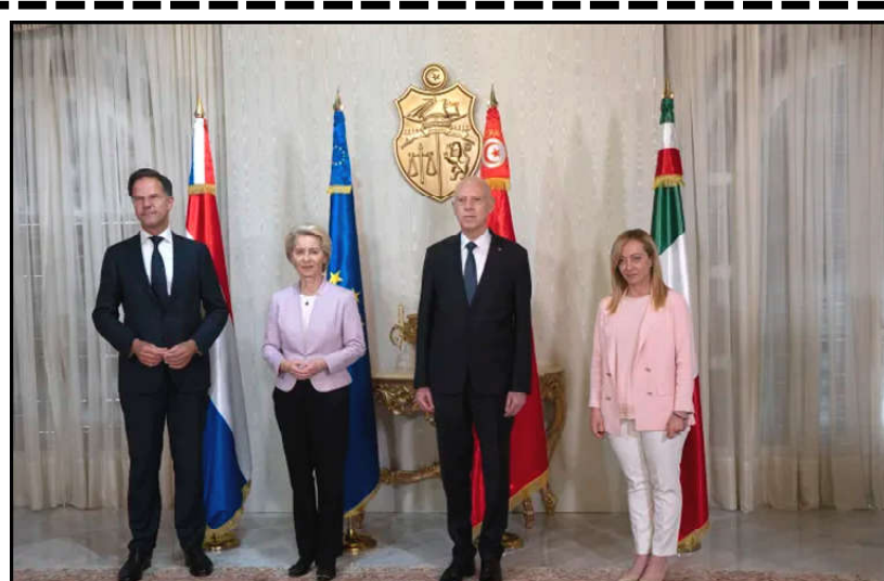
Dutch Prime Minister Mark Rutte, European Commission President Ursula von der Leyen, Tunisian President Kais Saied, and Italian Premier Giorgia Meloni meet in Tunis.

On the eve of the talks, Saied made an unannounced visit to a migrant camp in the coastal city of Sfax, a central jumping-off point for boat journeys crossing the Mediterranean to Italy. Saied spoke with families living in the camp, and pleaded for international aid for Africans who converge on Tunisia as a transit point to reach Europe. His caring words, and sympathetic images posted on the president's Facebook page, contrasted sharply with Saied's stance earlier this year, when he stoked racist abuse of Black African migrants in