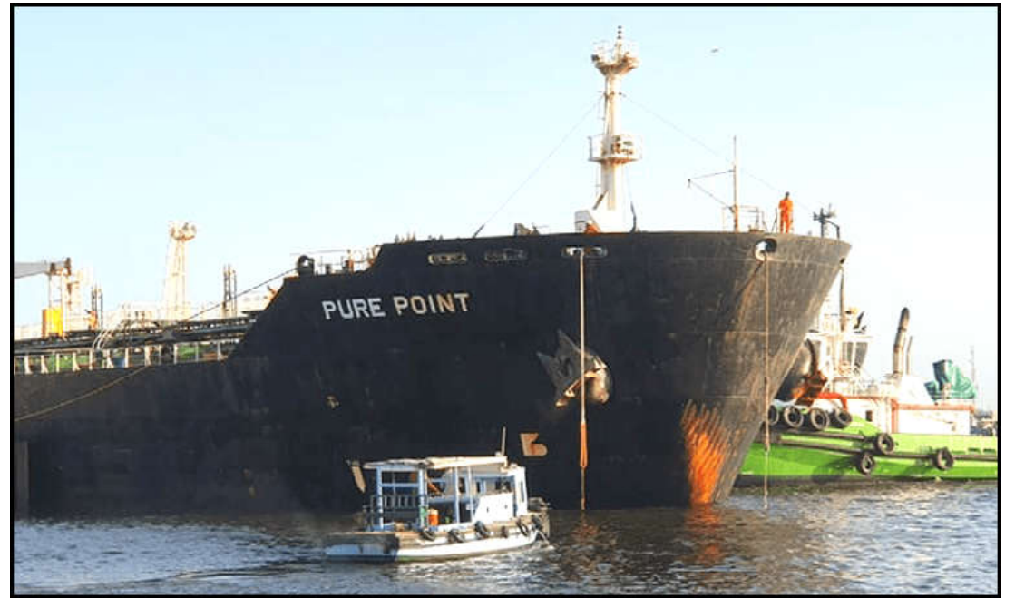
A Cargo ship carrying crude oil from Russia arrived at Karachi Port

waves could be above 8-10 feet due to the Biparjoy cyclone, therefore, the fishermen have been directed to go in the open sea. Meanwhile, the meeting reviewed the arrangements in view of the cyclone. A control room was also established immediately to monitor the heavy rains and storm all over the district. The officers of concerned departments have also been put on high alert to take precautionary measures ahead of the cyclone in the port city. Meanwhile, the process of shifting of the fishermen boats was also started under the arrangements of Gwadar Port Authority (GPA). Started on directives of Chairman GPA Pasand Khan Buledi, the boats are being shifted from sea and coast area to the fish harbor free of coast. The Chairman GPA said that the heavy machinery and operation staff is taking part in the rescue operation.