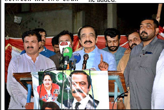
FAISALABAD: Interior Minister Rana Sana Ullah Khan addressing to public gathering after inaugurating railway gate on Chack No. 79 JB Abbas Puri Road.

ISLAMABAD (APP): Prime Minister Muhammad Shehbaz Sharif on Sunday said that the enhanced bilateral cooperation between Pakistan and Turkiye through joint investment and ventures would prove 'a win win' situation for the both countries. In an interview with Haber Global, a Turkish TV channel, the prime minister highlighted that a target of bilateral trade to the tune of $5 billion, in the next three years, between the two countries was very much achievable. The prime minister said that the areas of solar and hydro power energy in Pakistan possessed huge potential and the Turkish investors could avail of this opportunity. "I want to assure as Prime Minister of Pakistan to do everything to facilitate Turkish investors. There is great scope between the two countries to make this wonderful journey more successful," he added.