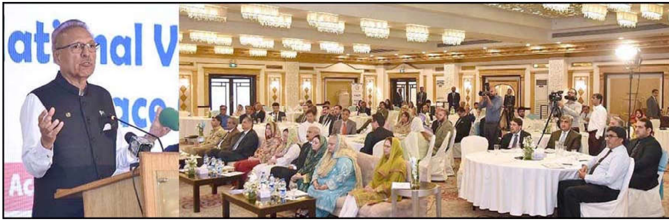
ISLAMABAD: President Dr. Arif Alvi addressing the National Vice Chancellors Peace Conference.