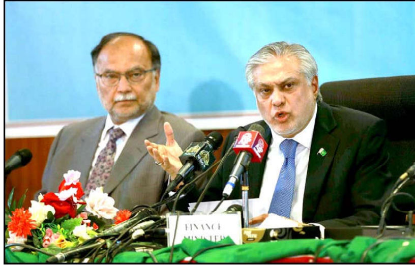
ISLAMABAD: Federal Minister for Finance and Revenue Senator Ishaq Dar presents Economic Survey for fiscal year 2022-23 during a press conference.

Ph: 2841470/2841473 Vol: XVI No. 33, Zee'qad 19, 1444 AH Friday June 09, 2023, Pages 08, Price Rs.15