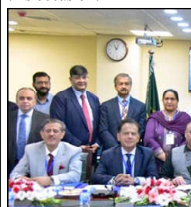
ISLAMABAD: Federal Minister for Health Abdul Qadir Patel and USAID Deputy Administrator Isabel Coleman with Pakistan and U.S officials participating in Pak-U.S Health Dialogue.

In their efforts towards ensuring the inclusion of the rights of persons with disabilities in Balochistan, the provincial