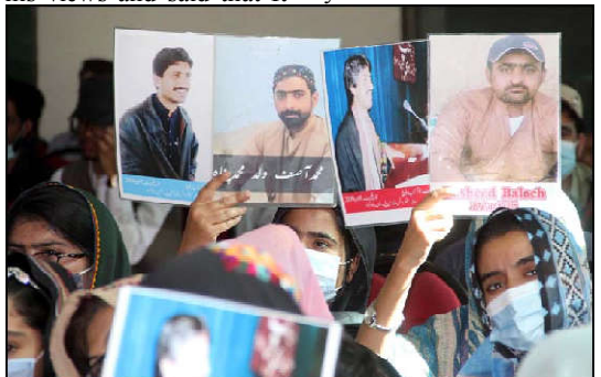
QUETTA: Relatives of missing persons are holding pictures of victims during a seminar.

The Local Government Act 2010 of Balochistan was an important step towards improving local governance in the province. However, with the passage of time further reforms were needed to improve the functioning of the system.