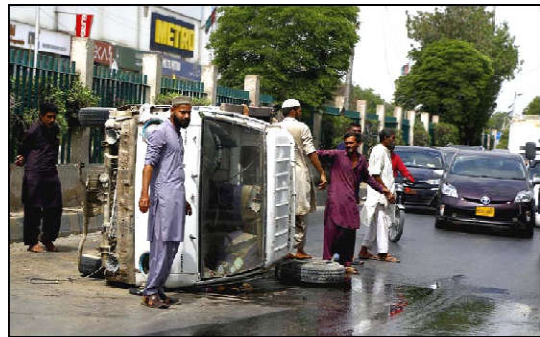
KARACHI: View of venue after traffic accident due to over speeding and break failure, while people busy in rescue work, located on Shahrah-e-Faisal road in Karachi.

According to a spokesman for SIU, the unit on a tip-off conducted a raid near Eidgah Ground, Nazimabad and arrested the accused identified as Imran, Irshad and Rehmatullah during initial investigations revealed their involvement in a number of street crimes. They also used to rob people coming out of banks with huge cash. The accused also confessed to having snatched two motorcycles from Karimabad and Sachal. The motorcycle snatched from Karimabad on June 3 this year was recovered from their possession. They revealed committing street crimes in Karimabad, Iqbal Market, Mominabad, Metroville, Sachal, Korangi, Shah Latif, SITE-A, Pakistan Bazar and Pirabad areas.