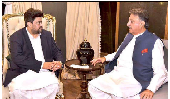
KARACHI: Governor Sindh Kamran Tessori exchanging views with Governor Balochistan Malik Abdul Wali Khan Kakar at Governor House.

He said the step would ensure the reformation of students to help them contribute towards the country's better future, sustainable peace and prosperity.