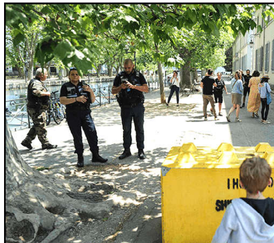
French police personnel maintain a secure cordon in Anancy, south-eastern France, following a mass stabbing in the French Alpine town.

No further details were available about the cause of the accident.