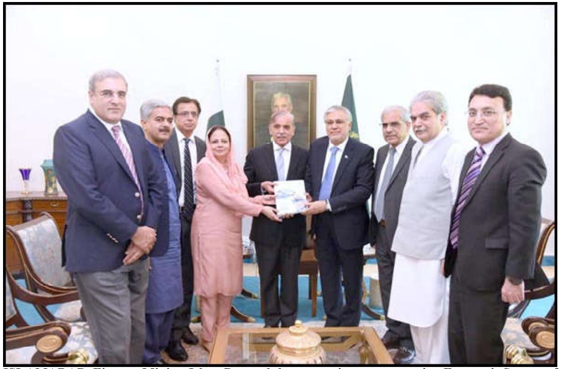
ISLAMABAD: Finance Minister Ishaq Dar and the economic team presenting Economic Survey of Pakistan for FY-2022-23 to Prime Minister Muhammad Shehbaz Sharif.

"The assistance will tackle the growing challenges of food insecurity, malnutrition, and disease outbreak prevention." Moreover, she said the funding would empower humanitarian partners to deliver nutritious meals to mothers and children, aid in the reconstruction of local infrastructure to mitigate future disasters and expand.