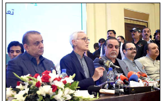
LAHORE: Senior Politician Jahangir Tareen announces new political party named 'Istehkam-e-Pakistan Party' (IPP) during a press conference.

ISLAMABAD (Online): Federal cabinet will meet today (Friday) under the Prime Minister (PM) Shehbaz Sharif to accord approval to the federal budget for the next financial year of 2023-24. The meeting will take place in parliament house. Finance Minister (FM) Ishaq Dar along with his economic team will give detailed briefing in the meeting on the salient features of budget. The final decision about enhancement in pay and pension of government employees will be taken and approval thereof will be accorded in this meeting.