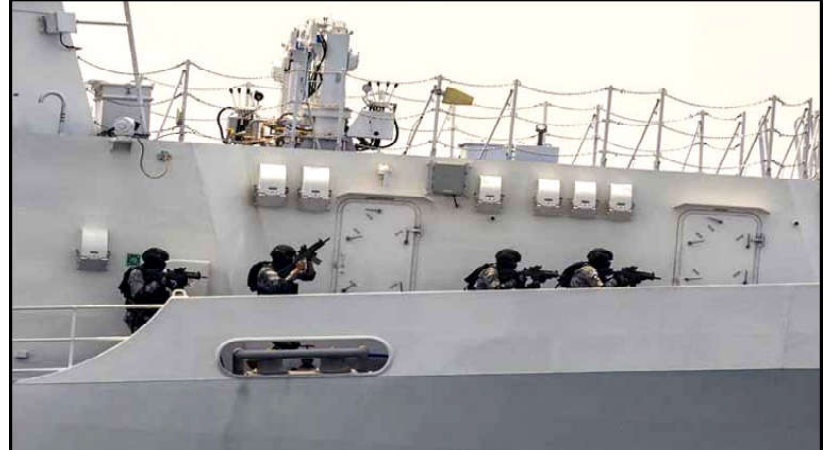
Philippines, Japan, US hold first trilateral coast guard manoeuvres.

which targeted a girls school in the Afghan prov ince of Sare Pol. comes after intense scrutiny of girls' education in the wartorn nation since the Taliban took over and barred most teenage female students.