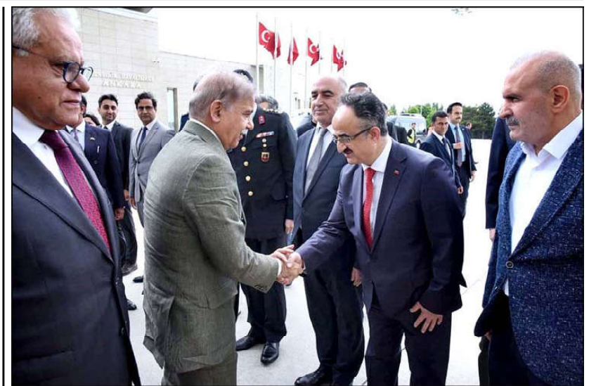
ANKARA: Prime Minister Muhammad Shehbaz Sharif departs from Ankara after completing his two day official visit of Turkiye.

Meanwhile, the Minister also thanked the Chinese government for donating 9,000 food packages for the flood affected people of Balochistan.