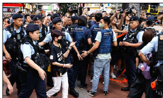
Police detain a person in downtown on the 34th anniversary of the 1989 Beijing's Tiananmen Square crackdown, near where the candlelight vigil is usually held, in Hong Kong, China.

Dagalo. For weeks, Saudi Arabia and the United States have been mediating between the warring parties. On May 21, both countries successfully brokered a temporary cease-fire agreement to help with the delivery of much-needed humanitarian aid to the war-torn country. Their efforts, however, were dealt a blow when the military announced on Wednesday it would no longer participate in the cease-fire talks.