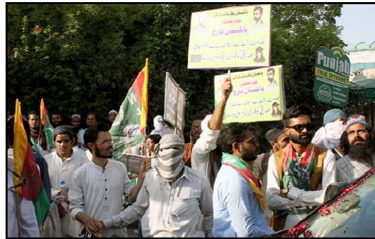
LAHORE: Members of Pakistan Nazriyati Party are holding protest demonstration against detention of Dr. Aafia Siddiqui by US authorities, at Lahore press club.