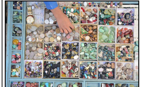
RAWALPINDI: A man is busy in selecting and purchasing gemstone and rings from roadside vendor in the city.

During the meeting, representatives of MFA highlighted the growth of Sharia compliant mutual funds and proposed that short term Sharia compliant sukuk should be launched.