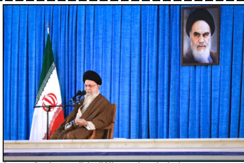
Supreme Leader Ayatollah Ali Khamenei speaks during a ceremony commemorating the death anniversary of the late revolutionary founder Ayatollah Khomeini at his mausoleum just outside Tehran, Iran.

In a video on the Freedom of Russia's Telegram channel, a man identifying himself as the commander of the Russian Volunteer Corps said he would hand over two soldiers they were holding captive in exchange for a meeting with the governor.