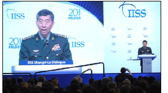
Chinese Defence Minister Li Shangfu speaks at the IISS Shangri-La Dialogue in Singapore.

cord that restricted it. Trump restored crippling sanctions on Iran that have contributed to a severe economic crisis without forcing any concessions from its leaders. Iran has also lent support to Russia's invasion of Ukraine, supplying armed drones that have wreaked havoc on the Ukrainian capital, Kyiv. "Some people are mistaken to think if we back down from our stances in certain cases that will cause the enmity of the U.S., the global arrogance, or Israel toward us to diminish," said Khamenei, who has the final say on all major Iranian policies. "This is a mistake."