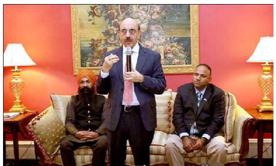
WASHINGTON: Ambassador Masood Khan addressing faith and community leaders at Pakistan House.

"Pakistan is committed to protecting the rights of minorities and providing them with an enabling environment to contribute towards socio-economic development and nation-building process."