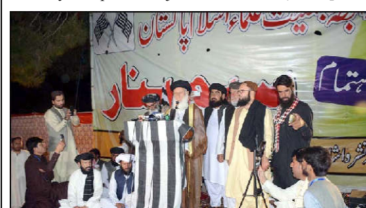
QUETTA: Eminent Leader Maulana Muhammad Khan Sherani addressing the participants of seminar.

She said that the people of PTI are getting hated because politics is a form of reverence but the kind of politics that PTI is doing seems to be more of a systematic conspiracy to spread disorder and chaos in the country than politics.