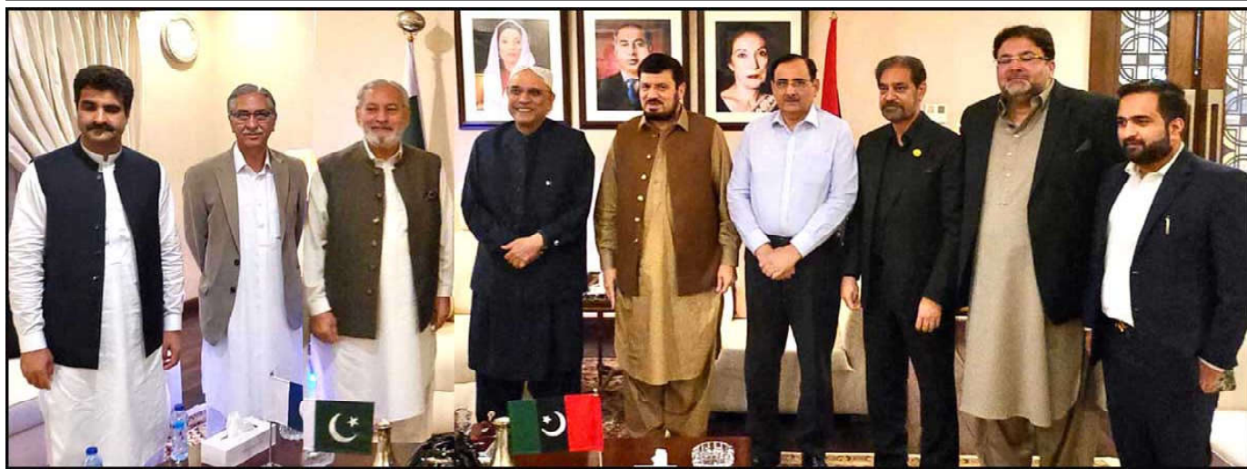
LAHORE: Pakistan People Party co-chairman and former president Asif Ali Zardari in a group photo with Khyber Pakhtunkhwa Governor Haji Ghulam Ali along with Caretaker Provincial Ministers during meeting.