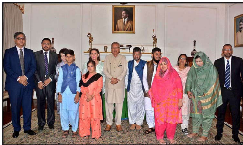
KARACHI: President Dr. Arif Alvi and Begum Samina Arif Alvi posing for a group photo with delegation of Association of Retarded Children Karachi and special children at Governor House.