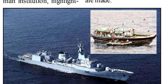
KARACHI: Pakistan Navy Ship SAIF conducts rescue operation and safely recover stranded crew of fishing vessel in Arabian Sea, in Karachi.

Governor Balochistan stated that the institution of Ombudsman operates independently, receiving complaints and initiating investigative actions. The responsible officers and representatives of relevant institutions are called for questioning regarding the complaints, and after a thorough process, decisions based on justice and the law are made.