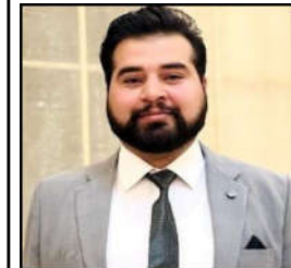
By Hamza Shahzad

Balochistan has confronted the security challenges over the years. Balochistan has struggled with security challenges posed by terrorism, insurgency, and religious violence. These disastrous incidents have had a damaging effect on the province's reputation and stalled its tourism potential. The unstable security condition in the past has discouraged tourists and damaged the province's image, leading to a weakening in tourism opportunities.