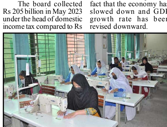
SARGODHA: Student attends classes during Skill Summer Camp 2023 at Government College of Technology for Women.

131 billion in May 2022, thereby showing a growth of 57%. A healthy year-on-year growth of 28% was achieved in the domestic sales tax with collection of almost Rs 100 billion. Around Rs 41 billion were collected as Federal Excise Duty (FED) showing a year-on-year increase of 32%. A cumulative growth of almost 44% has been achieved in the collection of domestic taxes. "This is despite the fact that the economy has slowed down and GDP growth rate has been revised downward.