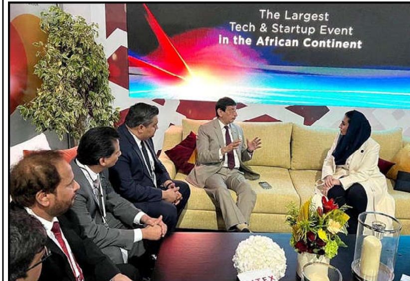
MOROCCO: Federal Minister for IT and Telecommunication Syed Amin Ul Haque in a meeting with Secretary General Digital Cooperation Organization (DCO) Ms. Deemah Al-Yahya on the Sidelines of GITEK Africa Digital Summit.