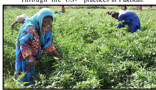
HYDERABAD: Farmers are engaged in harvesting peas in the field.

ISLAMABAD (APP): Pakistani rupee gained 08 paisas against the US Dollar (USD) in the interbank trading on Thursday as it closed at Rs285.38 against the previous day's closing of Rs285.46. However, according to the Forex Association of Pakistan (FAP), the buying and selling rates of dollars in the open market stood at Rs 290 and Rs 293, respectively. The price of the Euro increased by 19 paisas to close at Rs 304.67 against the last day's closing of Rs304.48, according to the State Bank of Pakistan (SBP).