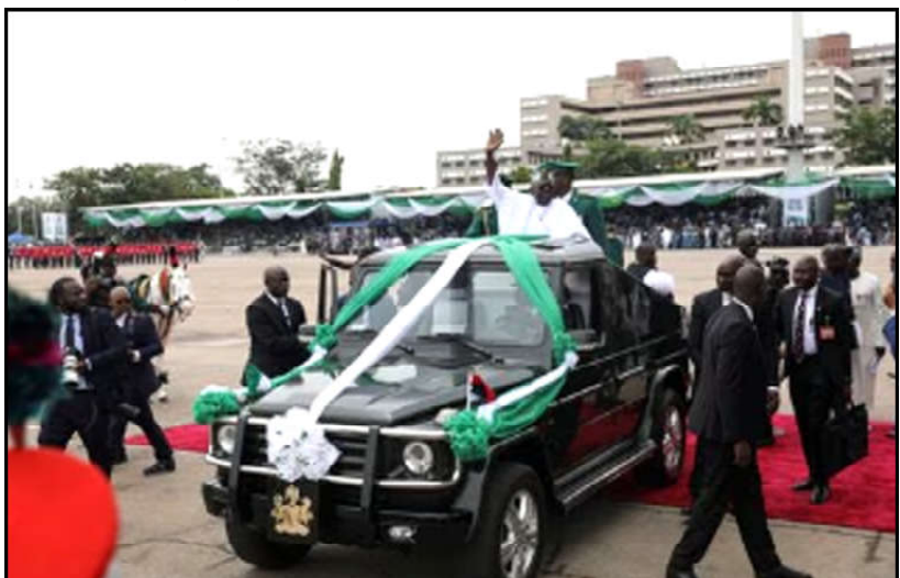
Nigeria's President Bola Tinubu waves to the crowd as he takes a traditional drive on top of a ceremonial vehicle after his swearing-in ceremony in Abuja, Nigeria.

While Kyiv has staunch backing from the West in its struggle against the Kremlin, it has not won the same support from the Global South - a term denoting Latin America, Africa and much of Asia - where Russia has invested diplomatic energy for years.