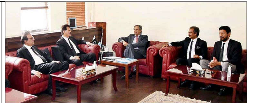
ISLAMABAD: A delegation of Lawyers from Islamabad Bar Council called on Federal Minister for Law and Justice, Senator Azam Nazir Tarar.

ISLAMABAD (APP): The Islamabad Capital Territory (ICT) administration sealed 11 shops, arrested 10, and imposed fine amount 10,500 on shopkeepers involved in profiteering. According to the ICT spokesperson, the operation was carried out on the directives of Deputy Commissioner (DC) Irfan Nawaz Memon with the assistant commissioners (ACs) conducting raids in their respective areas to combat price increases, encroachment, hygiene issues, and professional beggars. During the operation, the ACs carried out inspections at 158 places and imposed a fine of Rs 10,500 for price gouging, and sealed 11 shops. Some 10 shopkeepers were also arrested and subsequently taken to the local police station while FIR against one shopkeeper was also registered. Furthermore, 15 professional beggars were apprehended and handed over to the police for further legal action.