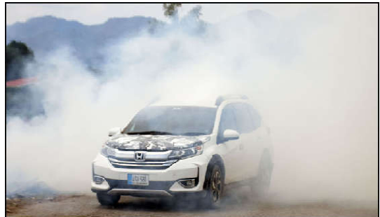
ISLAMABAD: Motorists are facing trouble due to rising smoke from garbage dump at Bani Gala area as the usual events of fire in garbage causing environmental pollution in Federal Capital, which needs the strict action of Concern authorities.

Meanwhile, the Motorway Police found two children near Chakri Interchange. The children aged about 8 and 9 years respectively, could not satisfactorily answer when questioned. The children were transferred to Chakri camp. During investigation, it was found that they were studying in a seminary in Islamabad and belonged to Karachi. But the children could not provide the address or contact number of their family and the seminary. In this situation, the children who had run away from the seminary were safely handed over to the Child Protection Bureau Rawalpindi.