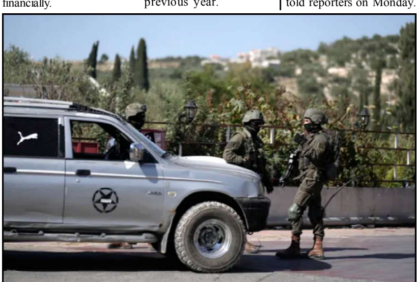
Israeli soldiers search in the West Bank village of Qafin for the suspected gunmen who shot and killed an Israeli civilian near the entrance to a Jewish settlement of Hermesh.

The attack on December 10, 1941, happened three days after Japan attacked the US fleet in Pearl Harbor, Hawaii.