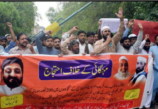
PESHAWAR: Members of All Class Four Government Employees Association are holding protest demonstration for acceptance of their demands, at Peshawar press club.