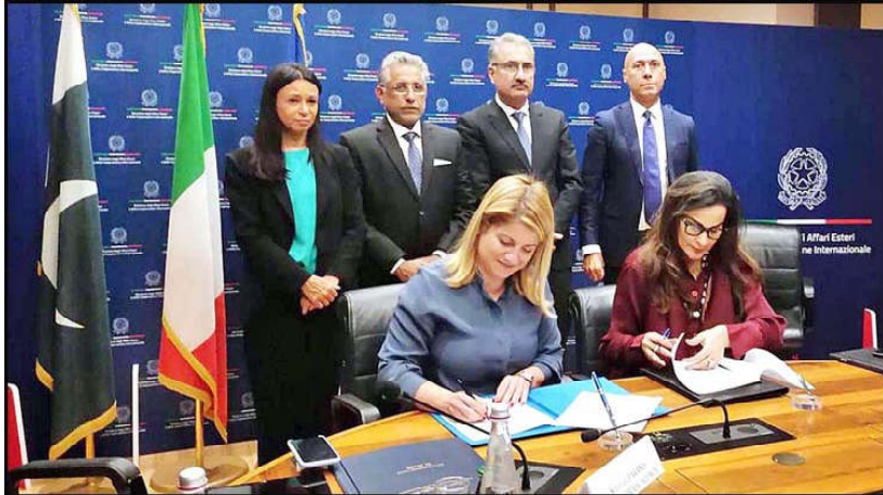
ITALY: Federal Minister for Climate Change Senator Sherry Rehman and Italy's Deputy Minister for Foreign Affairs and International Cooperation Maria Tripodi signing an important "Roadmap for Cooperation" covering climate change, trade and investment, heritage, culture, agriculture, higher education, technical cooperation and technology transfer in reference areas.

by the UN in building peace, ensuring security and development across the world could not be done by any other institution. She said over 4,300 Pakistani peacekeepers, including female officers, were currently serving with distinction under the UN flag. Spokesperson Ministry of Foreign Affairs Ambassador Muntaz Zahra Baloch said the event was jointly organized by the ministry and the United Nations Development Programme (UNDP). Resident Representative UNDP Pakistan Knut Ostby informed the audience that currently over 87,000 peacekeepers from across the world were deployed under the UN peacekeeping missions to ensure global peace and development.