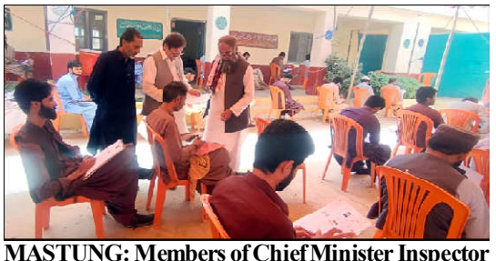
MASTUNG: Members of Chief Minister Inspector Team inspecting test held for recruitment of teachers

end to the negative portrayal and terrorism that has plagued the province for a long time. Even in the future, such initiatives and collaborations are essential to ensure progress and prosperity in our beloved province." Sources told Online Jahangir Tareen is playing active role in carving out new political party and he has made contacts with former members of assembly from PTI. Consultation was made on future political strategy. They have contacted with all former parliamentarians of PTI and soon show of power will be made. The consultation is underway on the name of new political party. Sources told Online Jahangir Tareen is playing active role in carving out new political party and he has made contacts with former members of assembly from PTI. Consultation was made on future political strategy.