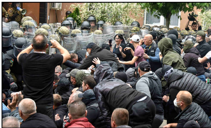
Local Kosovo Serb protesters sit on the ground in front of NATO Kosovo Force (KFOR) soldiers in the town of Zvečan.

NATO said in a statement it would send additional forces to Kosovo to curb the violence, adding it "has directed the deployment of the Operational Reserve Forces (ORF) for