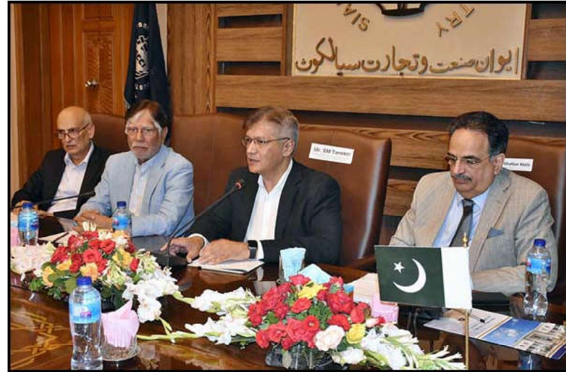
SIALKOT: SM Tanveer caretaker Provincial Minister for Industry, commerce and energy is addressing to the meeting of members of Sialkot Chamber of Commerce and Industry.