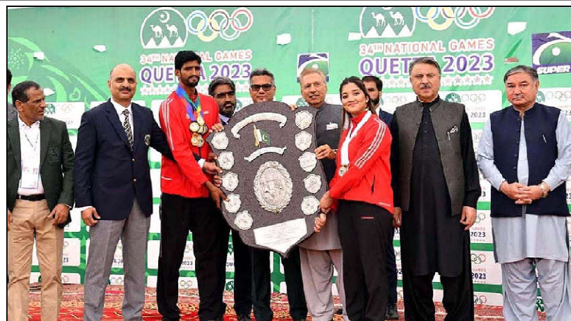
QUETTA: President Dr. Arif Alvi giving the winner's trophy to the Pakistan Army team, at the closing ceremony of the 34th National Games.

MUZAFFARABAD (APP): Four people including technical experts and labourers died and three workers sustained injuries after the under-construction Bailey Bridge slipped and fell while being placed on the pillars with the help of heavy machinery in Dhani area of Naserabad tehsil in Muzaffarabad district. According to police, the Bailey Bridge was being constructed to connect Dhani and Ghendi areas in the lower Neelam valley when it slipped and fell while being placed on the pillars.