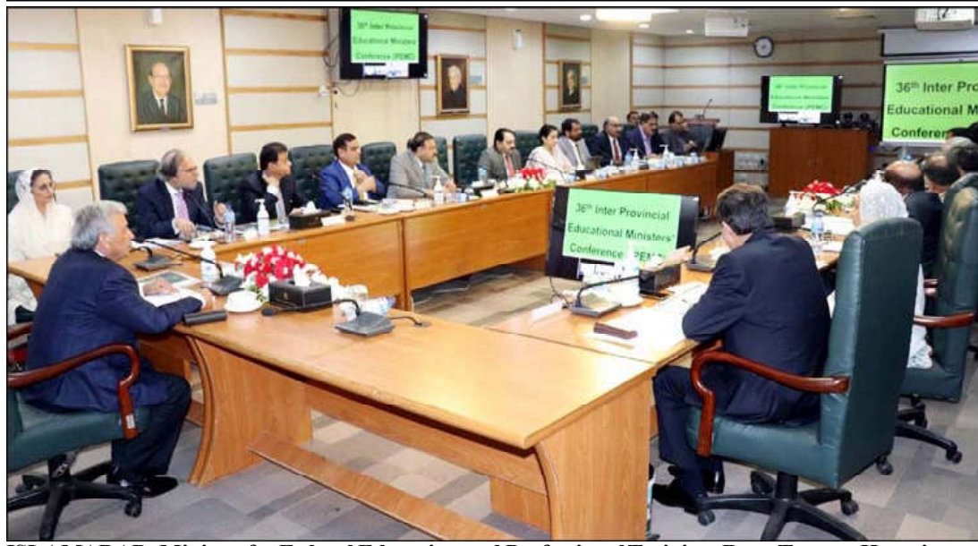
ISLAMABAD: Minister for Federal Education and Professional Training, Rana Tanveer Hussain presided over the 36th Inter-Provincial Education Ministers Conference (IPEMC) held in Islamabad.