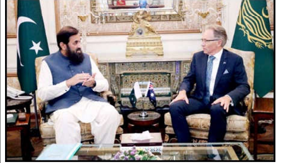
LAHORE: Australian High Commissioner to Pakistan, Neil Hawkins, called on Governor Punjab Muhammad Balighur Rehman at Governor House.

SUKKUR (APP): Sindh High Court (SHC) Sukkur bench on Tuesday ordered the immediate construction of the Sukkur-Hyderabad Motorway. National Highway Authority (NHA) assured that the construction work on the road will begin on June 30. The double bench of the SHC heard the petition against the non-commencement of the construction work on the Sukkur-Hyderabad Motorway. During the hearing, NHA officials told the court that the government and donors have provided funds for the construction of the motorway. However, the investigation of the Noshehofero corruption case has stalled the project. NHA assured the court that the construction would be started by June 30.