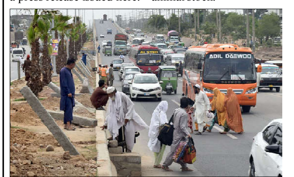
ISLAMABAD: Passengers are facing trouble in crossing the busiest IJP Road due to an availability of over head pedestrian bridge, which needs the attention of concern authorities.

These two organizations would assist in the disbursement of funds to the communities under this scheme in a transparent manner. This program is designed to assist the severely flood-affected communities to enable them to earn a livelihood by engaging semi-skilled and unskilled labour for the rehabilitation of urgent basic services including clean water supply, sanitation, water course improvement, land cape-restorations, road construction well as its maintenance. It will also cover the provision of emergency support to smallholder livestock farmers' stores to their animal stock.