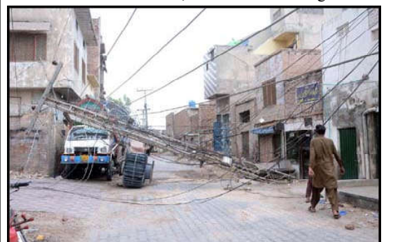
MULTAN: The unattended electric pole that fell two days ago at the Old Vegetable Market in Hassan Parwana Colony poses a potential accident hazard, demanding immediate attention from the relevant authorities.