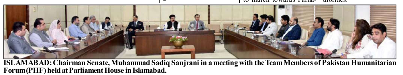
ISLAMABAD: Chairman Senate, Muhammad Sadiq Sanjrani in a meeting with the Team Members of Pakistan Humanitarian Forum (PHF) held at Parliament House in Islamabad.