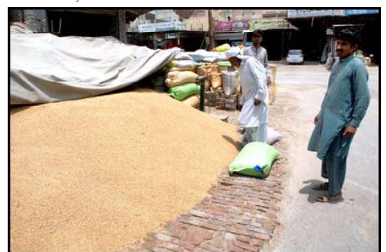
BAHAWALPUR: Customers are buying wheat from a roadside vendor at Grain Market.