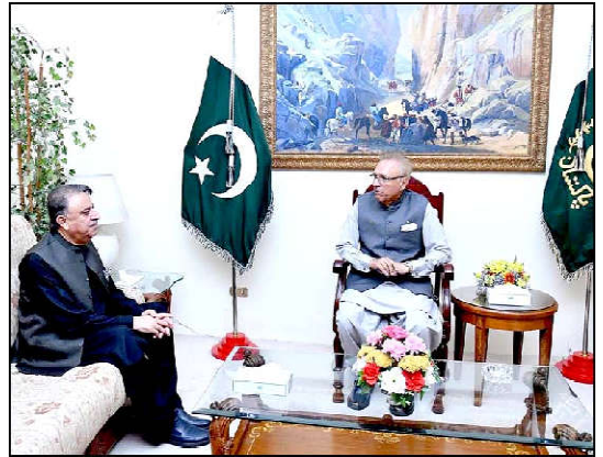
QUETTA: President Dr. Arif Alvi in a meeting with the Governor of Balochistan, Malik Abdul Wali Kakar at Governor House.

The prime minister emphasized that such people should rather be held to account for their militant actions. He also termed it a prevalent practice even in developed democracies. Meanwhile Prime Minister Shehbaz Sharif on Continued on page 2