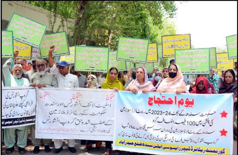
HYDERABAD: Members of Government Retired Teachers Association Sindh are holding protest demonstration for increase of pension, at Hyderabad press club.