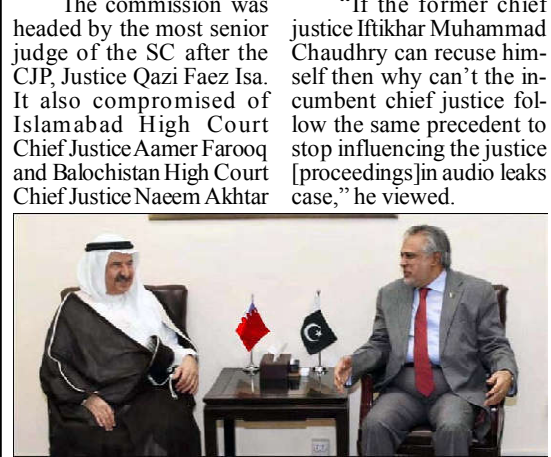
ISLAMABAD: H.E. Sheikh Ebrahim Bin Khalifa Al Khalifa, Chairman Board of Trustees AAOFI called on Federal Minister for Finance and Revenue Senator Mohammad Ishaq Dar.