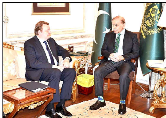
LAHORE: Foreign Minister of Belarus Sergei Aleinik calls on the Prime Minister Muhammad Shehbaz Sharif.