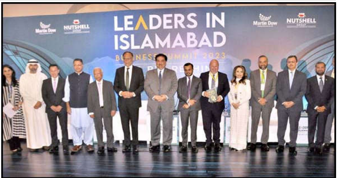
ISLAMABAD: Group photo of Federal Minister for Planning & Development Ahsan Iqbal along with Federal Minister for Energy Khurram Dastagir Khan during the 2-days conference "Leaders in Islamabad Business Summit 2023".

He recalled that there was an economic boom during the PML-N's last tenure, adding in 2017, the ambassadors of developed countries including America, Britain, Japan, Germany and France were showing keen interest to invest in the Special Economic Zones (SEZs), under the CPEC.