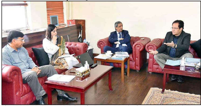
ISLAMABAD: Federal Minister for Law and Justice Senator Azam Nazir Tarar chaired a meeting of the cabinet subcommittee to recommend mechanism to engage foreign law firm of strategy for treaties with investment provisions.

Law Minister Senator Azam Nazeer should come and brief this committee and guide regarding the reference on the violation of the constitution and law.