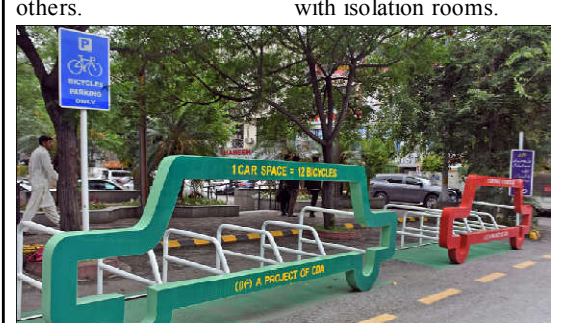
ISLAMABAD: A view of the dedicated cycle parking stand at Super Market as it is a very good initiative by Capital Development Authority (CDA) for the facilitation of the people in Federal Capital.