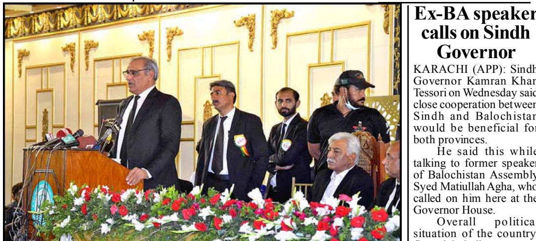
CHINIOT: Chief Justice Lahore High Court Muhammad Ameer Bhaffi addressing to lawyers at local hotel after inauguration of Judicial Complex at the cost of 1750 million consists of 167 kanal at Jhumra Road.

Development Authority (PDA) officials in their briefing about the project said that the two-way Detour Road with a length of three kilometers was completed at a cost of Rs 1.53 billion. It was told in the briefing that the construction of the road would not only facilitate heavy goods vehicles going to Afghanistan, but the road would also be helpful for commercial traffic.