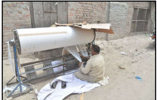
FAISALABAD: A worker busy in his routine work at his workplace outside local factory at Ghulam Muhammad Abad, in City.

The LCCI President emphasized on the importance of reducing the cost of doing business.