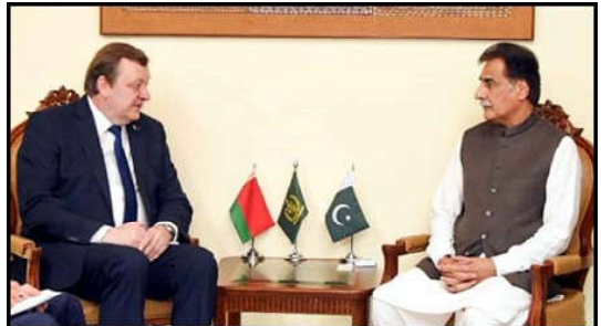
ISLAMABAD: Federal Minister for Economic Affairs, Sardar Ayaz Sadiq exchanging views with Sergei Aleinik, Foreign Minister of Belarus during meeting held in Islamabad.

He said fuel cost adjustment (FCA) remained negative during the last winter and its benefit was also passed on to the consumers.