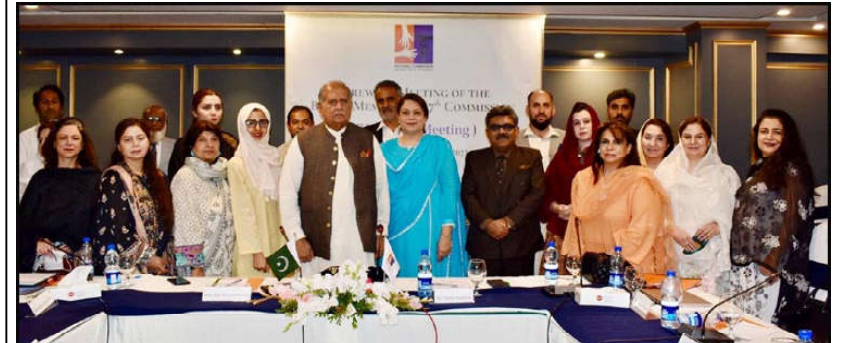
National Commission on the Status of Women held its 74th Board Meeting to bid farewell to its board members of the 7th Commission in Islamabad.

After deliberation on the matter, it was decided that the appointment of transaction advisors, financial advisors and legal advisors in respect of privatization matters should be given a formal shape for the approval of the Federal Cabinet.