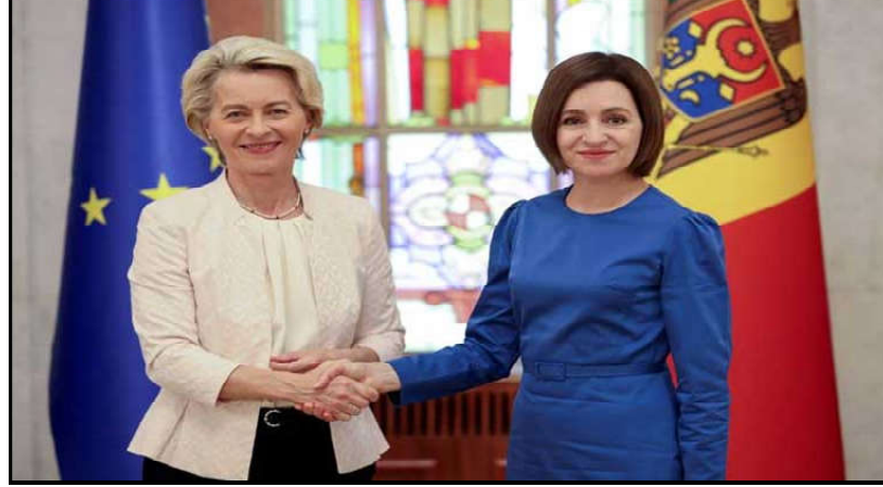
Moldova says Europe summit signals unity in face of Russia's war