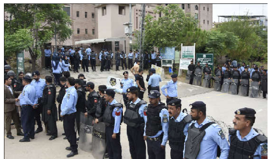
ISLAMABAD: Police personals stands alert outside NAB court during Former Prime Minister Imran Khan and his wife Bushra Bibi hearing at Islamabad High Court in the Federal Capital.