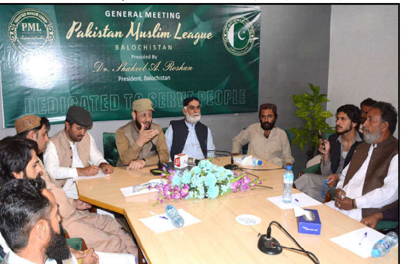
QUETTA: Provincial President of Pakistan Muslim League (N) Dr. Shakeel Ahmad chaired the party session at Party Office in Provincial Capital.

The committee took briefing by the Deputy Governor State Bank of Pakistan on SBP report on banks scam of extra US dollar rates being charged from the customers for the opening of LC's. The Deputy Governor SBP said that State Bank gave a clean chit to the banks after 9 months on the increase in dollar value.