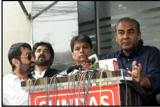
LAHORE: Caretaker Chief Minister Punjab Mohsin Naqvi talk to media after visiting Thalassaemia center at Shadman.