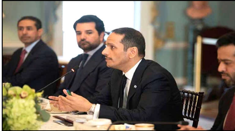
Qatar prime minister, Taliban chief hold secret Afghan talks.

Monitoring Desk VIENNA: The U.N. nuclear watchdog has re-installed some monitoring equipment originally put in place under the 2015 nuclear deal with major powers that Iran then ordered removed last year, the watchdog said in two reports on Wednesday seen by Reuters. The added monitoring equipment included surveillance cameras at a site in Isfahan where centrifuge parts are produced as well as monitoring equipment at two declared enrichment facilities, the confidential reports to member states said.