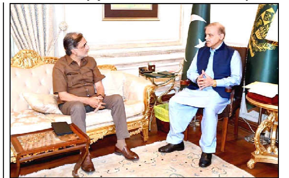
LAHORE: Advisor to PM for Kashmir and Gilgit Baltistan Affairs, Qamar uz Zaman Kaira calls on Prime Minister Muhammad Shehbaz Sharif.

He also blamed Imran Khan and other PTI leaders for brainwashing youth in a bid to create chaos and unrest in the country.