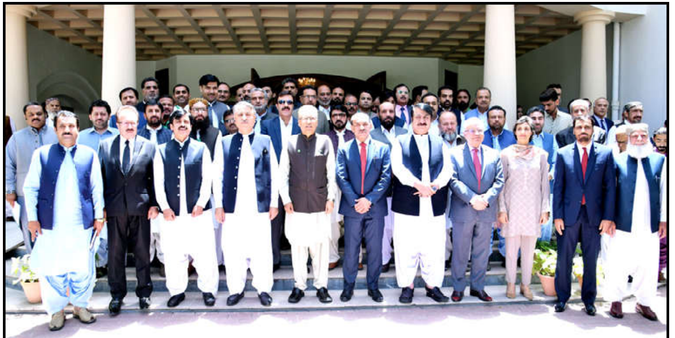
QUETTA: President Dr. Arif Alvi and Governor Balochistan Malik Abdul Wali Khan Kakar in a group photo with participants of seminar

The completion of the main runway upgrade at Quetta International Airport marks a significant milestone in enhancing the airport's capabilities. The successful landing of the first flight signifies the improved infrastructure and services available for air travel in Quetta. This development is expected to further facilitate connectivity and contribute to the growth of trade and tourism in the region.