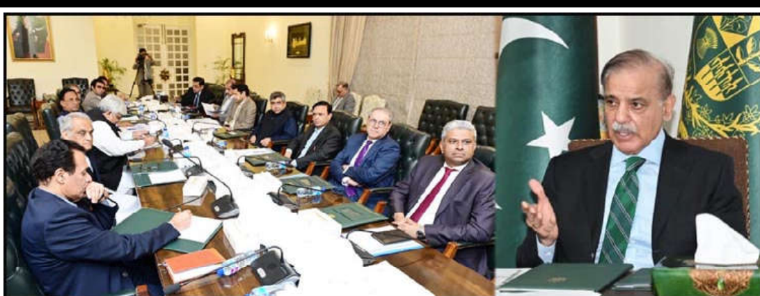
Prime Minister Muhammad Shehbaz Sharif chairs a meeting on budget 2023-24 proposals regarding the Agriculture sector in Lahore

said that this organization had advocated protection of rights of Muslims and non-Muslims alike to create a harmonious society. The Ambassador said that all Muslims living in United States should be thankful to rich ambiance and integrative environment provided by its people which assimilates people of all faiths and diverse ethnic backgrounds. He all Muslims living in United States should be thankful to rich ambiance and integrative environment provided by its people which assimilates people of all faiths and diverse ethnic backgrounds.