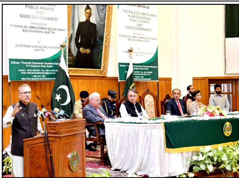
QUETTA: - President Dr. Arif Alvi addressing a seminar on the role of Ombudsman in safeguarding public rights and good governance, at Governor House

About May 9 incident, Imran Khan said the fire broke out at four and five places. The places like corps commander house and radio Pakistan were included in them. Cameras will be therein. Safe city cameras are therein. Every thing will become known. This inquiry is very simple.