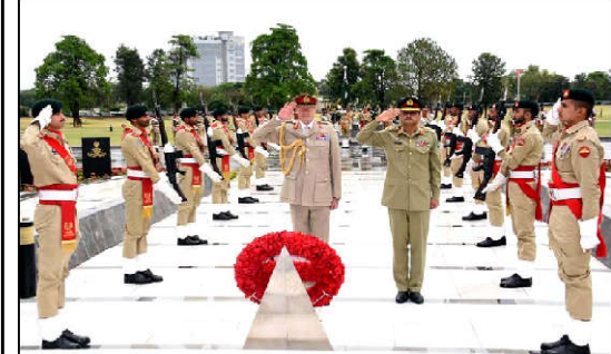
RAWALPINDI: Chief of General Staff (CGS) UK Army, General Sir Patrick Nicholas Yardley Monrad Sanders laid floral wreath at Yadgar-e-Shuhada during his visit to General Headquarters (GHQ) in Rawalpindi.

"Discussing bilateral military cooperation in response to climate change-related crises will be a key focus of the visit."