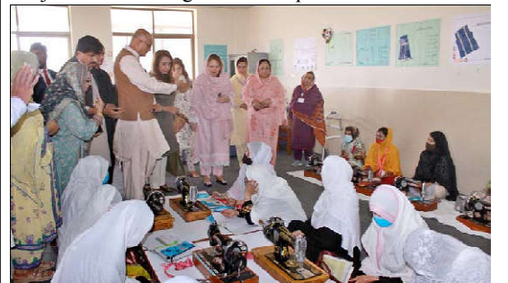
QUETTA: First Lady Samina Alvi visits the Skill Center established by the Social Welfare Department in collaboration with the NAVTTC under the PM Youth Skills Program.

LAHORE (Online): Chief of Naval Staff Admiral Muhammad Amjad Khan Niazi says development of new technology and artificial intelligence requires that traditional war tactics be replaced by innovation. He said this while addressing the 52nd convocation ceremony of Pakistan Navy War College held in Lahore on Wednesday. The Naval Chief was the Chief Guest of the ceremony. Speaking on the occasion, the Naval Chief said that promotion of awareness regarding the maritime sector is a distinction of the Pakistan Navy War College. APP adds: The Convocation ceremony of 52nd Pakistan Navy Staff Course was held here on Wednesday at Pakistan Navy War College (PNWC), where Chief of the Naval Staff Admiral Muhammad Amjad Khan Niazi graced the graduation ceremony as Chief Guest. During the Convocation Ceremony Degrees were conferred upon 95 graduates, comprising 54 officers from Pakistan Navy, Army & Pakistan Air Force and 41 officers from friendly countries including Azerbaijan, Bahrain, Bangladesh, Indonesia, Iraq, Jordan, Malaysia, Myanmar, Nigeria, Oman, Palestine, Saudi Arabia, South Africa, Sri Lanka and Yemen, a Pakistan Navy news release said. While addressing the ceremony, the chief guest highlighted the complexities and wide variety of threats and challenges confronting the world impacting almost all regions. He underlined that wide ranging challenges in 21st century coupled with advancements in disruptive technology, proliferation of weapons.