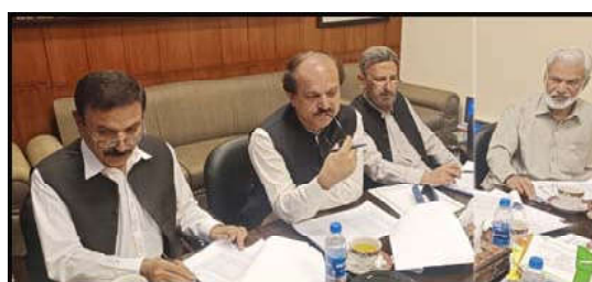
QUETTA: Chief Secretary Balochistan Abdul Aziz Uqaili presiding over meeting of Provincial Selection Board

RAWALPINDI (APP): The security forces on Wednesday killed two terrorists, actively involved in hostile activities against the forces and killing of innocent civilians during an Intelligence Based Operation (IBO), conducted in general area Dossal of South Waziristan District on reported presence of terrorists. According to the Inter Services Public Relations (ISPR), during conduct of the operation, intense fire exchange occurred between security forces and terrorists. Weapons and ammunition were also recovered from the killed terrorists who remained actively involved in terrorist activities against security forces and killing of innocent citizens. The sanitization of the area was being carried out to eliminate any terrorists found in the area. The locals of the area appreciated the operation and expressed their full support to eliminate.