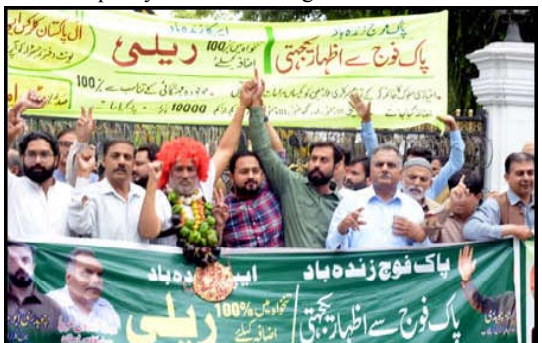
LAHORE: Members of All Pakistan Clerks Association (APCA) are holding protest demonstration against massive unemployment, increasing price of daily use products and inflation price hiking, outside Secretariat in Lahore.