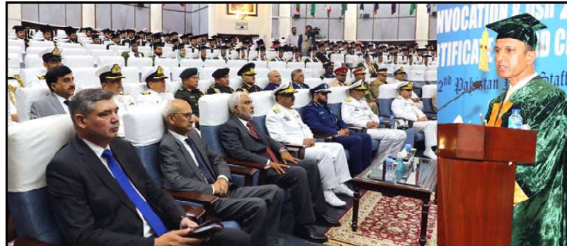
LAHORE: Chief of the Naval Staff, Admiral Muhammad Amjad Khan Niazi addresses the audience during 52nd PN Staff Course Convocation Ceremony held at PN War College in Lahore.

The court issued notice to federal government for June 19. The court has sought reply from records audios. Special committee issued notice under what powers. The court has also sought parawise comments.