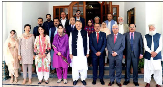
QUETTA: Governor Balochistan Malik Abdul Wali Khan Kakar in a group photo with participants of a seminar on the role of Ombudsman in safeguarding public rights and good governance