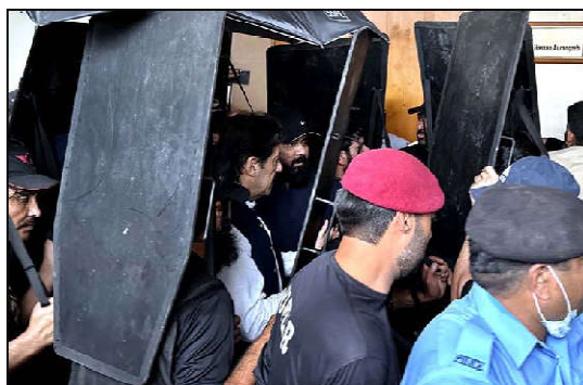
ISLAMABAD: Security personnel with ballistic shields escort former Pakistan's Prime Minister Imran Khan as he leaves from Islamabad High Court.

Officer, Dr. Nazir Ronjha. They praised the District Administration for the excellent results of the polio campaign and achieving 103% vaccine coverage. Deputy Commissioner Hub emphasized that environmental sampling in the routine, including sewage water, is necessary for the polio vaccination campaign along the border areas of Sindh and Balochistan. He stated that there are transit points along the border where migrant populations reside in temporary settlements. As per the WHO protocol, it is essential to assess the polio vaccination campaign in the first instance in these settlements to ensure that no child from any marginalized family is deprived of the polio vaccine.