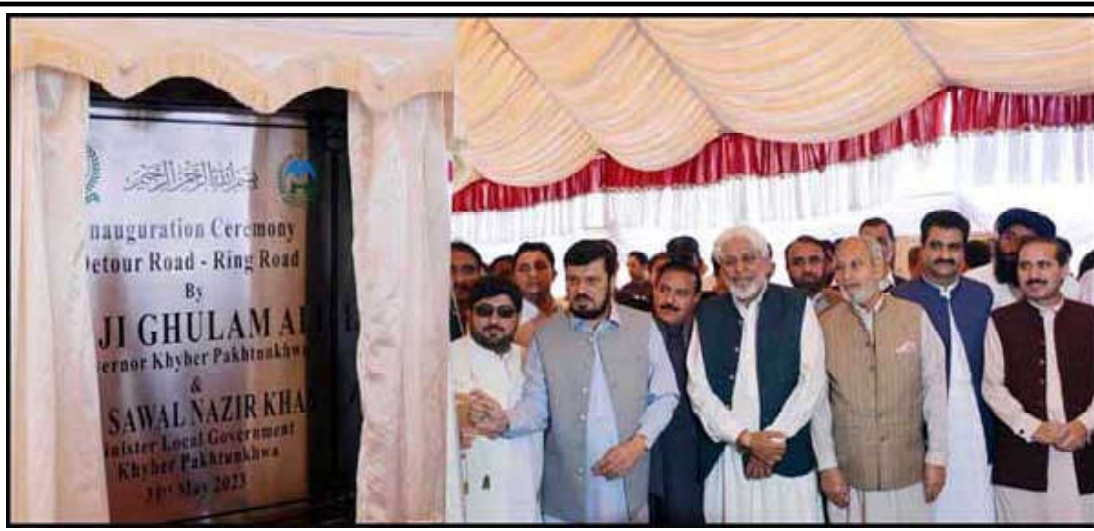
PESHAWAR: Khyber Pakhtunkhwa Governor Haji Ghulam Ali along with Provincial Minister Sawal Nazir inaugurate Detour Road Hayatabad, which is being constructed at a total cost of Rs 1.53 billions.