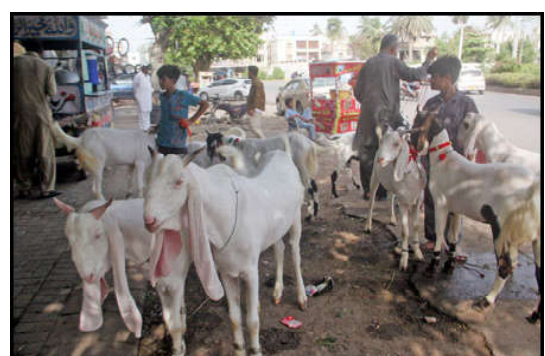
KARACHI: Youngsters gather surround the goats at Peoples Churangi as such scene will be seen common for the upcoming Eid-ul-Adha in Provincial Capital.