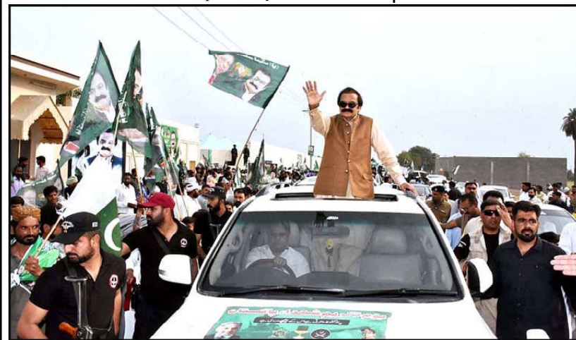
FAISALABAD: Federal Interior Minister Rana Sana Ullah Khan is leading a public rally taken out from his public secretariat on the eve of Youm-e-Takbeer.

ISLAMABAD (Online): A strong earthquake of 6.0 magnitude jolted parts of Pakistan, confirmed the National Seismic Monitoring Centre (NSMC) on Sunday, with no loss of life so far. The tremors were felt across Rawalpindi, Islamabad, Attock and parts of Khyber Pakhtunkhwa and Kashmir, prompting people to rush out of their homes and high-rise buildings in panic. The seismic waves spread to Punjab's Lahore, Jhelum and Chakwal as well. As per the US Geological Survey, the quake's magnitude was 5.2. However, NSMC confirmed it was 6.0. Details reveal that earthquake occurred at 10:50am and the epicentre of the earthquake was located in the border region between Afghanistan and Tajikistan. Meanwhile, the depth of the quake was 223km deep, which is why it was felt in several countries including Pakistan, China, Afghanistan and India.