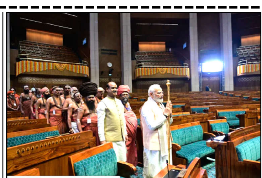
Indian prime minister Narendra Modi carries a royal golden sceptre to be installed it near the chair of the speaker during the start of the inaugural ceremony of the new parliament building, in New Delhi, India.