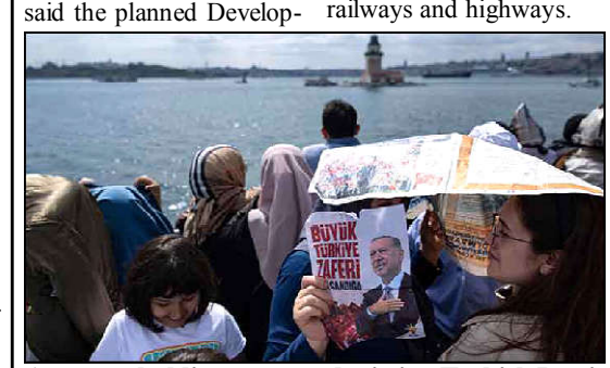
A woman holding a poster depicting Turkish President Recep Tayyip Erdogan waits in the queue at the Maiden's Tower, in Istanbul.

ment Road project would facilitate the movement of goods from the Gulf to Europe by way of the Grand Faw Port in Basra, in southern Iraq, which would be connected to Turkey, then to Europe, through a network of railways and highways. A centerpiece of the project will be the development of the Grand Faw Port and a "smart industrial city" adjacent to it, al-Sudani said.