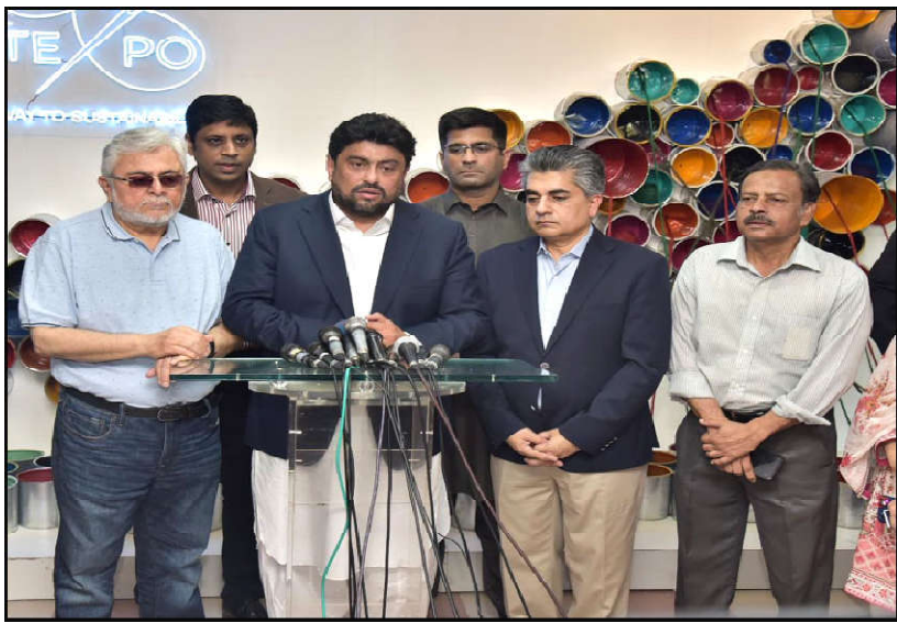
KARACHI: Governor Sindh, Kamran Tessori talking to media persons during the Textile Expo (TEXPO) 2023 held at Expo Centre in Karachi.

ISLAMABAD (Online): The nation is fervently celebrating 25th anniversary of Pakistan's nuclear tests conducted on May 28, 1998 which was a historic day that led to achievement of invincible defence capabilities and ensured regional stability through power equilibrium. The day brought a revival for the entire Pakistani nation and became a moment of pride for the Muslim Ummah. The day, now remembered as Youm-e-Takbeer is being celebrated every year across the country as a day of national pride and thanksgivings which made Pakistan the seventh nuclear nation of the world and the first Muslim state, having the nuclear arsenal in its defence stockpile to exercise maximum deterrence for peaceful purposes. The tests not only demonstrated the resolve of the Pakistani nation to safeguard Pakistan's territorial integrity, independence and sovereignty, but also the desire to preserve strategic balance in South Asia. The historic statement of former Prime Minister Zulfikar Ali Bhutto that they would starve but transform the country into a nuclear power, led to achievement of this milestone. On that day, the Pakistani leadership, notwithstanding external pressures and Indian hegemonic designs to tilt power balance through its nuclear tests, opted courageously in 1998 to respond, and restored the power balance in South Asia by conducting nuclear tests.