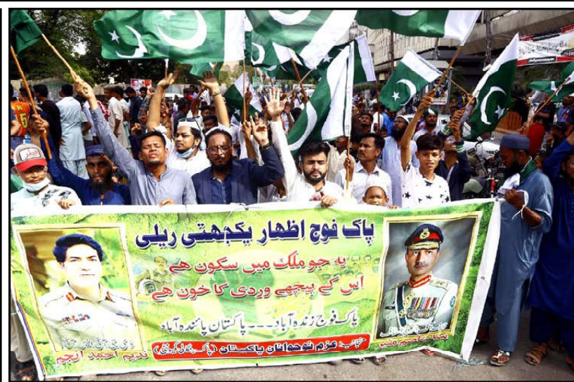
KARACHI: Members of Pak Bangali Community are holding rally in support of Pakistan Armed Forces, at Karachi press club.

leader who initiated the nuclear programme, adding in a show of bold leadership, his leader Mian Nawaz Sharif firmly rejected the policy of stick and carrot and made sure that the country became nuclear. "All along, our armed forces remained a guardian & protector of the programme in the face of malign intentions of our enemies," he said. RAWALPINDI (APP): The armed forces on Sunday paid rich tribute to the brilliant minds who conceived and achieved credible minimum nuclear deterrence accomplishment under daunting challenges.