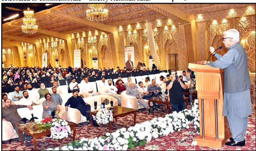
SIALKOT: Defence Minister Khawaja Muhammad Asif addressing the 9th Convocation of Shadab Girls College.

KARACHI (INP): Pakistan Navy (PN) and Anti-Narcotics Force (ANF) seized a huge quantity of narcotics in Counter Narcotics Operation. Pakistan Navy troops and ANF personnel in a joint Intelligence Based Counter Narcotics Operation in the North Arabian Sea seized approximately 4,020 Kgs of narcotics (Hashish) worth approximately US$ 65.148 Million in the international market, a Pakistan Navy news release said. The successful counter-narcotics operation by Pakistan Navy reaffirms Pakistan Navy's resolve to deny illegal activities at sea as well as along the coast.