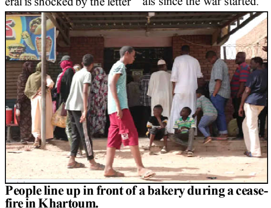
People line up in front of a bakery during a cease-fire in Khartoum.

he received from General Al-Burhan," currently at war with his former deputy Mohamed Hamdan Daglo, who commands RSF. Neither the army nor the UN released official copies of Burhan's letter, which reportedly requested the dismissal of Perthes as Guterres' envoy to Sudan.