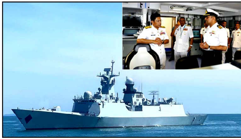
Chief of Royal Malaysian Navy being briefed onboard PNS SHAHJAHAN by Commanding Officer PNS SHAHJAHAN during PNS SHAHJAHAN visit Port Langkawi, Malaysia.