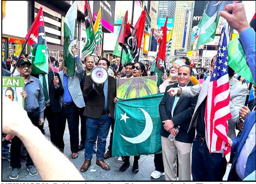
NEW YORK: Pakistani American Diaspora gathering Times Squares to Express Solidarity with Pakistan and Pak Army.

ISLAMABAD (APP): The Pakistani peacekeeping forces were playing an important role in accomplishing the mission of the United Nations. Ever since Pakistan became a part of the United Nations, Pakistani troops serving peacekeeping missions have rendered services with their bravery and responsibility in almost all the wars of the world. The world is celebrating the International Day of UN Peacekeepers on Sunday as it is celebrating 75 years of UN peacekeeping forces working for world peace. Over the past 75 years, United Nations Peacekeepers have saved countless precious lives for global peace and security. This day commemorates the efforts of the United Nations to maintain peace, eliminate human suffering, establish a situation of lasting peace and order in countries armed with wars and internal conflicts reflects global determination.