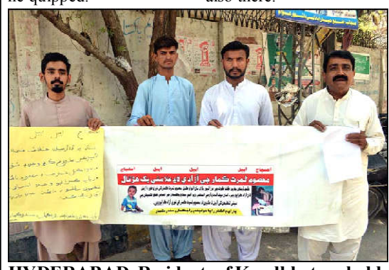
HYDERABAD: Residents of Kandhkot are holding protest demonstration for recovery of missing 3 years old boy, at Hyderabad

LAHORE (APP): Awami Muslim League chief Sheikh Rashid on Sunday warned that the ruling party (PML-N) would reap the harvest tomorrow of what they were sowing currently. In a series of tweets, the former interior minister, who is still standing by PTI Chairman Imran despite many of his own close aides leaving the party after the May 9 episode, remarked that any political party was not a sugar factory and it remained in the masses' hearts. "The [biryani] public meeting in Kasur [held by the PML-N] cannot damage Lal Haveli anyway," he quipped. About the Youm-e-Takbeer celebrated every year on May 28 in connection with the nuclear tests conducted in 1998, Rashid gave credit to Raja Zafarul Haq, Gohar Ayub and himself for the move. He further claimed the rest of the cabinet, including the then prime minister Nawaz Sharif were against the nuclear tests. The former minister said he would live and die in Pakistan but his name had been placed on the exit control list (ECL) while diplomatic passports were issued to the convicted persons living abroad having their assets and children also there.