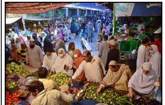
LAHORE: Peoples busy in purchasing vegetables from Wahdat road model Bazar.

There was a time when Pakistan was the second most dependent country on textile with respect to exports after Bangladesh due to high global demand and availability of raw material in abundance but these exports witnessed a prominent decline in recent years. The share of textile exports also declined to 45 percent of the total exports of the country from 65 percent.