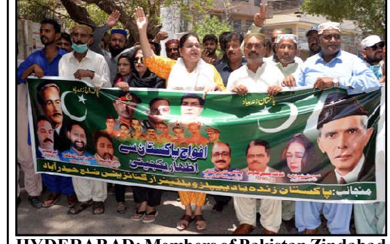
HYDERABAD: Members of Pakistan Zindabad Peoples Welfare Organization are holding rally in support of Pakistan Armed Forces, at Hyderabad press club.

Governor's House, he said that the current caretaker government and the federal government despite economic crisis are sincere to provide relief to the people of the province at newly merged districts in the upcoming annual budget.