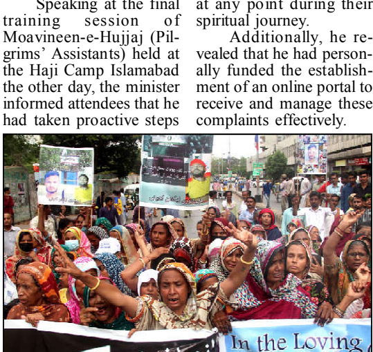
KARACHI: Women are shouting slogans during protest in the favor of their demands outside press club in Provincial Capital.

ISLAMABAD (APP): Minister for Religious Affairs and Interfaith Harmony, Senator Muhammad Talha Mahmood said that he was personally overseeing the entire Hajj operation, ensuring its smooth execution through various channels. Speaking at the final training session of Moavineen-e-Hujjaj (Pilgrims' Assistants) held at the Haji Camp Islamabad the other day, the minister informed attendees that he had taken proactive steps to address any concerns or complaints from the pilgrims. To facilitate efficient communication, Senator Talha had distributed a WhatsApp number to all intending pilgrims, encouraging them to register any complaints they may have at any point during their spiritual journey. Additionally, he revealed that he had personally funded the establishment of an online portal to receive and manage these complaints effectively.