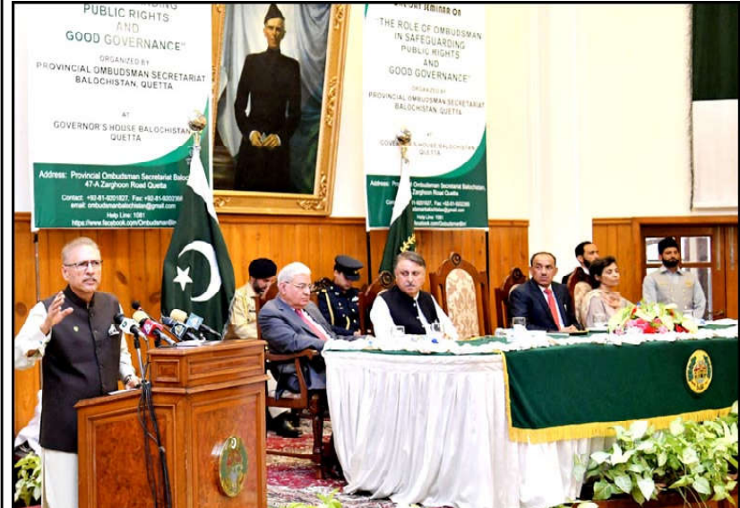
QUETTA: President Dr. Arif Alvi addressing a seminar on the role of Ombudsman in safeguarding public rights and good governance, at Governor House.

FM Bilawal is undertaking this visit on the invitation of the Deputy Prime Minister and Foreign Minister of Iraq, Dr. Fuad Hussein.