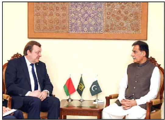
ISLAMABAD: Federal Minister for Economic Affairs, Sardar Ayaz Sadiq exchanging views with Sergei Aleinik, Foreign Minister of Belarus during meeting held in Islamabad.

Following a comprehensive review and assessment of OL submissions and successful completion of criticality & pre-operational tests, PNRA awarded an operating license to K-3.