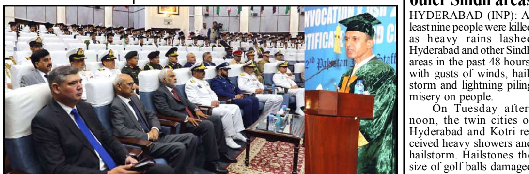
LAHORE: Chief of the Naval Staff, Admiral Muhammad Amjad Khan Niazi addresses the audience during 52nd PN Staff Course Convocation Ceremony held at PN War College in Lahore.

On Tuesday afternoon, the twin cities of Hyderabad and Kotri received heavy showers and hailstorm. Hailstones the size of golf balls damaged several vehicles and windows in Hyderabad's SITE area. Gusty winds uprooted trees and damaged vehicles.