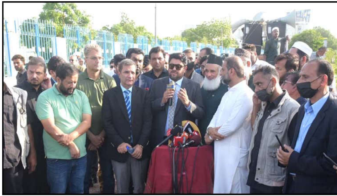
KARACHI: Governor Sindh Kamran Khan Tessori talking to media men

The traditional manner or one-dimensional study of war is accordingly out-dated and is no longer applicable. The admiral appreciated the efforts of Pakistan Navy War College in providing meritorious professional education to students and lauded the endeavour of the College in integrating with local academia for proliferation of maritime knowledge and increasing awareness on maritime security matters.