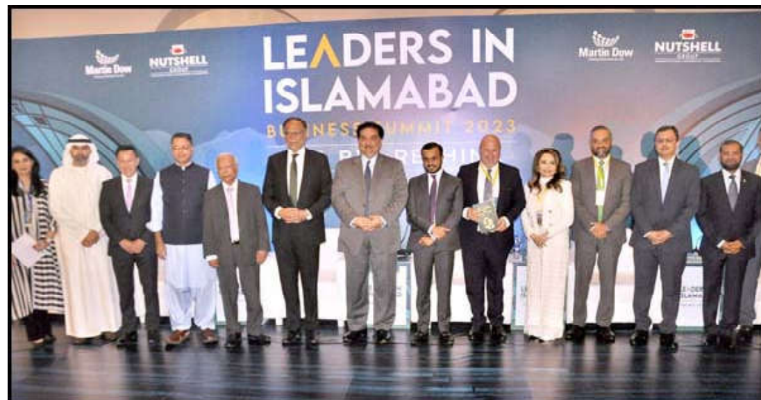
ISLAMABAD: Group photo of Federal Minister for Planning & Development Ahsan Iqbal along with Federal Minister for Energy Khurram Dastagir Khan during the 2-days conference "Leaders in Islamabad Business Summit 2023".

regime that scandalized the CPEC-related projects and stopped the economic boom and foreign investment pouring into the country during the last tenure of the Pakistan Muslim League-Nawaz (PML-N) government. He recalled that there was an economic boom during the PML-N's last tenure, adding in 2017, the ambassadors of developed countries including America, Britain, Japan, Germany and France were showing keen interest to invest in the Special Economic Zones (SEZs), under the CPEC.