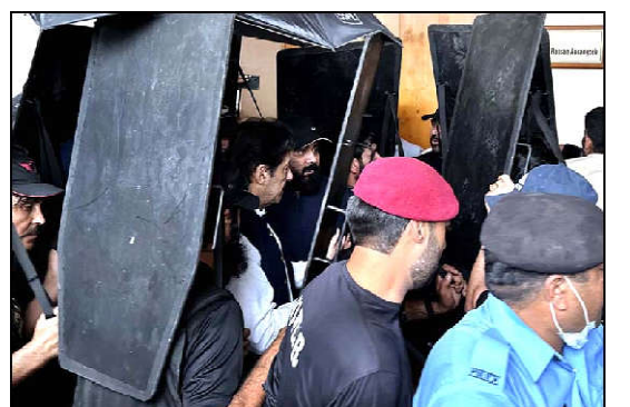
ISLAMABAD: Security personnel with ballistic shields escort former Pakistan's Prime Minister Imran Khan as he leaves from Islamabad High Court.

The price of light-speed diesel has also been reduced by Rs5 per litre, making it available at Rs253 per litre. The government has decided to keep the price of kerosene oil unchanged for the next fortnight. Dar mentioned that despite the depreciation of the Pakistani rupee against the US dollar, the government has provided relief to the people.