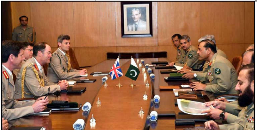
RAWALPINDI: Chief of Army Staff (COAS), General Asim Munir and General Sir Patrick Nicholas Yardley Monrad Sanders, Chief of General Staff (CGS) UK Army held a delegation level talk held at General Headquarters (GHQ) in Rawalpindi.

The sanitization of the area was being carried out to eliminate any terrorists found in the area, ISPR said. "Security forces of Pakistan are determined to eliminate the menace of terrorism and such sacrifices of our brave soldiers further strengthen our resolve," it added.