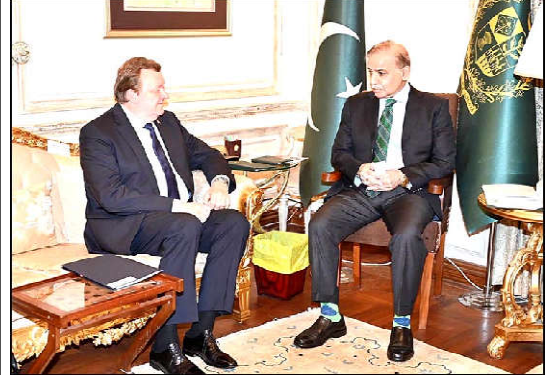
LAHORE: Foreign Minister of Belarus Sergei Aleinik calls on the Prime Minister Muhammad Shehbaz Sharif.

Condemning the May 9 riots, he said that no leniency would be shown against the miscreants and all the lawbreakers would be taken to task as per the law and the Constitution.