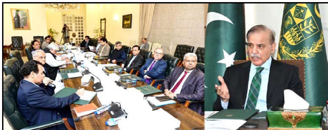
Prime Minister Muhammad Shehbaz Sharif chairs a meeting on budget 2023-24 proposals regarding the Agriculture sector. Lahore

"No nation needs any foreign aid if they truly follow the values and teachings of Islam."