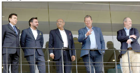
LAHORE: Chairman International Cricket Council (ICC) Greg Barclay visiting the Gaddafi Stadium along with Chairman Pakistan Cricket Board (PCB) Najam Sethi for supervision as ahead of Asia Cup in Provincial Capital.

ISLAMABAD (APP): Minister for Defence Khawaja Muhammad Asif on Tuesday has asked Chief Justice of Pakistan Umar Ata Bandial to "distance himself from hearing the audio leaks case to ensure that true justice is served to the aggrieved." He was referring to a five-member bench order of the apex court, headed by the chief justice, which stayed the proceedings on various petitions challenging the constitution of the judicial commission formed by the federal government, tasked to inquire about the veracity of audio leaks allegedly involving the SC judge and a relative of the top judge.