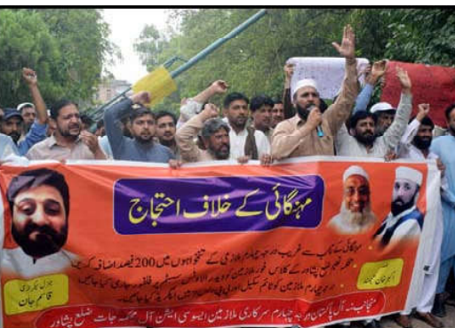
PESHAWAR: Members of All Class Four Government Employees Association are holding protest demonstration for acceptance of their demands, at Peshawar press club.