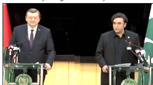
ISLAMABAD: Foreign Minister Bilawal Bhutto Zardari (right) and Belarusian Foreign Minister Sergei Aleinik (left) during a joint press conference.

ISLAMABAD (APP): Foreign Minister Bilawal Bhutto Zardari on Tuesday said Pakistan was committed to further strengthening of high level engagements and bilateral cooperation with Belarus by building stronger economic, trade and investment ties. Addressing a joint presser with visiting Belarusian Foreign Minister Sergei Aleinik, the foreign minister said they held a very fruitful and constructive meeting, and discussed entire areas of cooperation between the two countries. "Our long term goals for Pak-Belarus relations include strengthening of the economic ties, expanding of trade and investment, fostering of scientific collaboration, enhancing of defence cooperation and increasing of the cultural and deepening of the people-to-people contacts," he added. Foreign Minister Bilawal further said that both countries strived to build a mutually beneficial