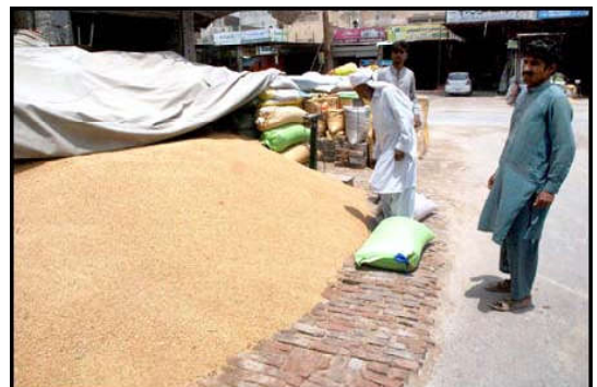
BAHAWALPUR: Customers are buying wheat from a roadside vendor at Grain Market.