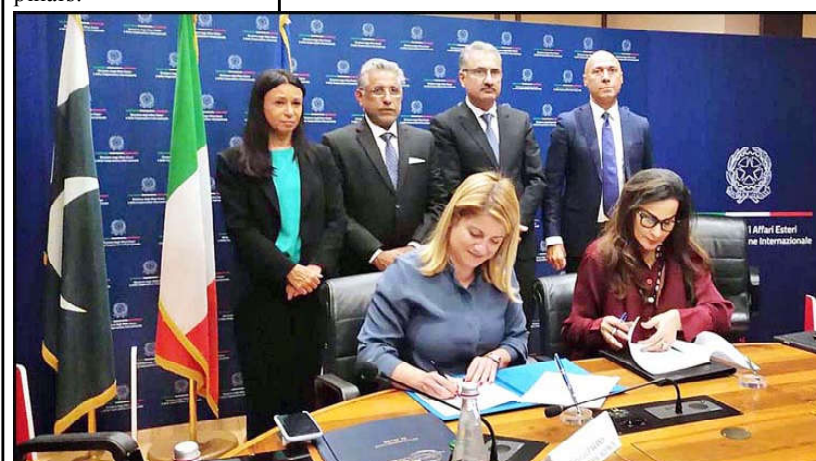
ITALY: Federal Minister for Climate Change Senator Sherry Rehman and Italy's Deputy Minister for Foreign Affairs and International Cooperation Maria Tripodi signing an important 'Roadmap for Cooperation' covering climate change, trade and investment, heritage, culture, agriculture, higher education, technical cooperation and technology transfer in reference areas.

ISLAMABAD (Online): The efforts from Jahangir Tareen and Aleem Khan have entered final phase for formation of new political party. They have contacted with all former parliamentarians of PTI and soon show of power will be made. The consultation is underway on the name of new political party. Sources told Online Jahangir Tareen is playing active role in carving out new political party and he has made contacts with former members of assembly from PTI. Consultation was made on future political strategy. As per sources 20 dissidents from PTI were also contacted. Opposition leader Raja Riaz was assigned the task to arrange early meeting with the dissidents, over 100 PTI former Members of Provincial Assembly (MPAs) have contacted and met with Jahangir Tareen.