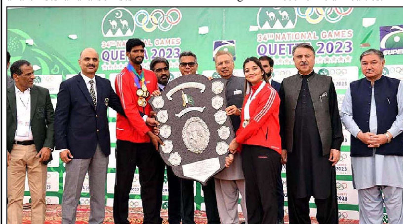
QUETTA: President Dr. Arif Alvi giving the winner's trophy to the Pakistan Army team, at the closing ceremony of the 34th National Games.

spirit of unity, faith and discipline in all walks of life. Mohtarma Fatima Jinnah paid special focus on girls guide to strengthen the organizational discipline, he added. About Balochistan, he said the province was rich with natural and mineral resources and commended all the governments for their efforts to utilize them for the progress and prosperity of the province. The president further stressed that for physical health, regular exercise and other sports activities must be made a part of life as they were vital for healthy living. He also appreciated all the stakeholders for the excellent arrangements and sportsmen for competing in the games. He termed holding of national games in Quetta as 'another feather in province's cap'.