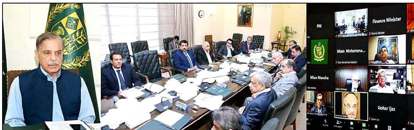
LAHORE: Prime Minister Muhammad Shehbaz Sharif chairs a meeting on budget proposals. Federal Ministers, leading businessmen, exporters and industrialists attended the meeting via video link.

Vol. XIII No. 177 Reg. mails-B / ID-445 Wednesday May 31, 2023, Zee'qad 10, 1444 A.H. Ph: 2158688, 2158997 Pages 4: Rs. 12