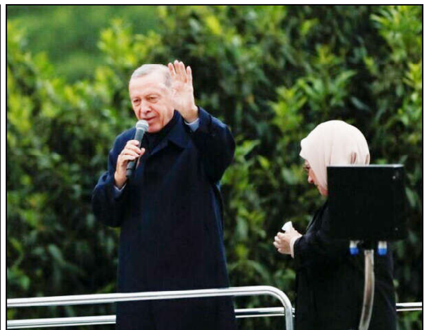
Turkish President Tayyip Erdogan addresses his supporters following early exit poll results for the second round of the presidential election in Istanbul, Turkey

1998, Pakistan demonstrated its nuclear capability by conducting nuclear explosions in response to provocative Indian nuclear tests. The Pakistan Air Force played a crucial role in safeguarding the sovereignty of the nation during this time by transporting the nuclear device and sensitive equipment to the test site through its C-130 aircraft whereas its fighter jets provided aerial cover prior and during the tests. The PAF's fighter aircraft remained on high alert and the pilots were ready to intercept any hostile aircraft that might have threatened Pakistan's sovereignty.