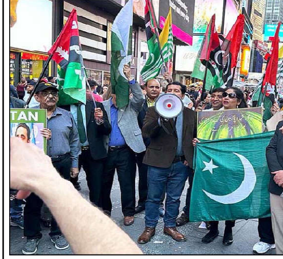
NEW YORK: Pakistani American Diaspora gathering Times Squares to Express Solidarity with Pakistan and Pak Army.

KARACHI (APP): Chairman Pakistan People's Party (PPP) and Foreign Minister Bilawal Bhutto Zardari has extended greetings to the nation on the silver jubilee of the country's nuclear tests and saluted all the people, including scientists, who played their role in making Pakistan the first nuclear nation in the Islamic world. According to the statement issued by media cell Bilawal House, Chairman PPP said that the nuclear programme of the country is indeed a great gift of the Quaid-e-Awam Shaheed Zulfiqar Ali Bhutto to the nation.