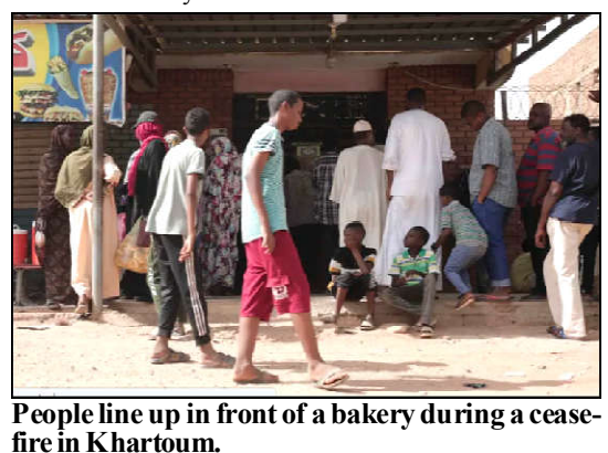
People line up in front of a bakery during a cease-fire in Khartoum.

Monitoring Desk KYIV: President Volodymyr Zelenskyy asked the Ukrainian parliament to impose additional sanctions against Iran for 50 years, according to the draft resolution following the National Security and Defense Council decision. The draft includes a complete ban on trade with Iran, investments, and transferring technologies, as well as stopping Iranian transit across the Ukrainian territory, and preventing the withdrawal of Iranian assets from Ukraine. Ukraine's parliament must approve the bill for it to become law.