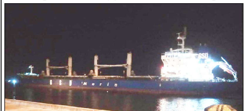
GWADAR: The MV Keno, a maritime vessel from Australia, has anchored at the Gwadar Port, carrying forty thousand metric tons of wheat. This wheat shipment is destined for transit through Afghanistan. Gwadar Port will serve as the gateway for transporting wheat to Afghanistan via road.