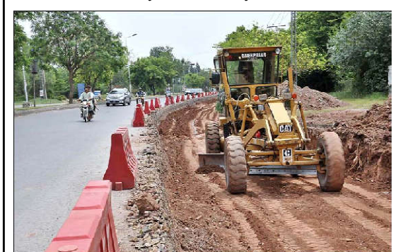
ISLAMABAD: Machinery being used for extension work of Park Road during development work in Federal Capital.

PNS Shahjahan participated in International Fleet Review at Langkawi which was witnessed by Malaysian Prime Minister.