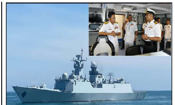
Chief of Royal Malaysian Navy being briefed onboard PNS Shahjahan by Commanding Officer PNS Shahjahan during PNS Shahjahan visit to Port Langkawi, Malaysia.