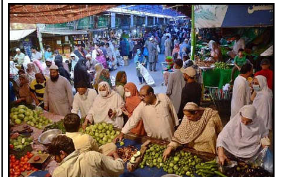
LAHORE: Peoples busy in purchasing vegetables from Wahdat road model Bazar.

There was a time when Pakistan was the second most dependent country on textile with respect to exports after Bangladesh due to high global demand and availability of raw material in abundance but these exports witnessed a prominent decline in recent years. The share of textile exports also declined to 45 percent of the total exports of the country from 65 percent.