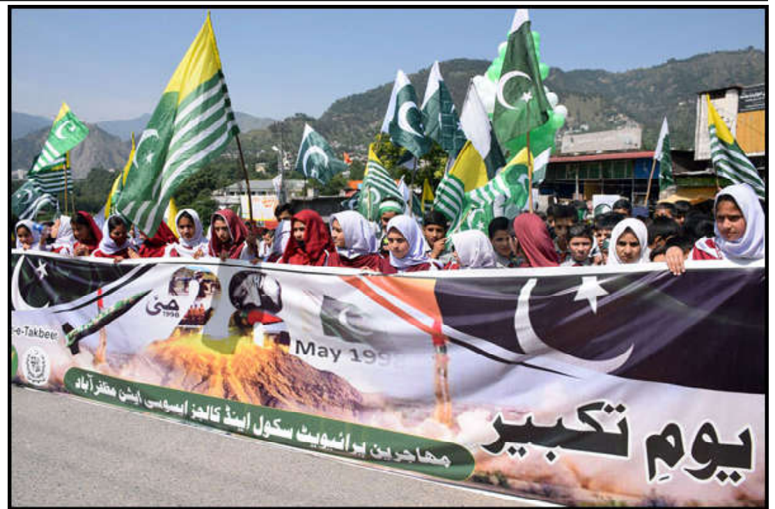
MUZAFFERABAD: Students holding Pakistan and Kashmiri flags are shouting slogans during rally to mark the "Youm-e-Takbeer" in the Capital of Azad Jammu and Kashmir.

The declaration further stressed the need for a thorough investigation into the May 9 events, including identifying and bringing to justice those who supported and masterminded the criminal acts.