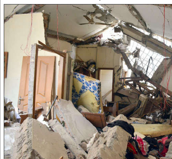
ISLAMABAD: A view of the destroyed house after blast because of Gas leakage at Peoples Colony in City.

Designated officials have been deployed in the kitchen to closely monitor the entire process, from storing the meals to transporting the food in refrigerated units for distribution to pilgrims at their residences is under close scrutiny, he said.