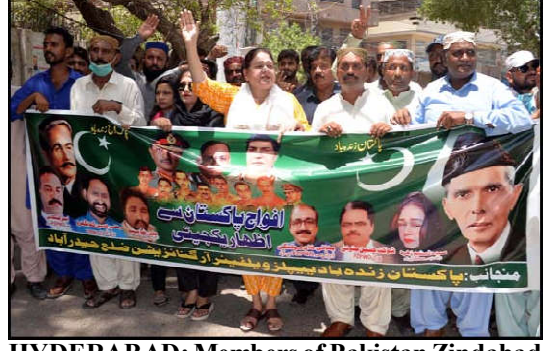
HYDERABAD: Members of Pakistan Zindabad Peoples Welfare Organization are holding rally in support of Pakistan Armed Forces, at Hyderabad press club.

Governor's House, he said that the current caretaker government and the federal government despite economic crisis are sincere to provide relief to the people of the province at newly merged districts in the upcoming annual budget. Meanwhile, a 60-member delegation of the business community comprising presidents and other officials of Waziristan, Bajaur, Dir, Swat chambers of commerce also met with the Governor and discussed various economic, social issues including, tax levies in the newly merged districts and former provincially administered tribal area (Pata).