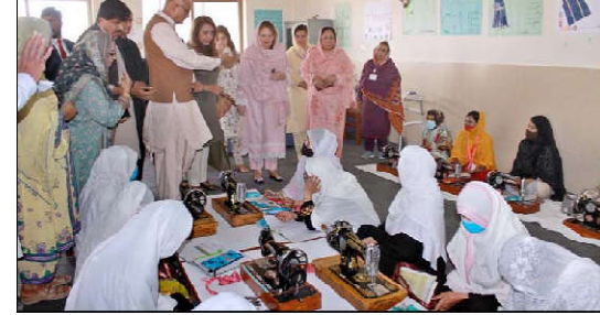
QUETTA: First Lady Samina Alvi visits the Skill Center established by the Social Welfare Department in collaboration with the NAVTTC under the PM Youth Skills Program.