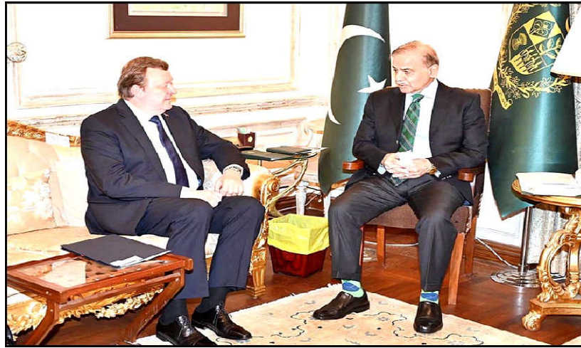
LAHORE: Foreign Minister of Belarus Sergei Aleinik calls on the Prime Minister Muhammad Shehbaz Sharif.