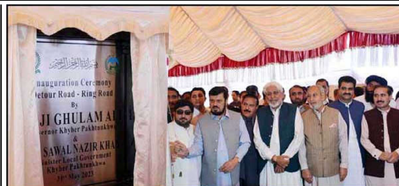
PESHAWAR: Khyber Pakhtunkhwa Governor Haji Ghulam Ali along with Provincial Minister Sawak Nazir inaugurate Detour Road Hayatabad, which is being constructed at a total cost of Rs 1.53 billions.

Development Authority (PDA) officials in their briefing about the project said that the two-way Detour Road with a length of three kilometers was completed at a cost of Rs 1.53 billion. It was told in the briefing that the construction of the road would not only facilitate heavy goods vehicles going to Afghanistan, but the road would also be helpful for commercial traffic.