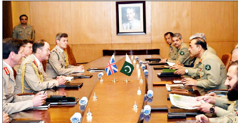
RAWALPINDI: Chief of Army Staff (COAS), General Asim Munir and General Sir Patrick Nicholas Yardley Monrad Sanders, Chief of General Staff (CGS) UK Army held a delegation level talk held at General Headquarters (GHQ) in Rawalpindi.