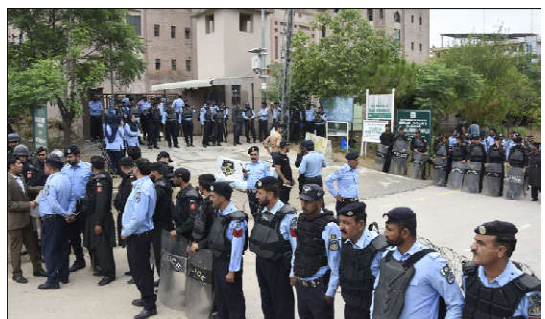
ISLAMABAD: Police personals stands alert outside NAB court during Former Prime Minister Imran Khan and his wife Bushra Bibi hearing at Islamabad High Court in the Federal Capital.

ISLAMABAD (APP): Federal Minister for Power Engr. Khurram Dastgir Khan on Wednesday said that Pakistan Tehreek-e-Insaf (PTI) chief Imran Khan had a terrible history of taking U-turns and quipped him as the champion in this regard. Addressing a news conference here, the minister said the former prime minister was ousted from power through a vote of confidence, adding he (Imran) first accused the U.S. was behind the toppling of his government, but now the PTI chief was purportedly seeking help from the same country. "Imran Khan raised slogans of 'absolutely not' during his regime and now he chants absolutely yes. There is a contradiction in his action, speech and character," he slammed. "Ironically, Imran, who once asserted that the slavery of the USA would not be tolerated, is seeking the US assistance to save his political career," he alleged. "The PTI is attacking Pakistan's integrity with lies since last year, which started with the issue of a cipher, blaming the US for dislodging Imran's government," he added.