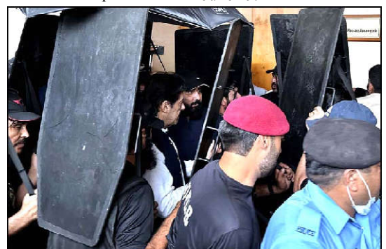
ISLAMABAD: Security personnel with ballistic shields escort former Pakistan's Prime Minister Imran Khan as he leaves from Islamabad High Court.