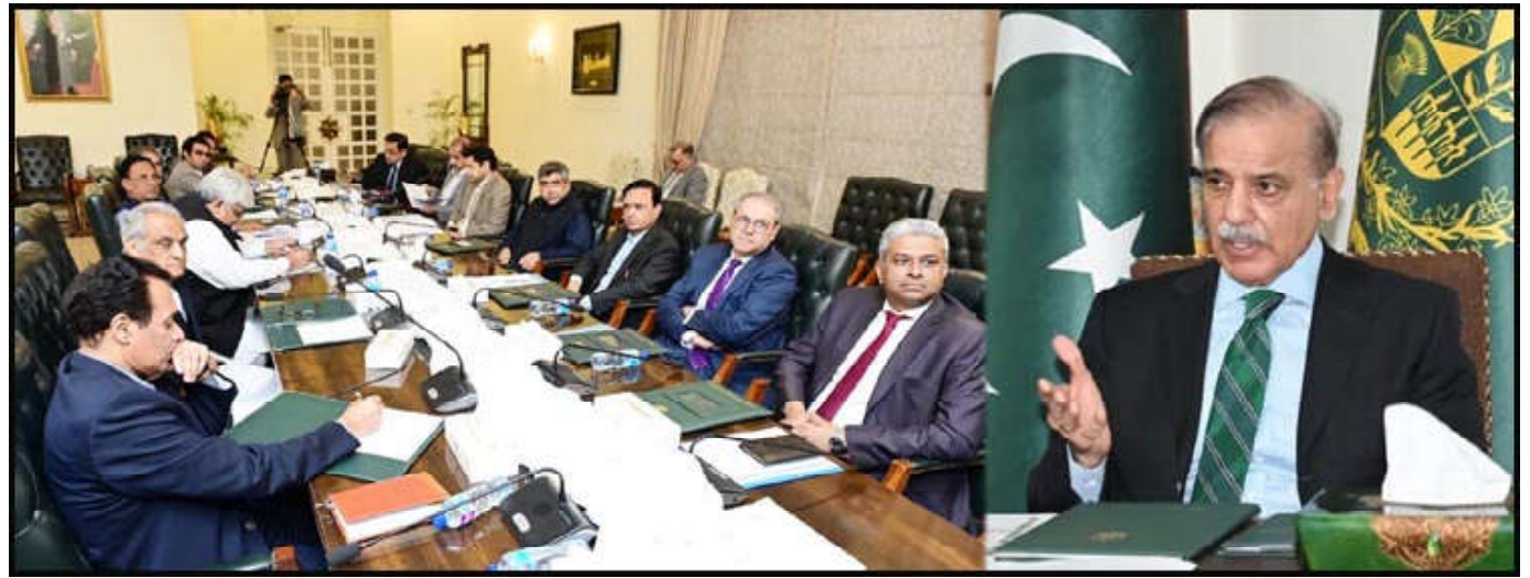
Prime Minister Muhammad Shehbaz Sharif chairs a meeting on budget 2023-24 proposals regarding Agri sector in Lahore.