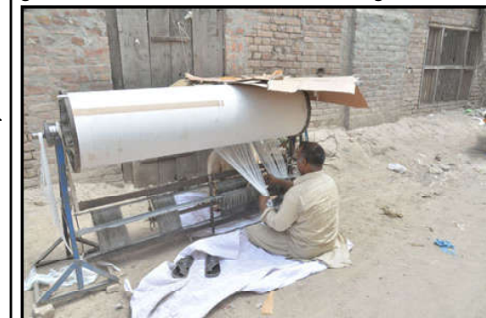
FAISALABAD: A worker busy in his routine work at his workplace outside local factory at Ghulam Muhammad Abad, in City.

KARACHI (APP): Three ships namely, Maersk Atlanta, Maria Elena and Theresa Orion carrying Containers and Palm oil, berthed at Qasim International Container Terminal and Liquid Terminal respectively. Meanwhile two more ships, EM Astoria and Cielo Rosso with Containers and Mogas are also arrived at outer anchorage of the port during the same period. A total of 07 ships were engaged at PQA berths during the last 24 hours, out of them three ships, Maersk Atlanta, Hafnia Providence and Theresa are expected to sail on Wednesday. Cargo volume of 169,440 tonnes.