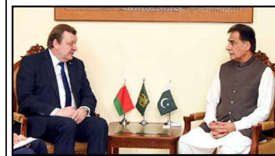
ISLAMABAD: Federal Minister for Economic Affairs, Sardar Ayaz Sadiq exchanging views with Sergei Aleinik, Foreign Minister of Belarus during meeting held in Islamabad.

semi-domestic," he said. He said the government set up large wind and solar-based power generation projects. Power generation from local Thar coal has also jumped to over 2,500 MW, he said. He said no one could deny the importance of Thar coal. Power generation from local resources helped a lot to keep the power base tariff unchanged, he added. He said fuel cost adjustment (FCA) remained negative during the last winter and its benefit was also passed on to the consumers.