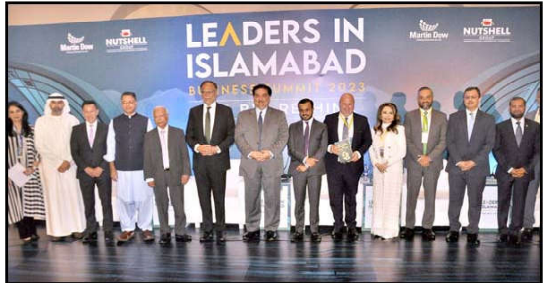
ISLAMABAD: Group photo of Federal Minister for Planning & Development Ahsan Iqbal along with Federal Minister for Energy Khurram Dastagir Khan during the 2-days conference "Leaders in Islamabad Business Summit 2023".

regime that scandalized the CPEC-related projects and stopped the economic boom and foreign investment pouring into the country during the last tenure of the Pakistan Muslim League-Nawaz (PML-N) government. He recalled that there was an economic boom during the PML-N's last tenure, adding in 2017, the ambassadors of developed countries including America, Britain, Japan, Germany and France were showing keen interest to invest in the Special Economic Zones (SEZs), under the CPEC.