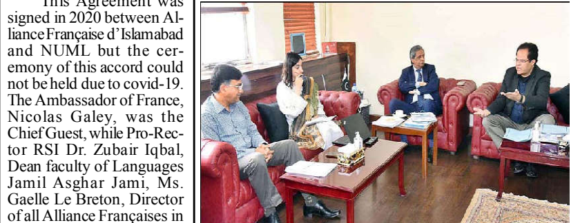
ISLAMABAD: Federal Minister for Law and Justice Senator Azam Nazir Tarar chaired a meeting of the cabinet subcommittee to recommend mechanism to engage foreign law firm of strategy for treaties with investment provisions.