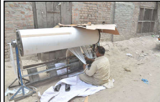
FAISALABAD: A worker busy in his routine work at his workplace outside local factory at Ghulam Muhammad Abad, in City.