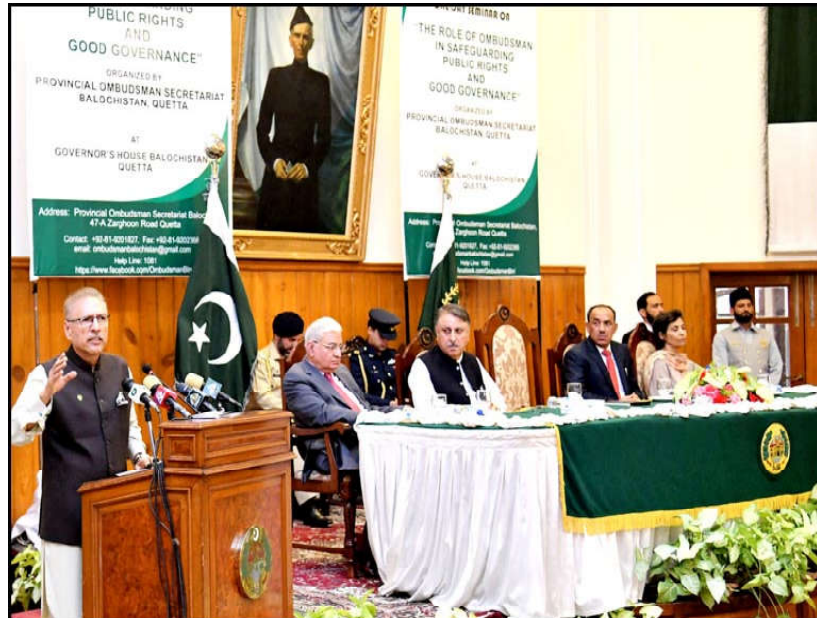
QUETTA: - President Dr. Arif Alvi addressing a seminar on the role of Ombudsmen in safeguarding public rights and good governance, at Governor House

Ph: 2841470/2841473 Vol: XVIII No. 174, Zee'qad 11, 1444 AH Thursday June 01, 2023 Pages 08, Price Rs.15