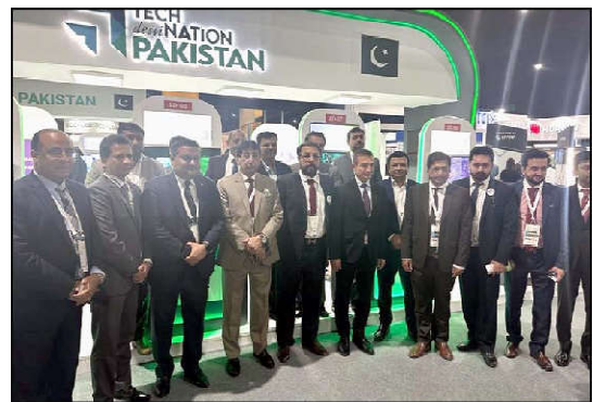
Balochistan Finance Minister Zamrak Khan Achakzai in a group photo with delegations during International Software exhibition in Morocco

ISLAMABAD (APP): Azad Jammu & Kashmir Prime Minister Chaudhry Anwarul Haq Wednesday called on Foreign Minister Bilawal Bhutto Zardari here at Zardari House and discussed matters of mutual interests, including prevailing political situation in the country. FM Bilawal, reiterating the country's continual and consistent support to the Kashmiris' legitimate struggle, said efforts to highlight the Kashmir issue at the international level would be further accelerated in order to sensitize the global community about the early and amicable settlement of the longstanding dispute. The foreign minister also reiterated Pakistan's political, moral and diplomatic support for the Kashmir cause. AJK Minister Raja Faisal Mumtaz Rathore was also present in the meeting, an AJK Government press release said.