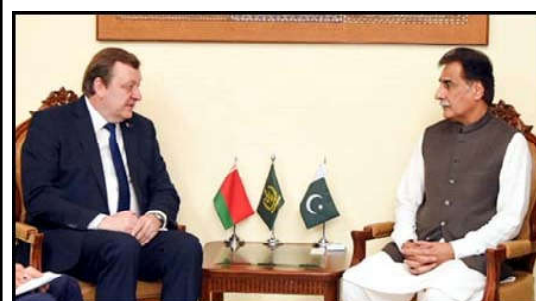
ISLAMABAD: Federal Minister for Economic Affairs, Sardar Ayaz Sadiq exchanging views with Sergei Aleinik, Foreign Minister of Belarus during meeting held in Islamabad.

development. Except for the civilian field, China-Pakistan aviation cooperation in the military field can also be called fruitful. Fighter China-1 (FC-1) is an all-weather, single-engine, multi-purpose light fighter jointly invested and developed by two countries, which Pakistan side calls it Joint Fighter-17 Thunder (JF-17), and equips the Pakistan Air Force as the main fighter. As early as June 1999, the two parties officially signed a cooperative research and development contract, entering the stage of prototype development. On March 12, 2007, the fighter officially entered into service with the Pakistan Air Force.