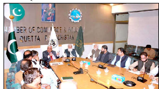
QUETTA: A meeting of the Federal Ombudsman's advisors.

He said that the federal ombudsman advisors are