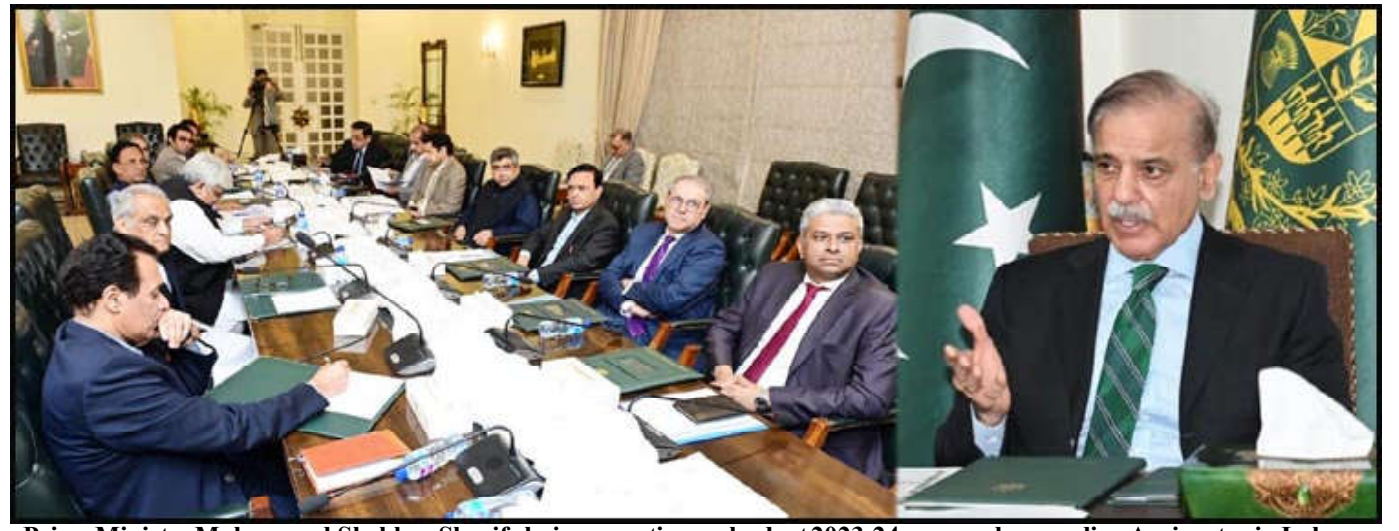
Prime Minister Muhammad Shehbaz Sharif chairs a meeting on budget 2023-24 proposals regarding Agri sector in Lahore.

Under the prime minister's directive, the best-supporting prices over different crops led to the prosperity of farmers which would also boost the upcoming crops, it was added. The prime minister also directed for direct provision of subsidy to farmers on fertilizers. He said that the provision of quality seeds, latest machinery, extension services and for agriculture research, resources would be allocated in the fiscal budget. The prime minister said that practical steps should be incorporated in the fiscal budget for complete conversion of agriculture tube wells on solar energy.