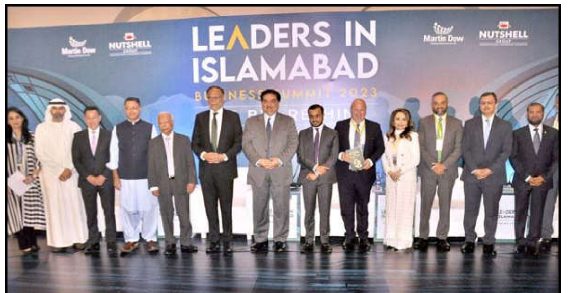
ISLAMABAD: Group photo of Federal Minister for Planning & Development Ahsan Iqbal along with Federal Minister for Energy Khurram Dastagir Khan during the 2-days conference "Leaders in Islamabad Business Summit 2023".

regime that scandalized the CPEC-related projects and stopped the economic boom and foreign investment pouring into the country during the last tenure of the Pakistan Muslim League-Nawaz (PML-N) government. He recalled that there was an economic boom during the PML-N's last tenure, adding in 2017, the ambassadors of developed countries including America, Britain, Japan, Germany and France were showing keen interest to invest in the Special Economic Zones (SEZs), under the CPEC.