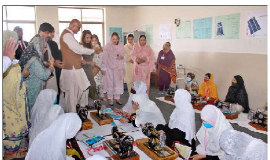
QUETTA: First Lady Samina Alvi visits the Skill Center established by the Social Welfare Department in collaboration with the NAVTTC under the PM Youth Skills Program.

nied by officials, visited the Pakistan Pavilion, where the Balochistan government launched its e-procurement software. Federal Minister for IT and Telecommunication, Syed Aminul Haque, briefed Provincial Minister Engineer Zamarak Khan Achakzai about the Digital Pakistan vision, current challenges, and future goals of the government in Pakistan Pavilion. Pakistan Pavilion is also hosting the Pakistan Software Export Board and All Pakistan Software Houses Association.