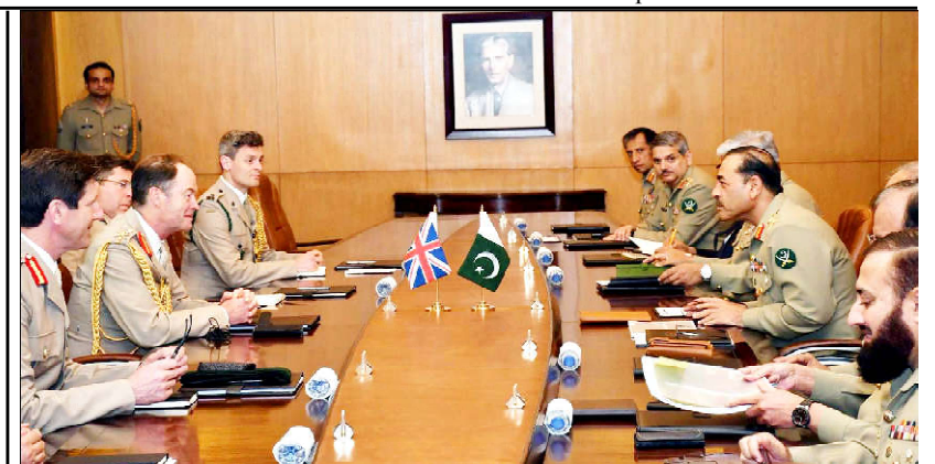
RAWALPINDI: Chief of Army Staff (COAS), General Asim Munir and General Sir Patrick Nicholas Yardley Monrad Sanders, Chief of General Staff (CGS) UK Army held a delegation level talk held at General Headquarters (GHQ) in Rawalpindi.

In this regard, he also reiterated his invitation to the Belarusian president to undertake a visit to Pakistan, at his earliest convenience.