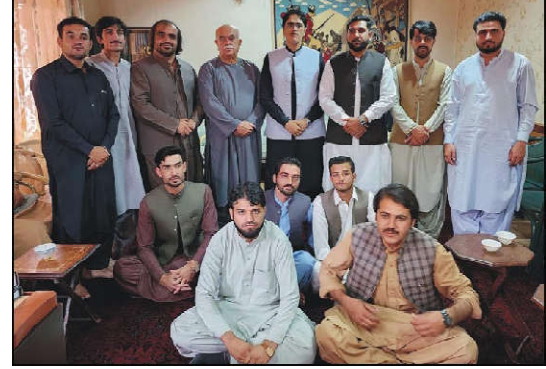
QUETTA: Chairman Pashtoonkhwa Milli Awami Party Mehmoood Khan Achakzai in a group photo with members of organizing committee of Pashtoonkhwa Students Organization District Quetta

ISLAMABAD (APP): Pakistan Nuclear Regulatory Authority (PNRA) on Wednesday granted an operating license to Karachi Nuclear Power Plant Unit-3 (K-3) upon completion of the regulatory review & assessment and inspection processes of the licensing submissions and satisfactory resolution of all regulatory issues. According to a press release received here, K-3 is a Chinese-designed (Hualong One) Pressurized Water Reactor (PWR) and it is the second such unit deployed at the Karachi site adding 1100 MWe to the national grid. In June 2022, PNRA granted an operating license to its sister unit, Karachi Nuclear Power Plant Unit-2 (K-2), having the same generation capacity.