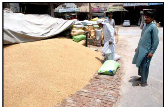
BAHAWALPUR: Customers are buying wheat from a roadside vendor at Grain Market.