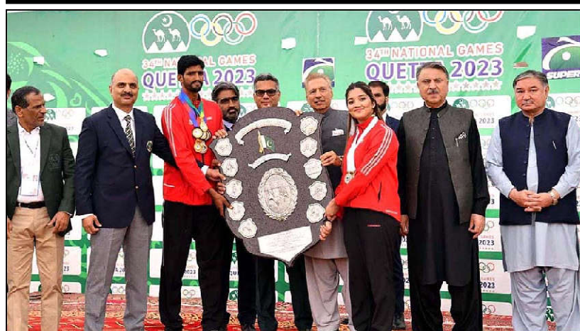
QUETTA: President Dr. Arif Alvi giving the winner's trophy to the Pakistan Army team, at the closing ceremony of the 34th National Games.