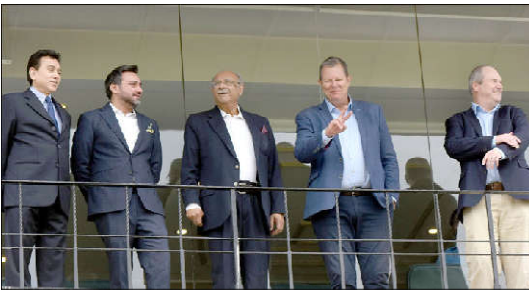
LAHORE: Chairman International Cricket Council (ICC) Greg Barclay visiting the Gaddafi Stadium along with Chairman Pakistan Cricket Board (PCB) Najam Sethi for supervision as ahead of Asia Cup in Provincial Capital.

MUZAFFARABAD (APP): Four people including technical experts and labourers died and three workers sustained injuries after the under-construction Bailey Bridge slipped and fell while being placed on the pillars with the help of heavy machinery in Dhani area of Naseerabad tehsil in Muzaffarabad district. According to police, the Bailey Bridge was being constructed to connect Dhani and Ghandi areas in the lower Neelam valley when it slipped and fell while being placed on the pillars.