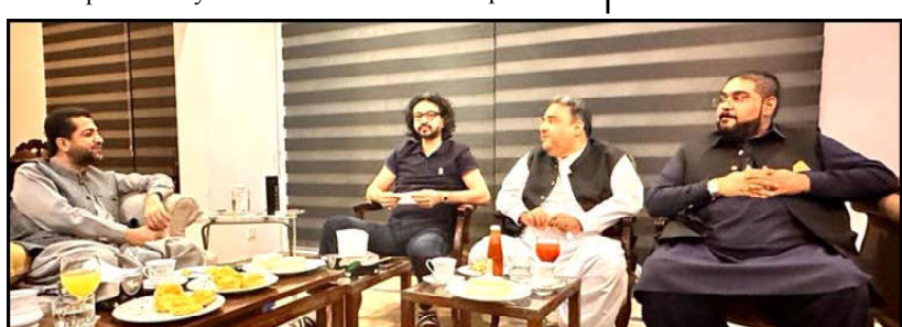
LAHORE: Balochistan Home Minister Mir Ziaullah Langoo meeting with former Deputy Speaker Punjab Assembly Dost Muhammad Mazari. Senator Danesh Kumar and DG PDMA Jan Zaib are also present

State-of-the-art runway pathways, designed to international standards, have been prepared for use. They provide landing and takeoff paths for runways, taxiways, aprons, and other areas where aircraft are operated. The runway surface has been designed to withstand the weight of heavy aircraft. Modern airfield facilities, including painted runway centerlines and high-intensity lighting, ensure safe landing and takeoff operations, even during adverse weather conditions. The ATC tower, runway, apron, taxiway, operational building, complex registration office, water supply system, PTCIL fiber optic, desalination plant, grid station, and security system have all been completed on the 4,300-acre site, making the New Gwadar International Airport Pakistan's largest airport under construction.