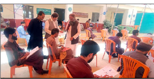
MASTUNG: Members of Chief Minister Inspector Team inspecting test held for recruitment of teachers