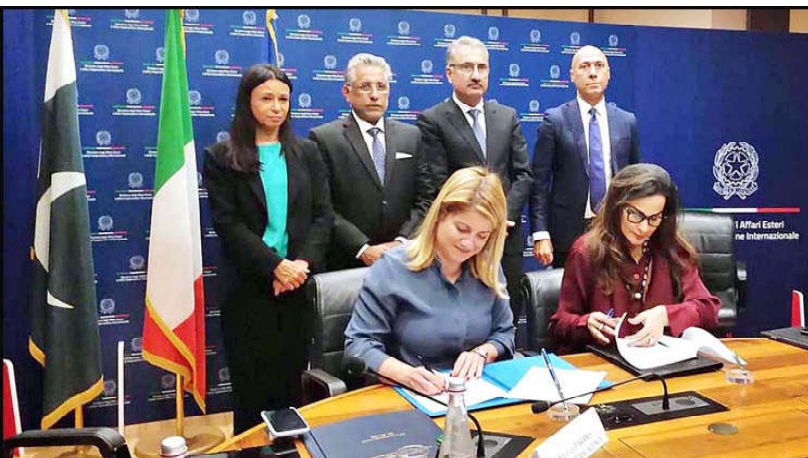
ITALY: Federal Minister for Climate Change Senator Sherry Rehman and Italy's Deputy Minister for Foreign Affairs and International Cooperation Maria Tripodi signing an important 'Roadmap for Cooperation' covering climate change, trade and investment, heritage, culture, agriculture, higher education, technical cooperation and technology transfer in reference areas.

by the UN in building peace, ensuring security and development across the world could not be done by any other institution. She said over 4,300 Pakistani peacekeepers, including female officers, were currently serving with distinction under the UN flag. Spokesperson Minister of Foreign Affairs Ambassador Mumtaz Zahra Baloch said the event was jointly organized by the ministry and the United Nations Development Programme (UNDP). Resident Representative UNDP Pakistan Knut Ostby informed the audience that currently over 87,000 peacekeepers from across the world were deployed under the UN peacekeeping missions to ensure global peace and development.