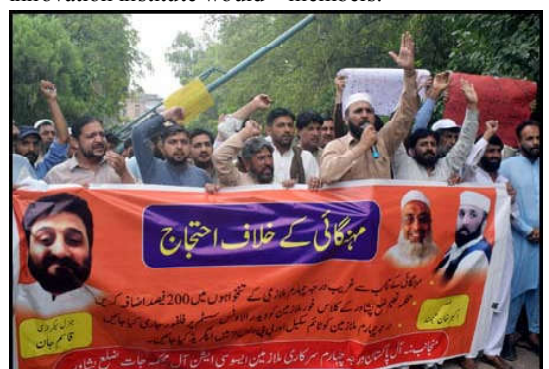
PESHAWAR: Members of All Class Four Government Employees Association are holding protest demonstration for acceptance of their demands, at Peshawar press club.