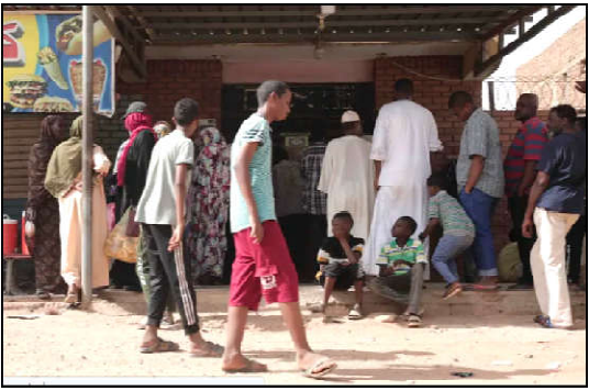
People line up in front of a bakery during a ceasefire in Khartoum.

York, where he briefed the Security Council on the situation in Sudan earlier this week. There is no information on when he is due back in Sudan, where authorities have not given out visas to foreign nation-