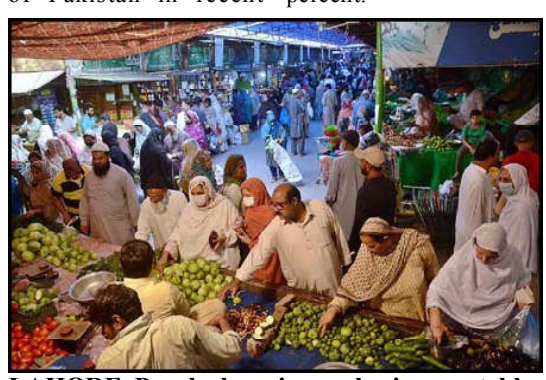
LAHORE: Peoples busy in purchasing vegetables

There was a time As Pakistan was in when Pakistan was the urgent need of foreign second most dependent exchange to stabilize its country on textile with textile respect to exports after Bangladesh due to high subsequently enhancing global demand and availability of raw material textile item can help a lot in abundance but these in employment generation exports witnessed a prominent decline in recent years. The share of textile Once known as the exports also declined to 45 percent of the total exports economy, the textile sector of the country from 65