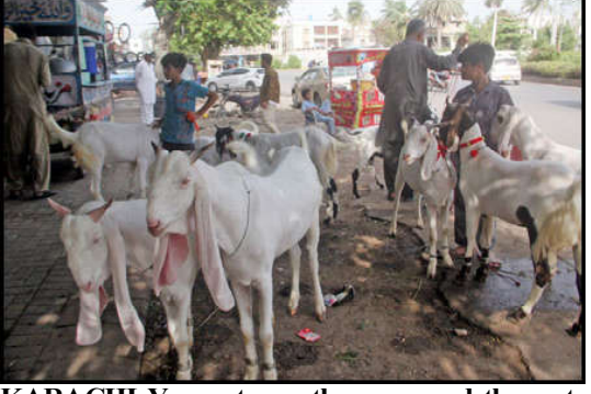
KARACHI: Youngsters gather surround the goats at Peoples Churangi as such scene will be seen common for the upcoming Eid-ul-Adha in Provincial Capital.

that other regional associations like EU, ASIAN, NAFTA are doing very well and they are getting regional benefits but it's still unfortunate for us, that we couldn't utilise SAARC