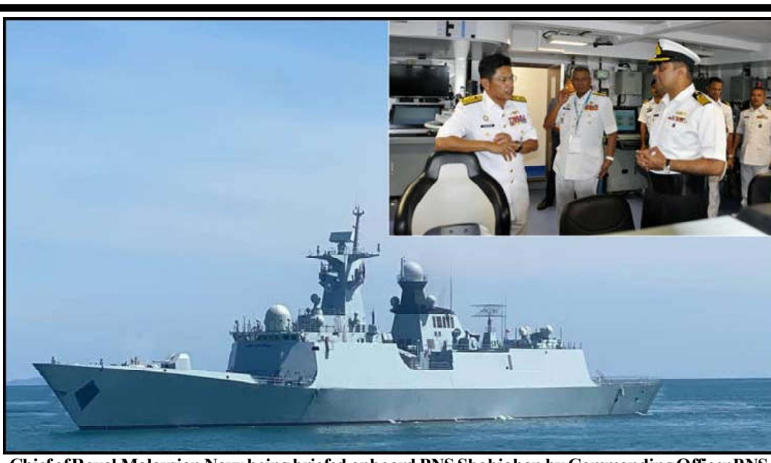
Chief of Royal Malaysian Navy being briefed onboard PNS Shahjahan by Commanding Officer PNS Shahjahan during PNS Shahjahan visit to Port Langkawi, Malaysia.