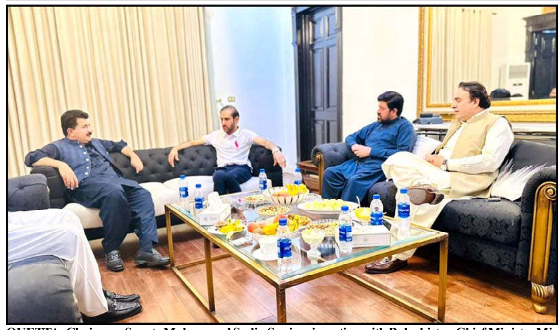
QUETTA: Chairman Senate Muhammad Sadiq Sanjrani meeting with Balochistan Chief Minister Mir Abdul Quddus Bizenjo. Senators Muhammad Abdul Qadir and Kohda Babar are also present

Ph: 2841470/2841473 Vol: XVI No. 23, Zee'qad 08, 1444 AH Monday May 29, 2023, Pages 08, Price Rs. 15