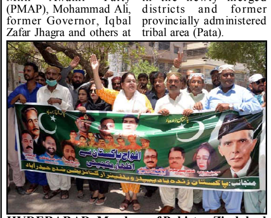
HYDERABAD: Members of Pakistan Zindabad Peoples Welfare Organization are holding rally in support of Pakistan Armed Forces, at Hyderabad press club.

upcoming annual budget. Meanwhile, a 60member delegation of the business community comprising presidents and other officials of Waziristan, Bajaur, Dir, Swat chambers of commerce also met with the Governor and discussed various economic, social issues including, tax levies in the newly merged