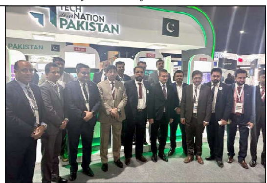
Balochistan Finance Minister Zamrak Khan Achakzai in a group photo with delegations during International Software exhibition in Morocco

Judge Muhammad Bashir said you have filed petition today. Imran Khan while expressing concern over the matter of rule of law in the country said that Pakistan was on 129 number among 140 countries in rule of law index.