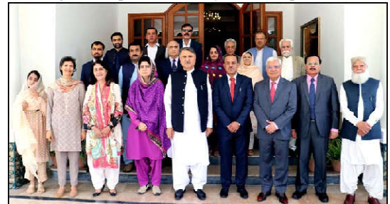
QUETTA: Governor Balochistan Malik Abdul Wali Khan Kakar in a group photo with participants of a seminar on the role of Ombudsman in safeguarding public rights and good governance

Establishment of Regional Grids in Gilgit-Baltistan Phase-I in Astore, Gilgit, Hunza, and Skardu Districts in GB at the revised cost of Rs. 17, 425.57 million with FEC of Rs. 1824.02 million subject to the reconsideration of bidding, construction and engineering estimates by the Planning Ministry. The ECNEC also considered and approved another project of the Government of GB to be executed by W&P Department.