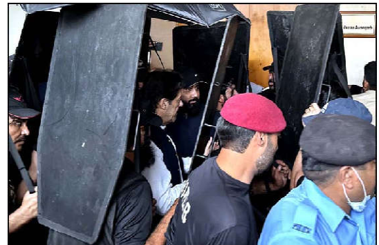
ISLAMABAD: Security personnel with ballistic shields escort former Pakistan's Prime Minister Imran Khan as he leaves from Islamabad High Court.

As per the WHO protocol, it is essential to assess the polio vaccination campaign in the first instance in these settlements to ensure that no child from any marginalized family is deprived of the polio vaccine.