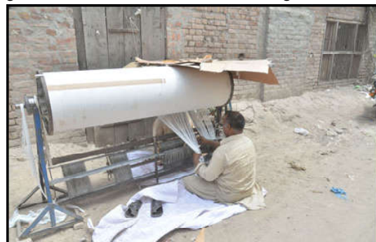
FAISALABAD: A worker busy in his routine work at his workplace outside local factory at Ghulam Muhammad Abad, in City.

KARACHI (APP): Three ships namely, Maersk Atlanta, Maria Elena and Theresa Orion carrying Containers and Palm oil, berthed at Qasim International Container Terminal and Liquid Terminal respectively. Meanwhile two more ships, EM Astoria and Cielo Rosso with Containers and Mogas are also arrived at outer anchorage of the port during the same period. A total of 07 ships were engaged at POA berths during the last 24 hours, out of them three ships, Maersk Atlanta, Hafnia Providence and Theresa are expected to sail on Wednesday. Cargo volume of 169,440 tonnes.