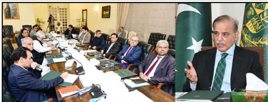
Prime Minister Muhammad Shehbaz Sharif chairs a meeting on budget 2023-24 proposals regarding the Agriculture sector in Lahore