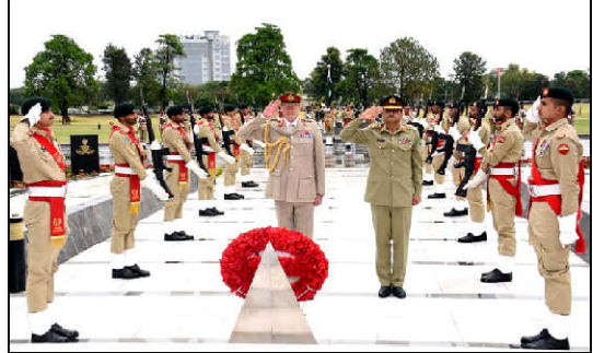
RAWALPINDI: Chief of General Staff (CGS) UK Army, General Sir Patrick Nicholas Yardley Monrad Sanders laid floral wreath at Yadgar-e-Shuhada during his visit to General Headquarters (GHQ) in Rawalpindi.