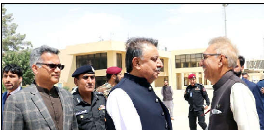
QUETTA: Governor Balochistan Malik Abdul Wali Khan Kakar seeing off President Dr. Arif Ali at Quetta Airport

Foreign Minister Aleinik conveyed the warm greetings of President Lukashenko to the prime minister, while highlighting