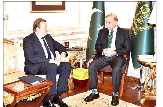
LAHORE: Foreign Minister of Belarus Sergei Aleinik calls on the Prime Minister Muhammad Shehbaz Sharif.

Referring to the living standards of the Holy Prophet Muhammad (PBUH) and the His companions, the president also asked the country's executives to follow them and adopt the living standard of the common man.