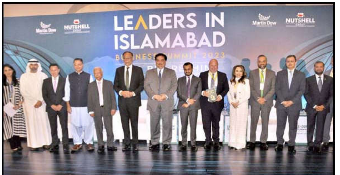
ISLAMABAD: Group photo of Federal Minister for Planning & Development Ahsan Iqbal along with Federal Minister for Energy Khurram Dastagir Khan during the 2-days conference "Leaders in Islamabad Business Summit 2023".

regime that scandalized the CPEC-related projects and stopped the economic boom and foreign investment pouring into the country during the last tenure of the Pakistan Muslim League-Nawaz (PML-N) government. He recalled that there was an economic boom during the PML-N's last tenure, adding in 2017, the ambassadors of developed countries including America, Britain, Japan, Germany and France were showing keen interest to invest in the Special Economic Zones (SEZs), under the CPEC.