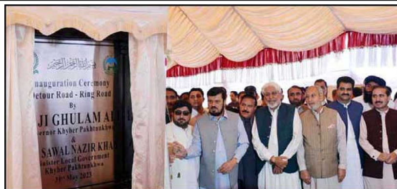
PESHAWAR: Khyber Pakhtunkhwa Governor Haji Ghulam Ali along with Provincial Minister Sawal Nazir inaugurate Detour Road Hayatabad, which is being constructed at a total cost of Rs 1.53 billions.

Development Authority (PDA) officials in their briefing about the project said that the two-way Detour Road with a length of three kilometers was completed at a cost of Rs 1.53 billion. It was told in the briefing that the construction of the road would not only facilitate heavy goods vehicles going to Afghanistan, but the road would also be helpful for commercial traffic.