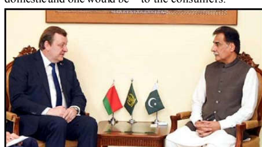
ISLAMABAD: Federal Minister for Economic Affairs, Sardar Ayaz Sadiq exchanging views with Sergei Aleinik, Foreign Minister of Belarus during meeting held in Islamabad.

development. Except for the civilian field, China-Pakistan aviation cooperation in the military field can also be called fruitful. Fighter China-1 (FC-1) is an all-weather, single-engine, multi-purpose light fighter jointly invested and developed by two countries, which Pakistan side calls it Joint Fighter-17 Thunder (JF-17), and equips the Pakistan Air Force as the main fighter. As early as June 1999, the two parties officially signed a cooperative research and development contract, entering the stage of prototype development. On March 12, 2007, the fighter officially entered into service with the Pakistan Air Force.