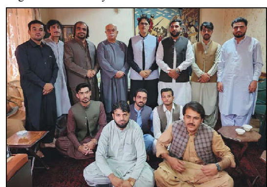
QUETTA: Chairman Pashtoonkhwa Milli Awami Party Mehmood Khan Achakzai in a group photo with members of organizing committee of Pashtoonkhwa Students Organization District Quetta