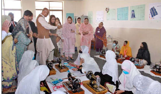
QUETTA: First Lady Samina Alvi visits the Skill Center established by the Social Welfare Department in collaboration with the NAVTTC under the PM Youth Skills Program.

During the Convocation Ceremony Degrees were conferred upon 95 graduates, comprising 54 officers from Pakistan Navy, Army & Pakistan Air Force and 41 officers from friendly countries including Azerbaijan, Bahrain, Bangladesh, Indonesia, Iraq, Jordan, Malaysia, Myanmar, Nigeria, Oman, Palestine, Saudi Arabia, South Africa, Sri Lanka and Yemen, a Pakistan Navy news release said. While addressing the ceremony, the chief guest highlighted the complexities and wide variety of threats and challenges confronting the world impacting almost all regions. He underlined that wide ranging challenges in 21st century coupled with advancements in disruptive technology, proliferation of weapons.